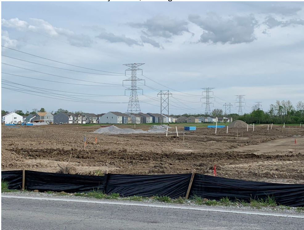
46 th Street frontage, looking southeast