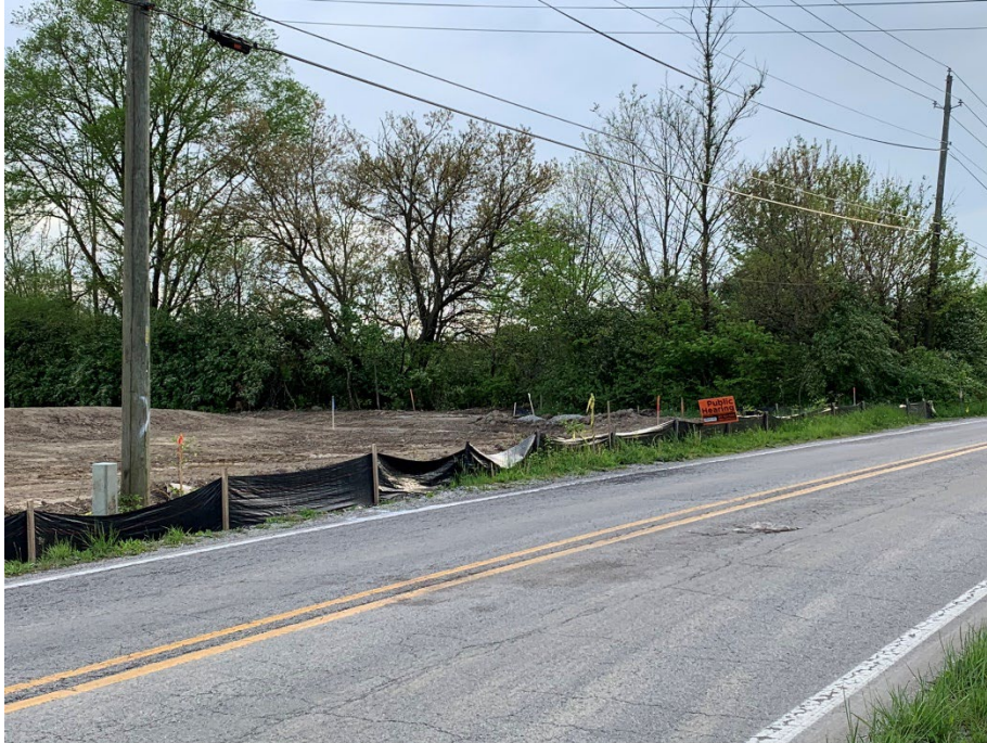
Subject site, looking southwest