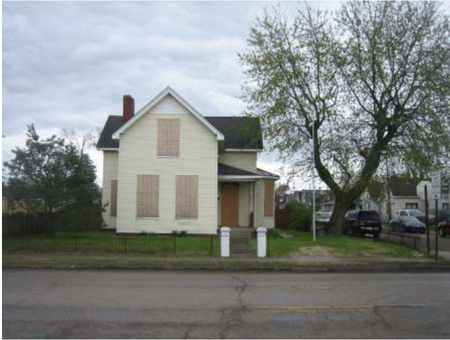
Adjacent single family dwelling use to the east, zoned C-3