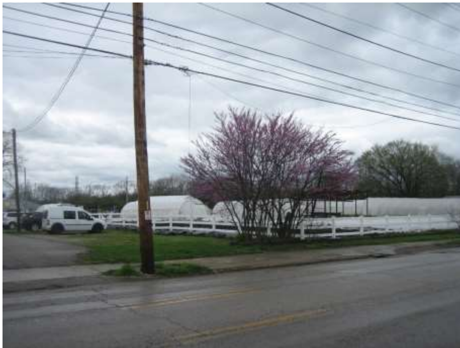
Adjacent urban farm to the north, looking west.