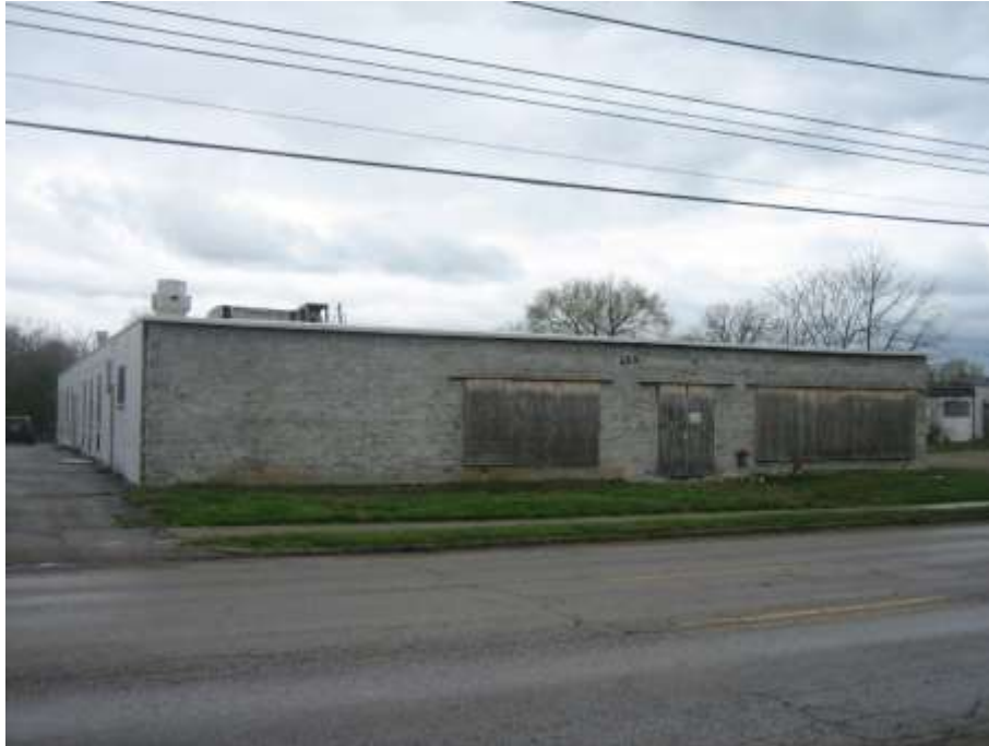
Subject site single family dwelling, looking west