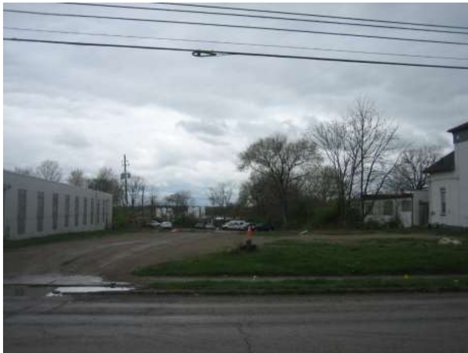
Subject site proposed garage location at back of lit, looking west