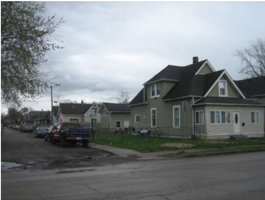
Adjacent single family dwelling use to the east, zoned C-3, with a D-5 protected district further to the east.