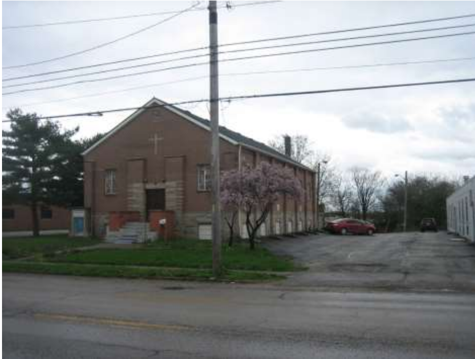
Adjacent religious use to the south zoned C-7, looking west