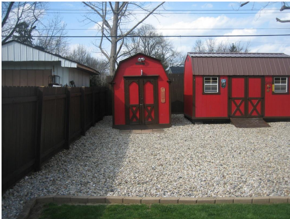
Subject accessory structure (left) encroaching into easement and west side setback, looking north.