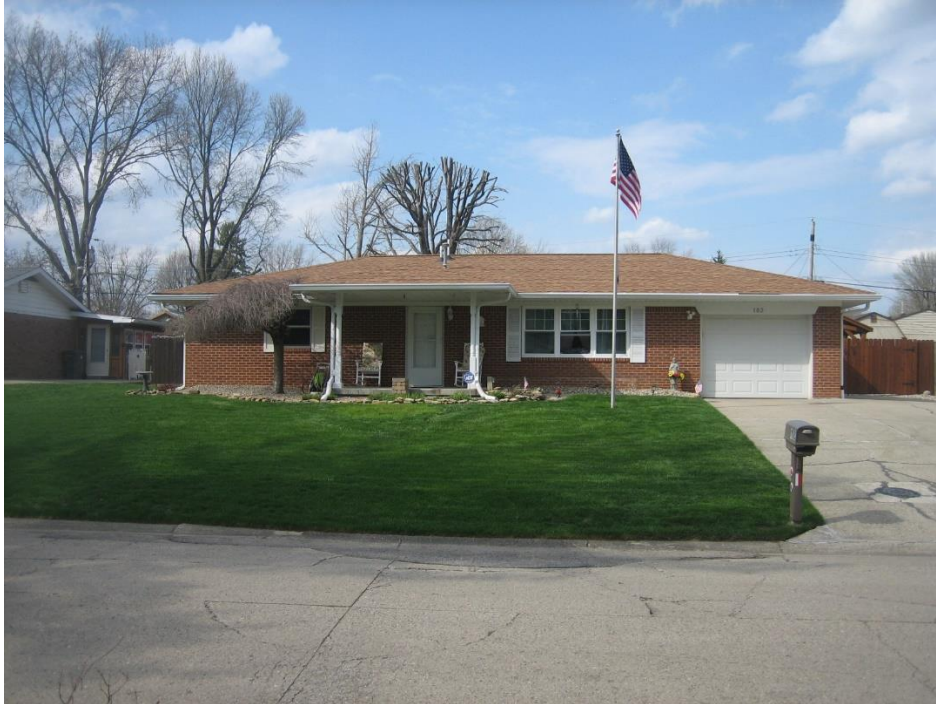
Subject property primary dwelling looking north.