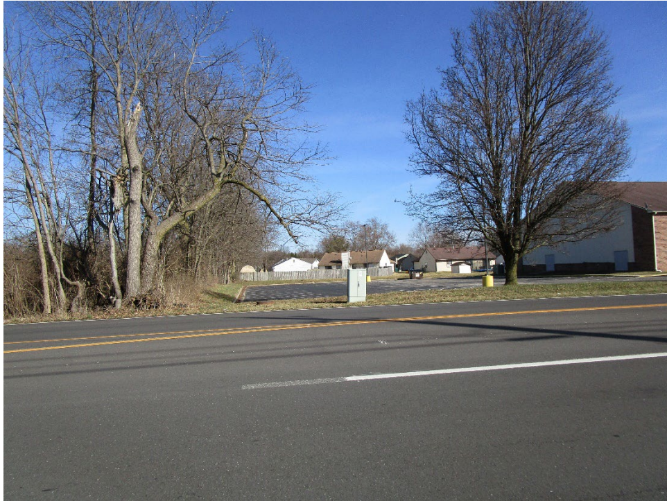
View of southern boundary and adjacent religious uses looking across North Raceway Road