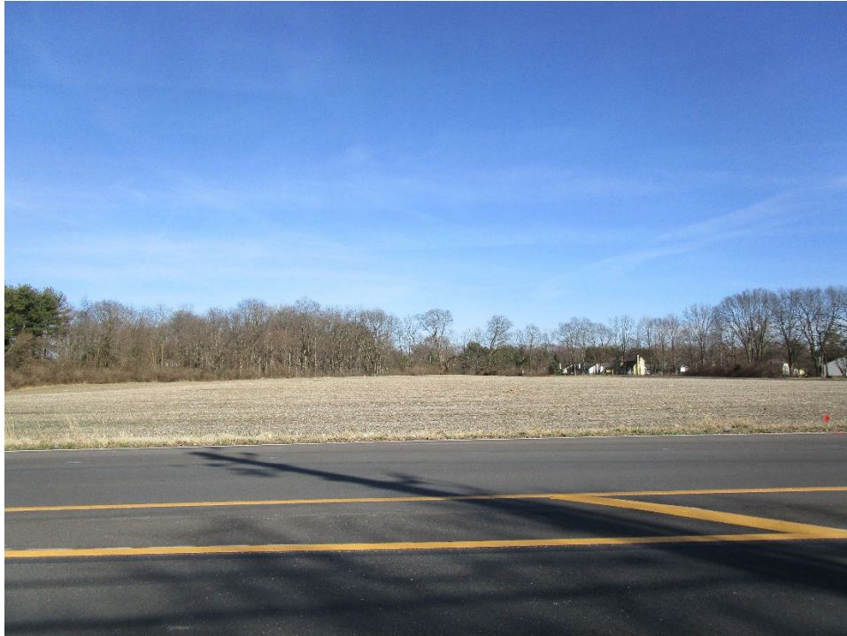
View of site looking east, across North Raceway Road