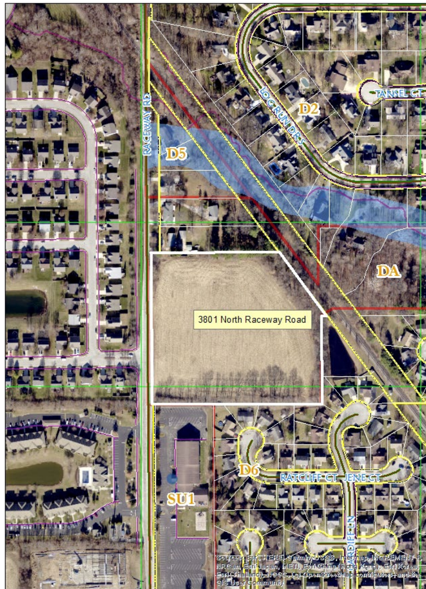
3801 North Raceway Road