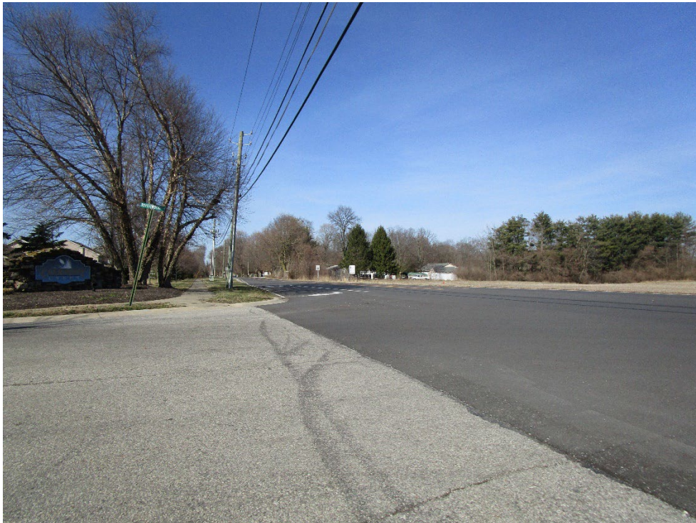
View looking north along North Raceway Road