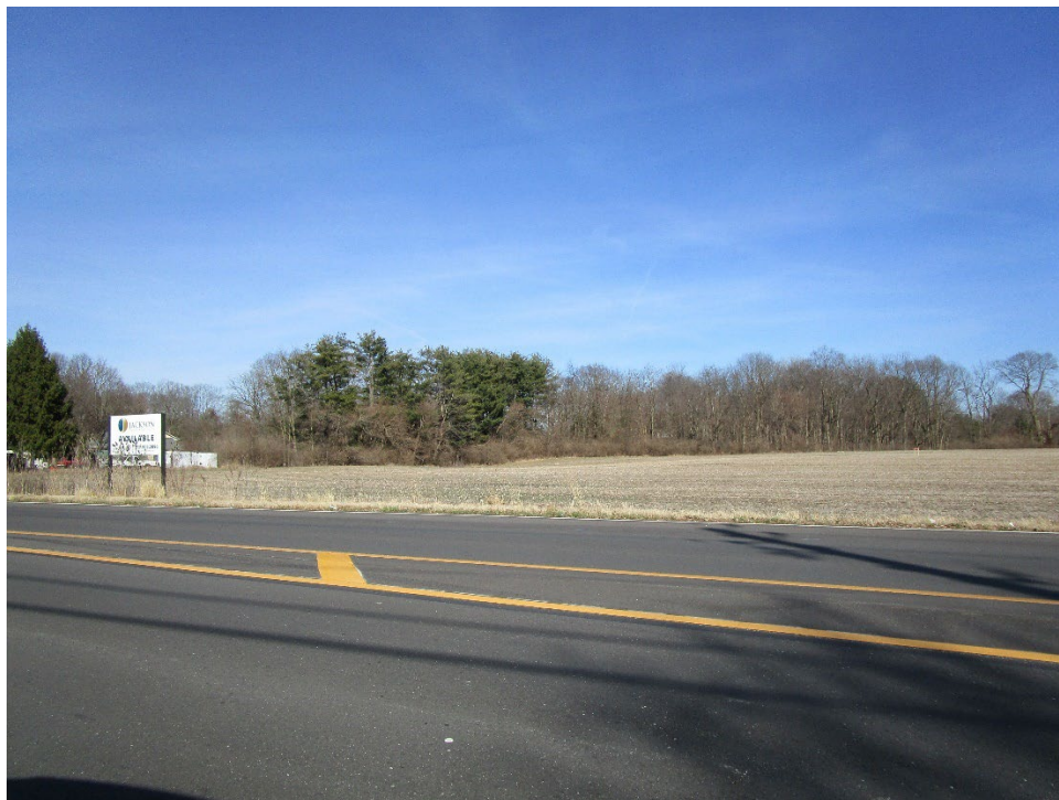
View of site looking northeast across Raceway Road