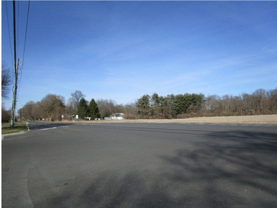
View of site looking northeast across North Raceway Road / Riverwood Boulevard