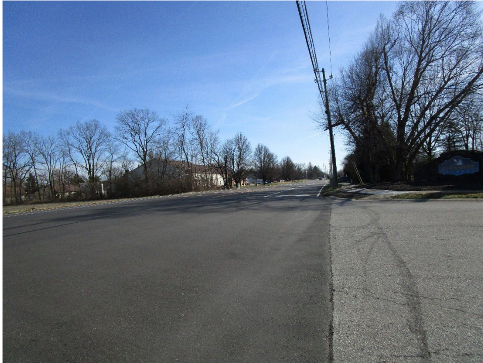
View looking south along North Raceway Road