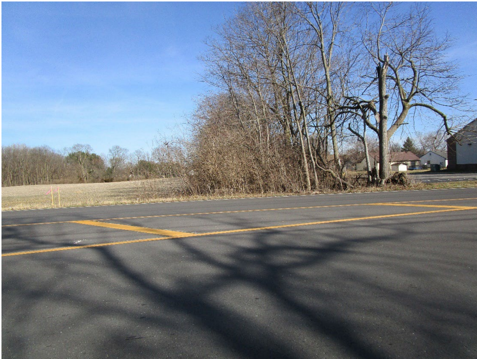
View of site looking southeast across North Raceway Road