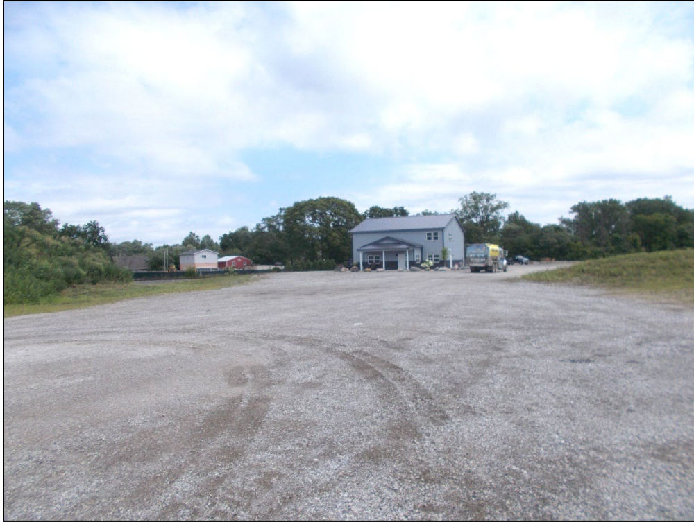
Looking east at the building on the subject site.