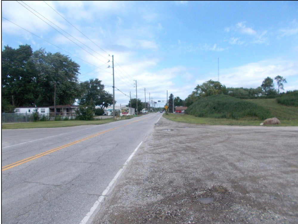
Looking north along the Raceway Road frontage of the site.