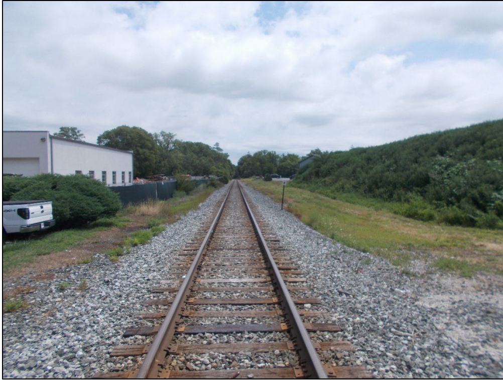
Looking southeast along the CSX railroad tracks. The subject site is to the right.