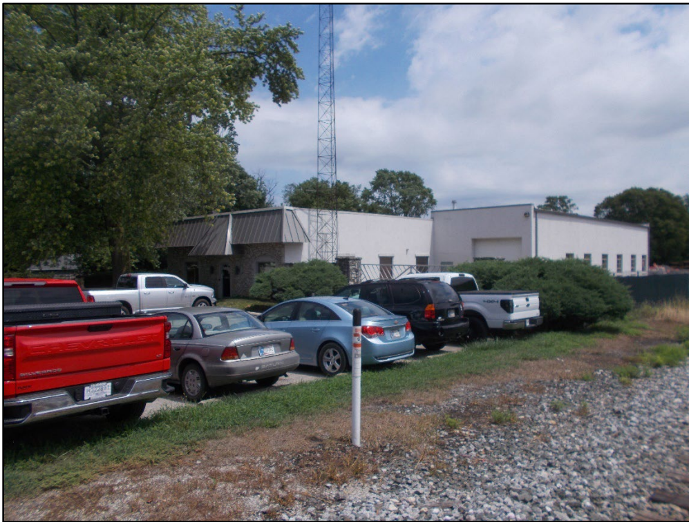
Looking east at the neighbor to the north.