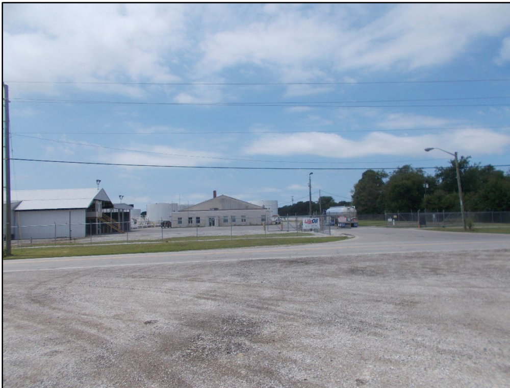
Looking west across Raceway Road at the neighbor to the west.