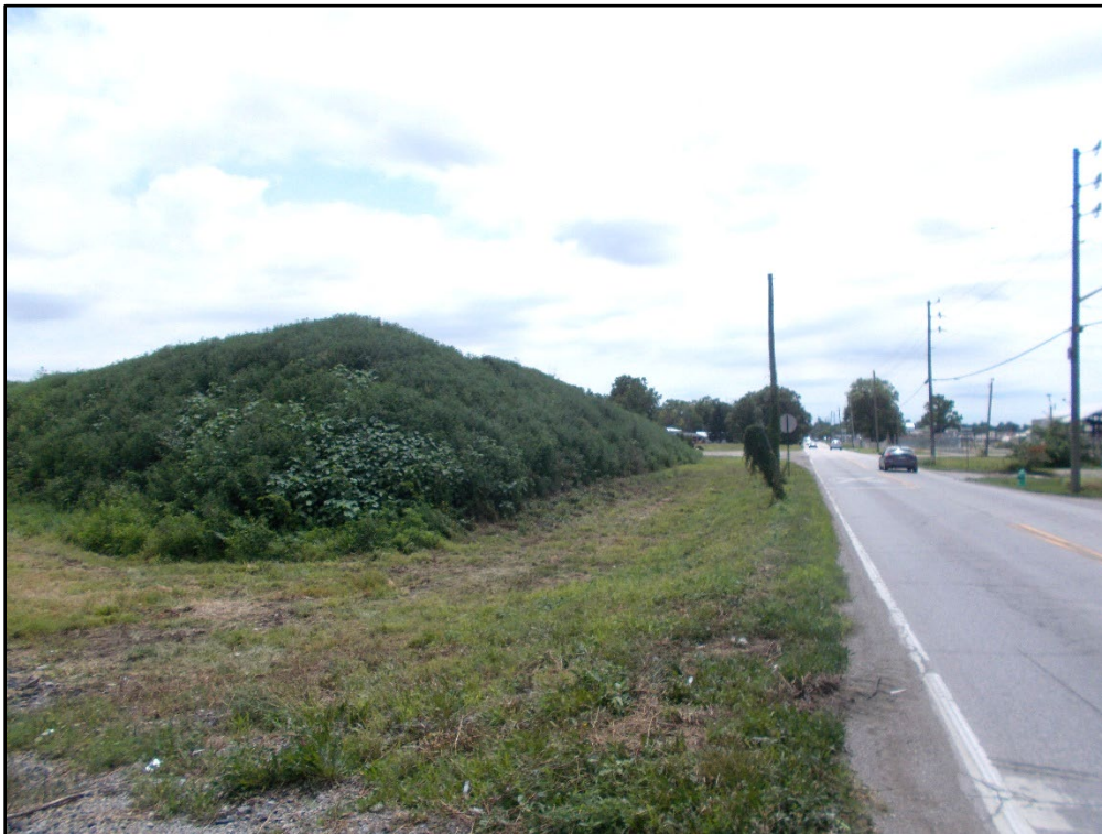
Looking south along the Raceway Road frontage from the northwest corner of the site.