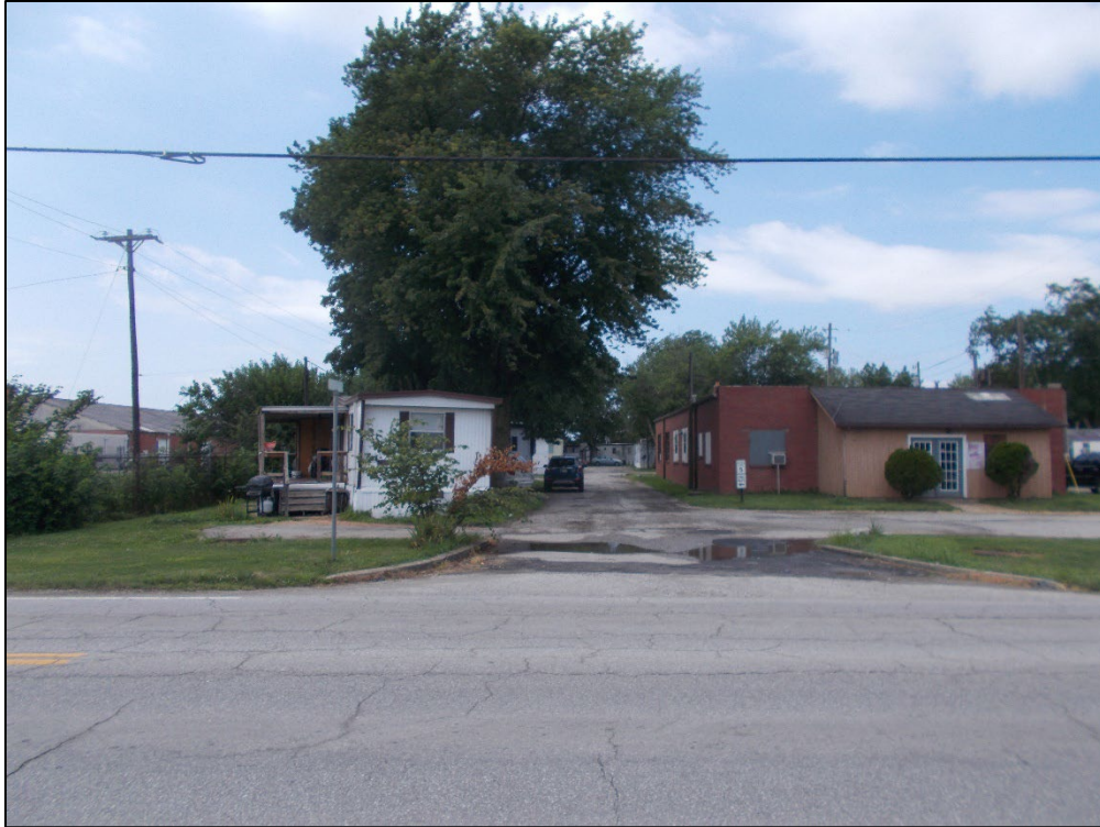
Looking west across Raceway Road at the neighbor to the west.