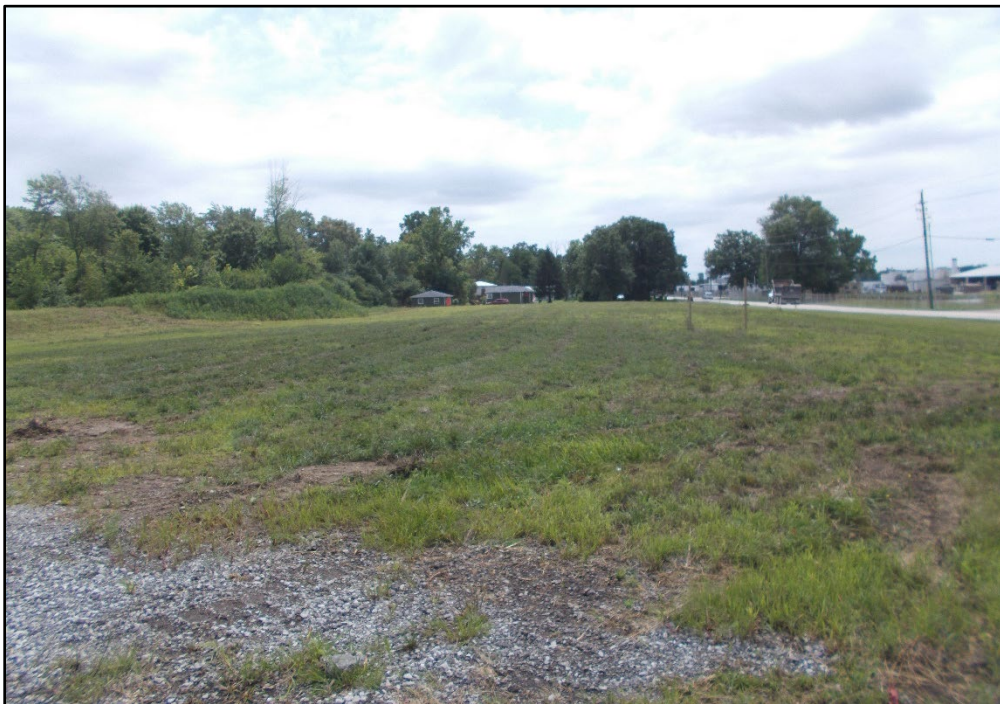
Looking south from the site.