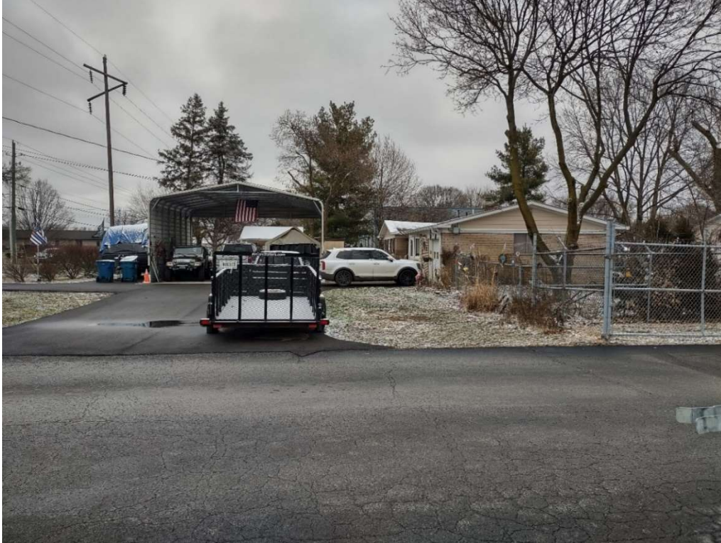
View 1 from south, excessive height of carport

Photos of the Subject Property: 6039 South Harding Street