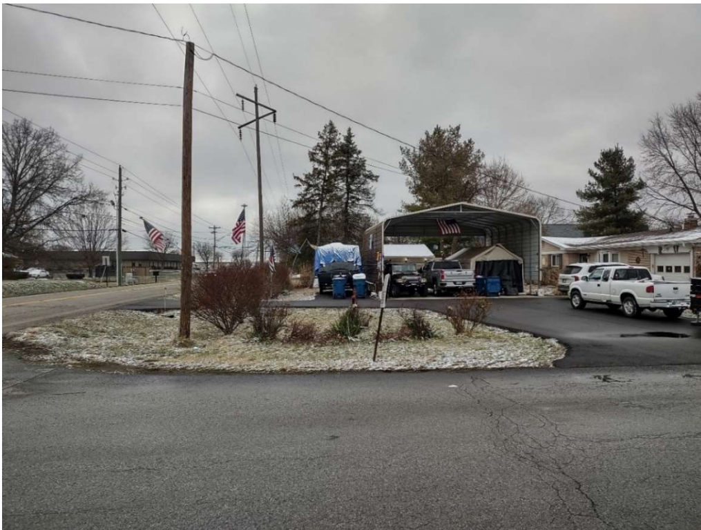
View 2 from south, inadequate front setback