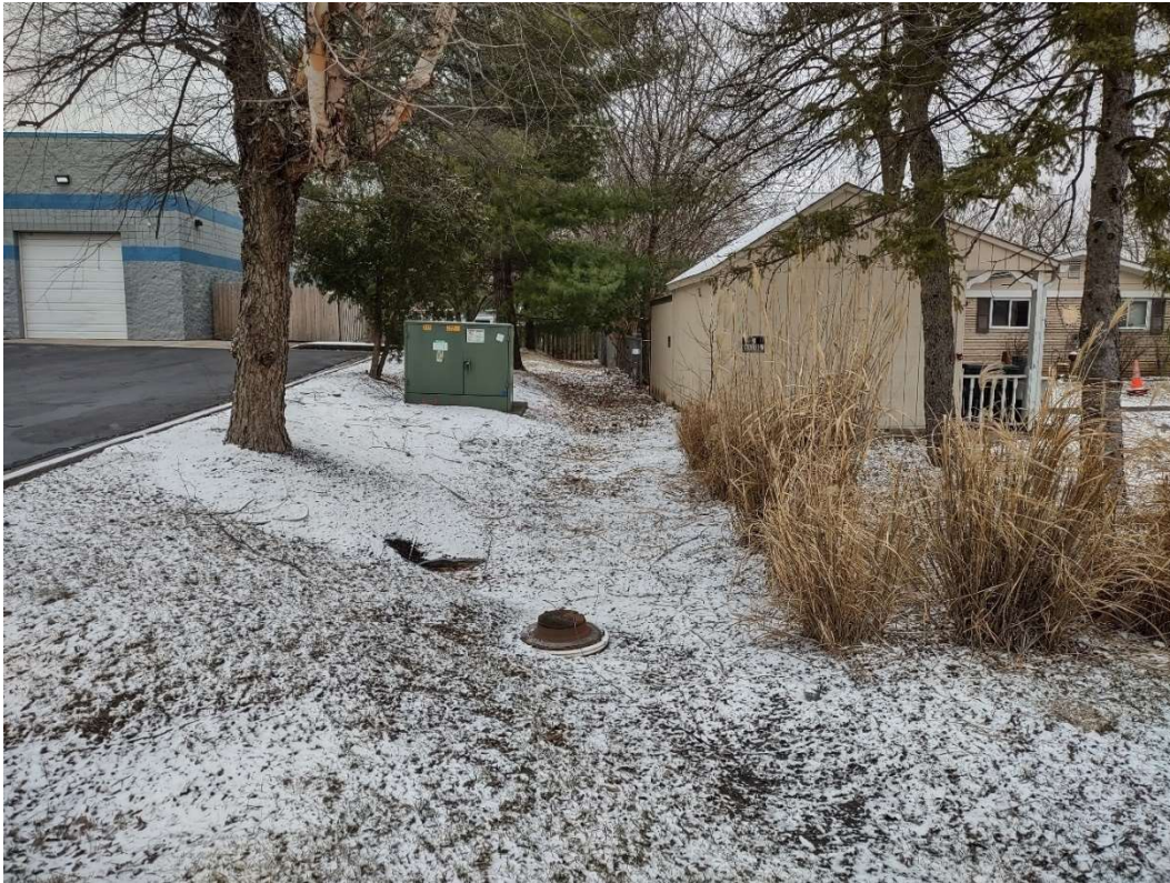
View 1 from west, inadequate side setback from north lot line