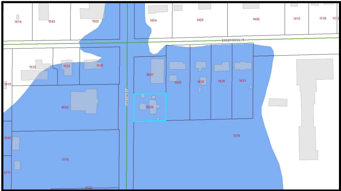
Location map with floodplain