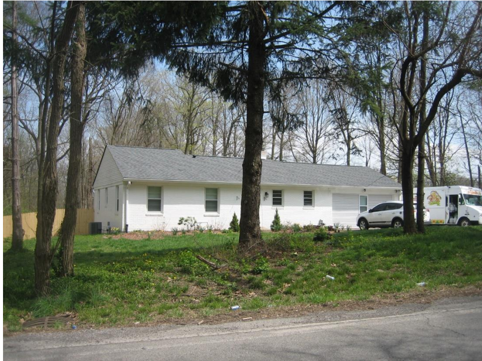
Subject site, single family dwelling, looking east.