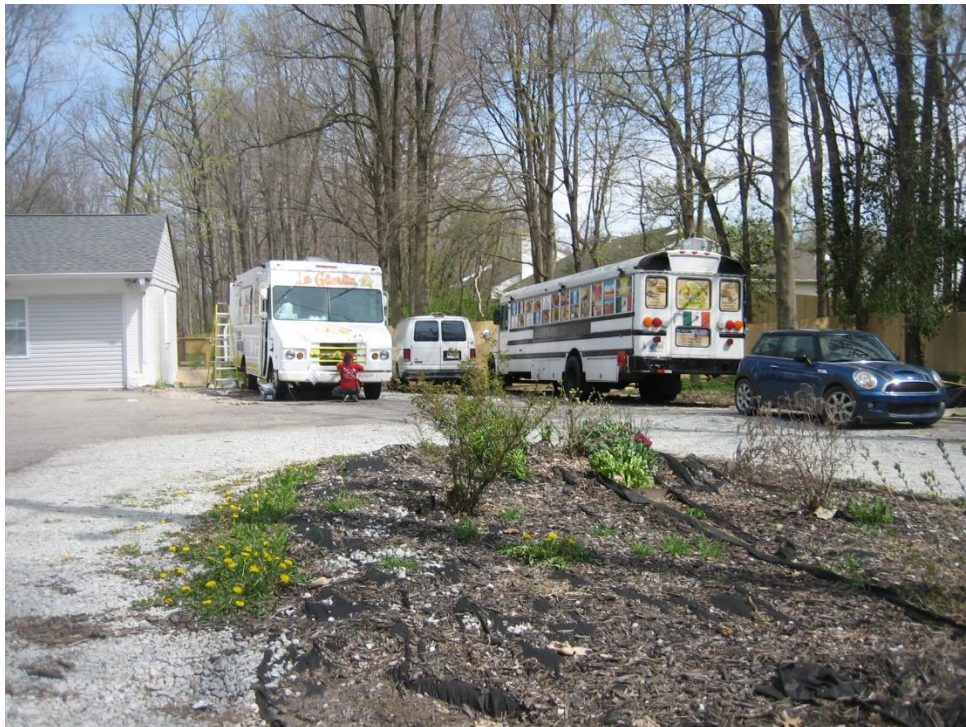
Subject site, two commerical food trucks parked on side of dwelling, looking east