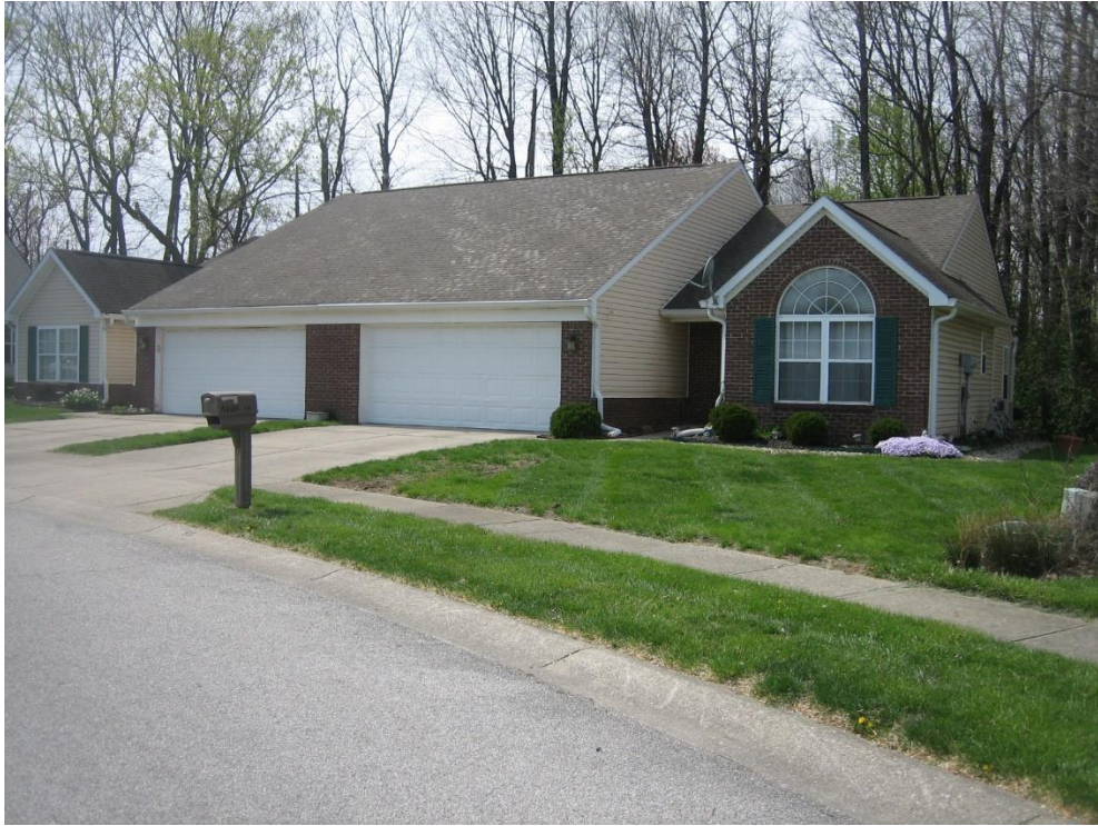
Adjacent two-family dwelling to the south, looking west.