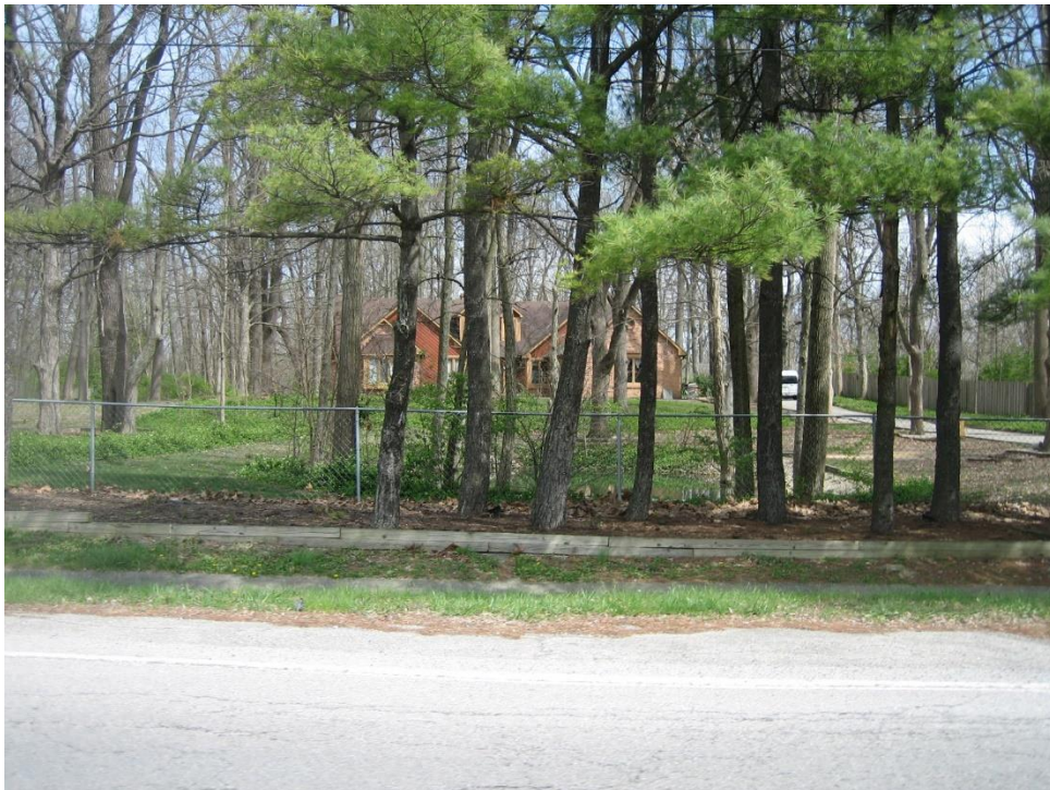
Adjacent single family dwelling to the north, looking east.