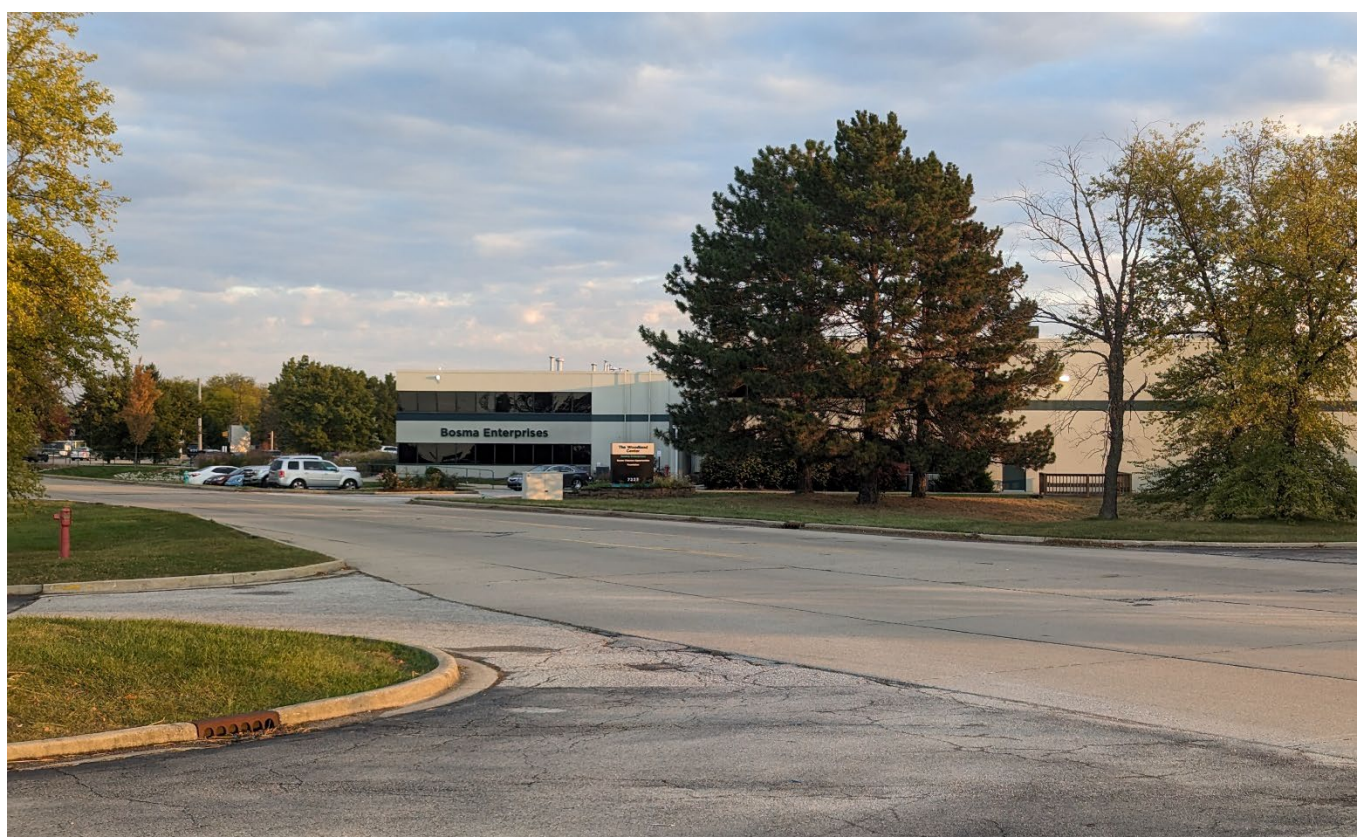
Industrial site north of subject site