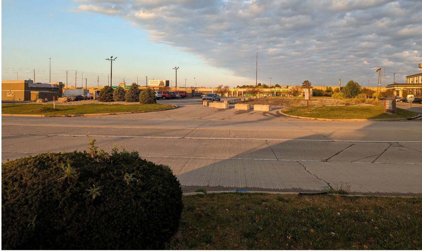
View west from site