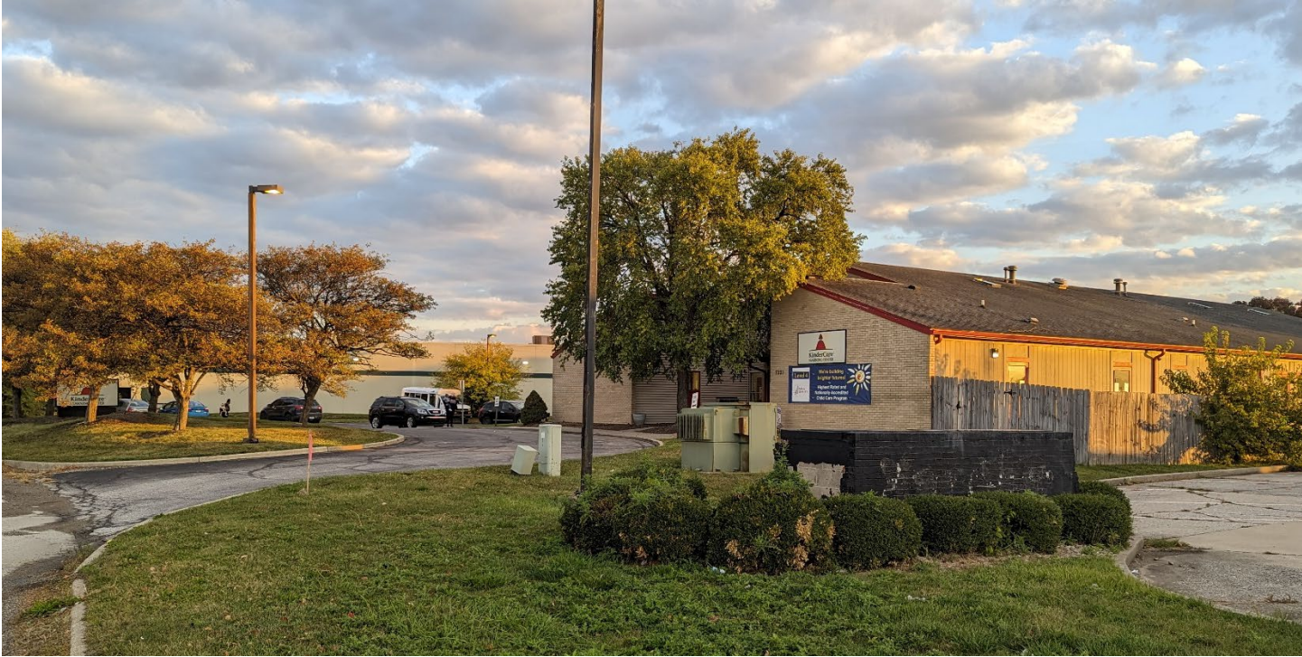
View of north neighbor site (child day care)