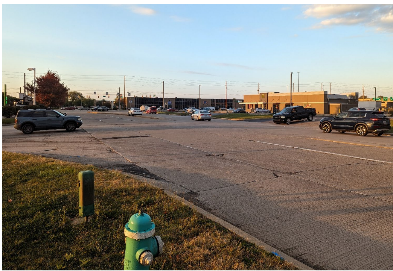
View south (Woodland Dr/71<sup>st</sup> St)