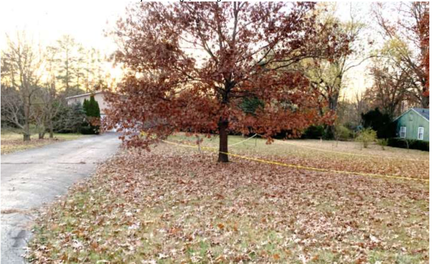
Site viewed from Dover Road, looking west. Existing garage shown left. Adjacent (north) property shown right.