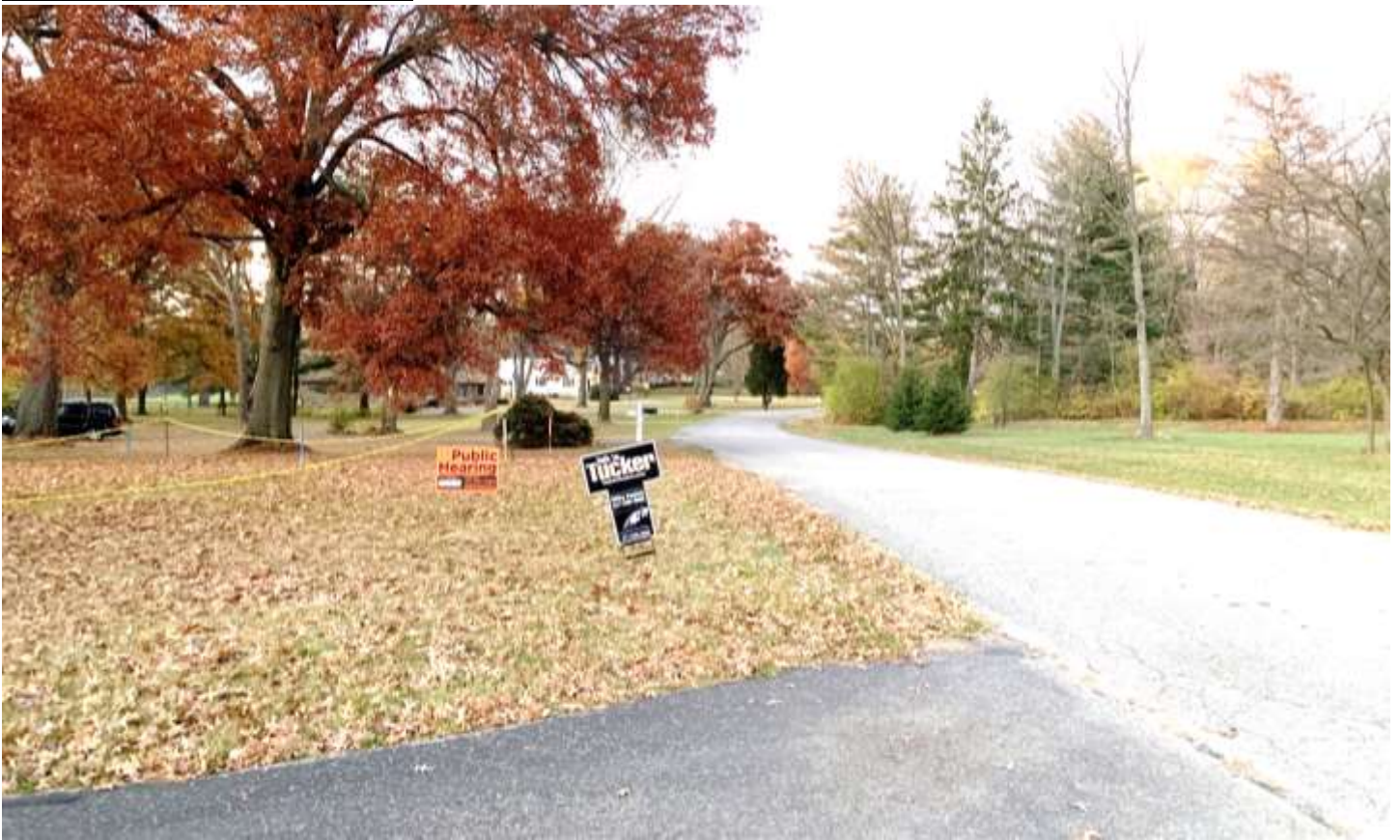
Subject frontage, looking north on Dover Road