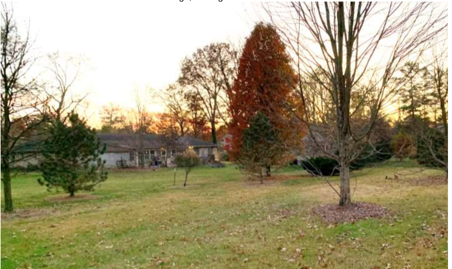
Adjacent property south of site