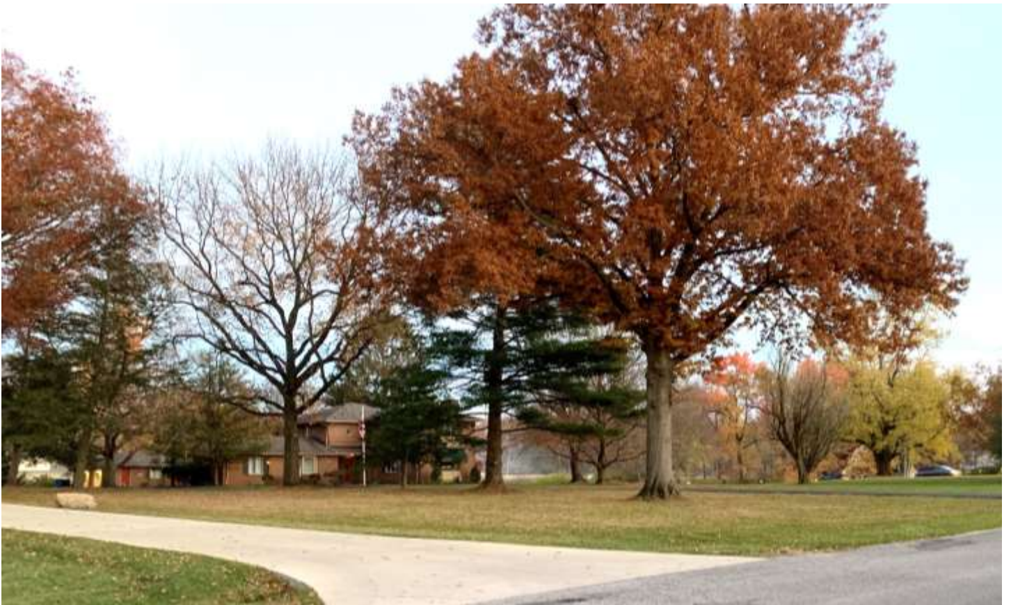
Southeast of site