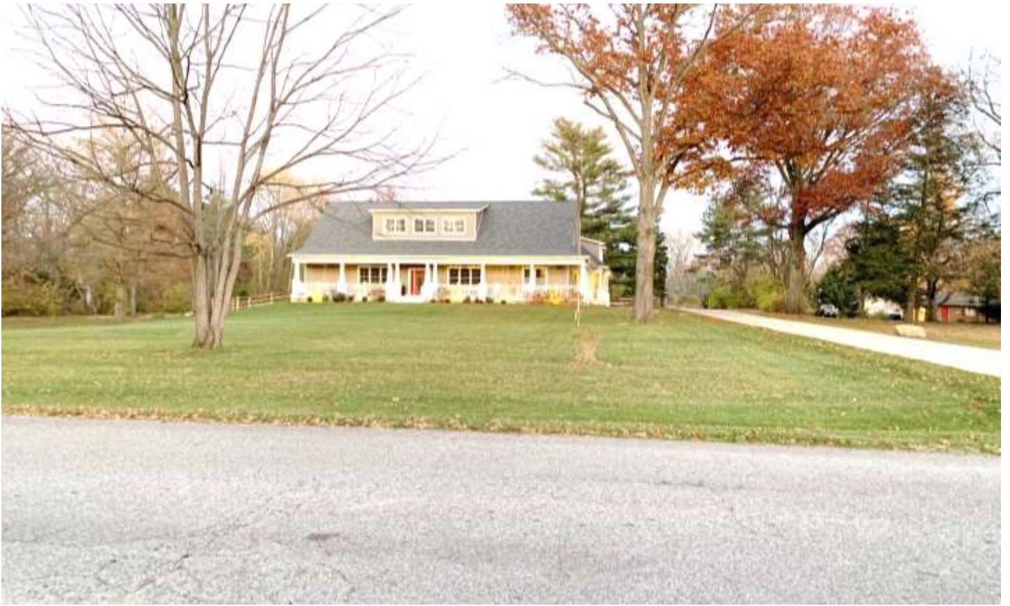
East of site