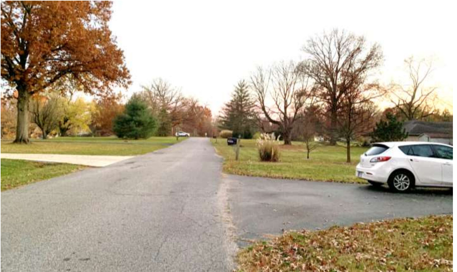
Site frontage, looking south on Dover Road