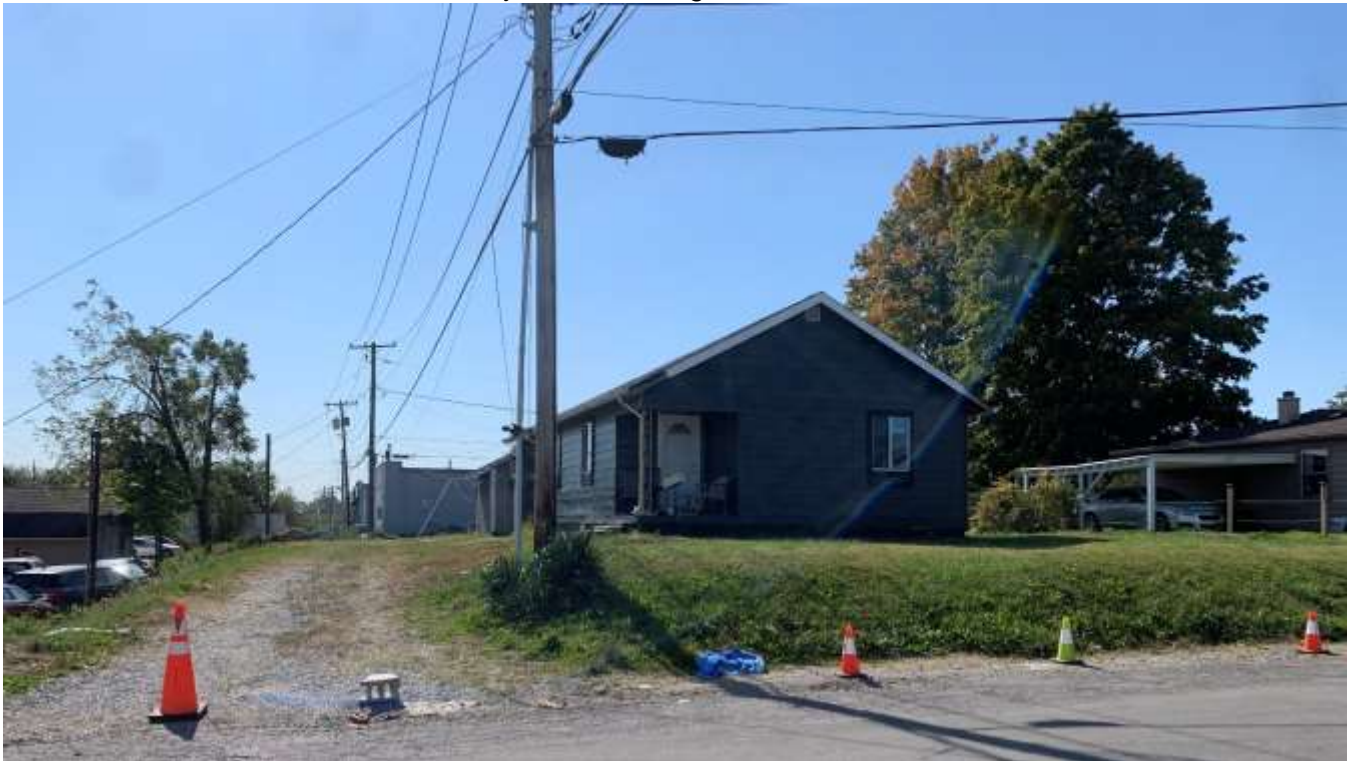
Photo of the single-family dwelling west of the site.