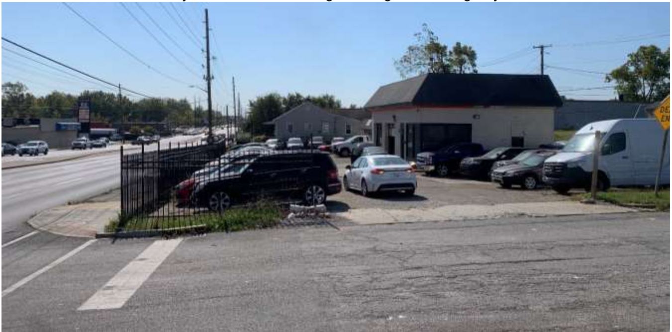
Photo of the subject site looking south from 45 th Street.