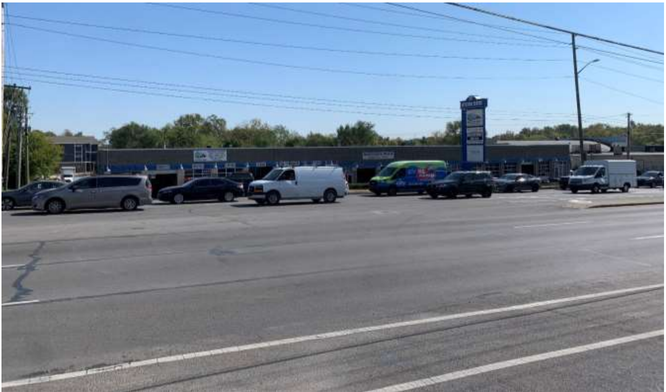
Photo of a commercial shopping strip east of the site.