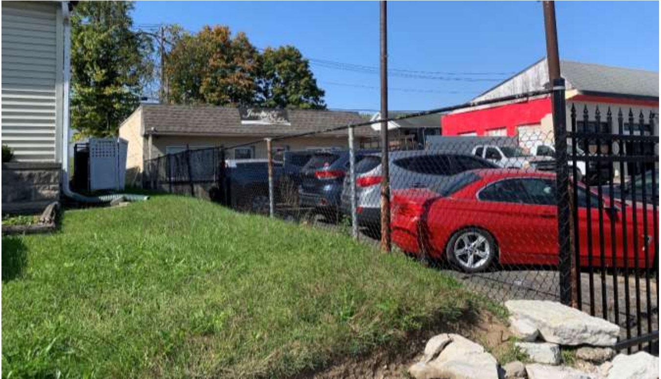
Photo of the subject site at 4460 North Keystone Avenue.