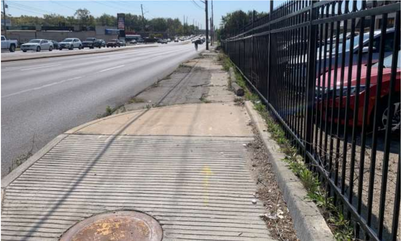
Photo of the subject site's street frontage looking south along Keystone Avenue.