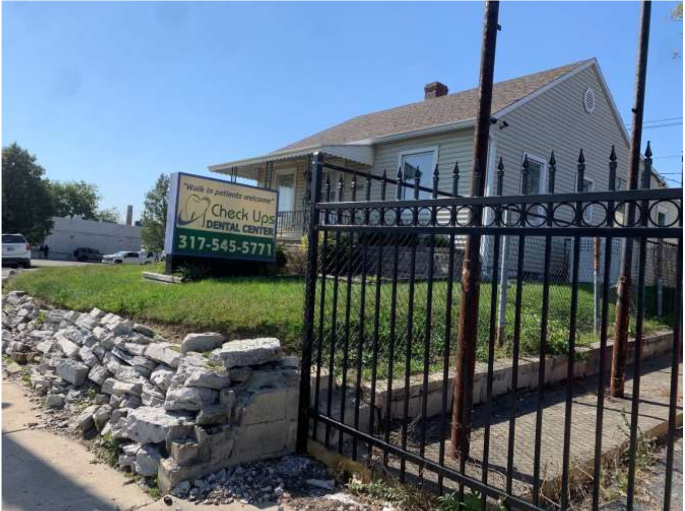
Photo of the dentist office south of the site zoned C-3.