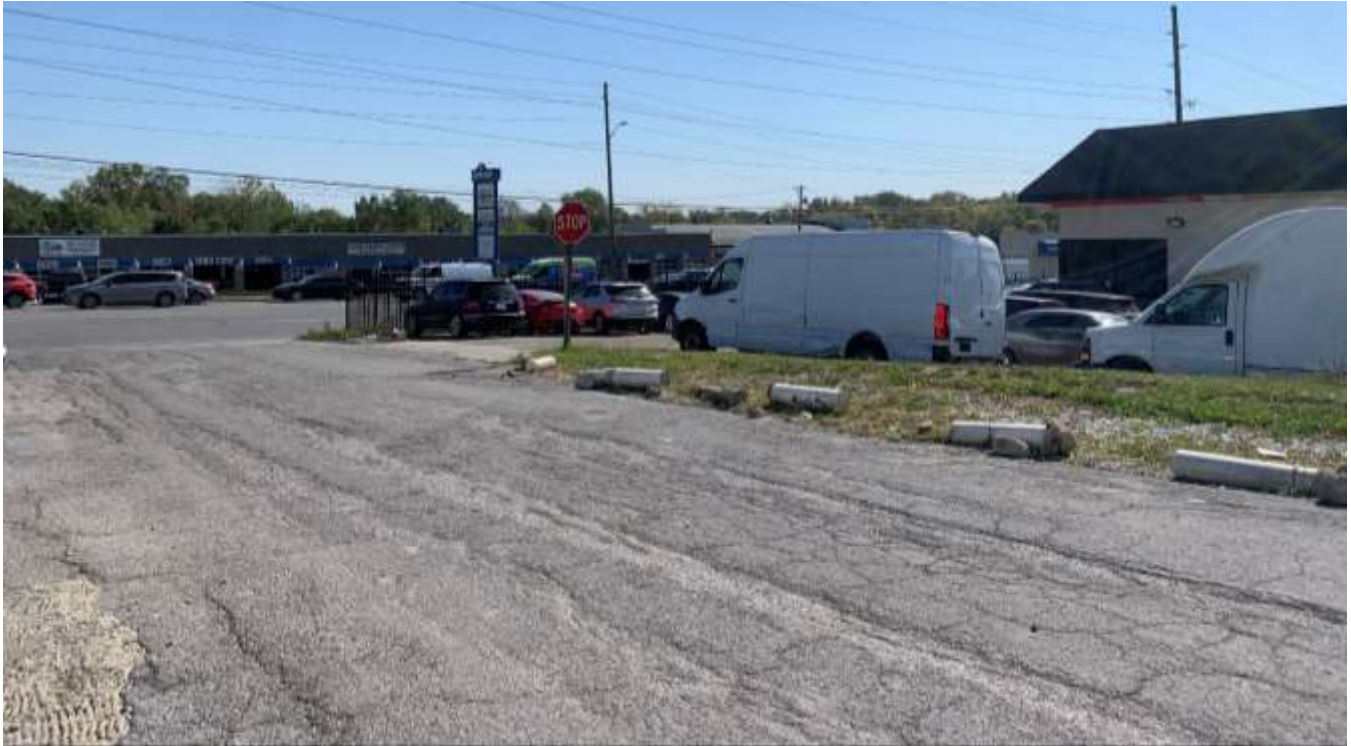
Photo of the subject site looking southeast from 45 th Street.