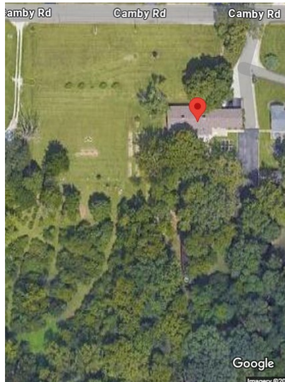
Figure 6 Overview