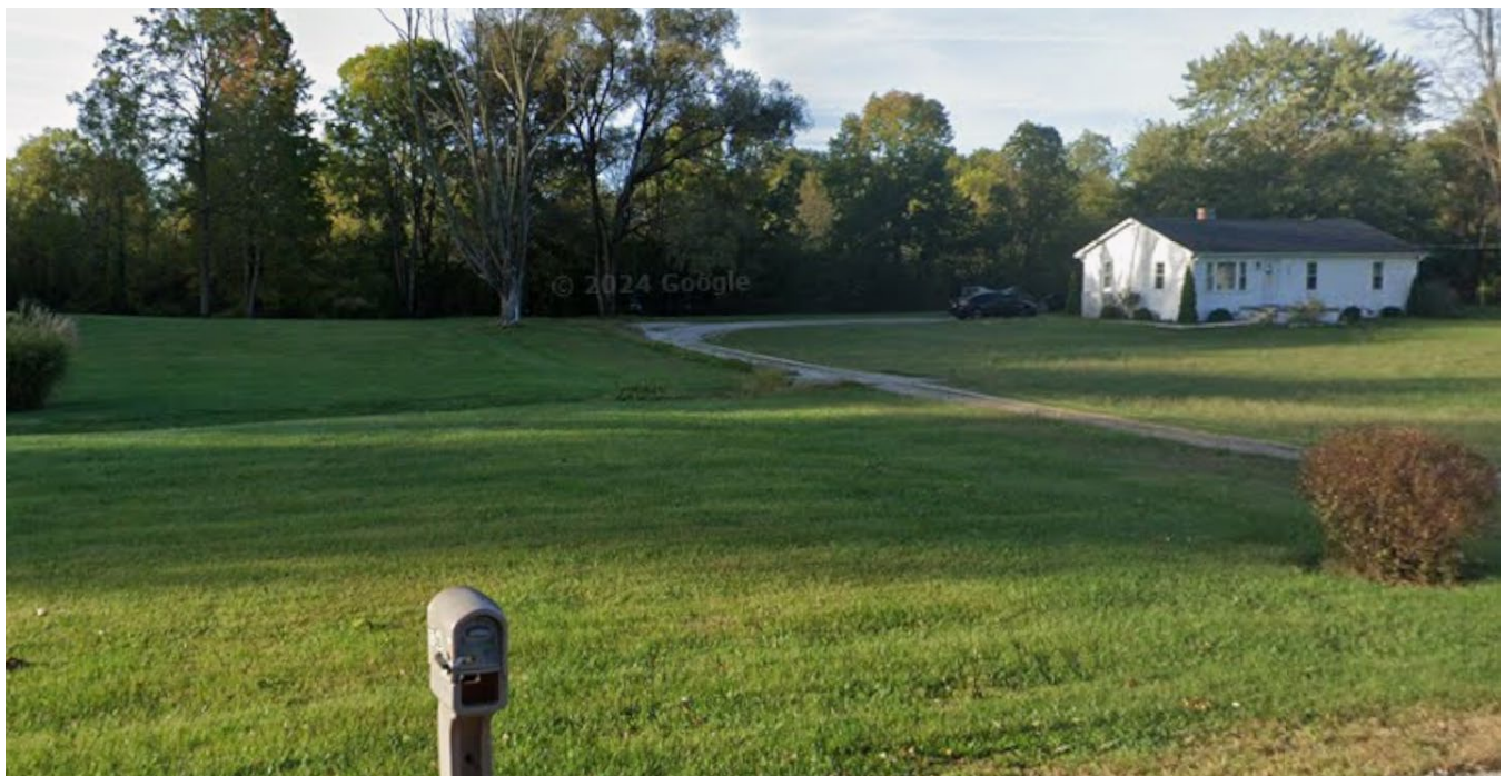
Figure 7 View of subject Site