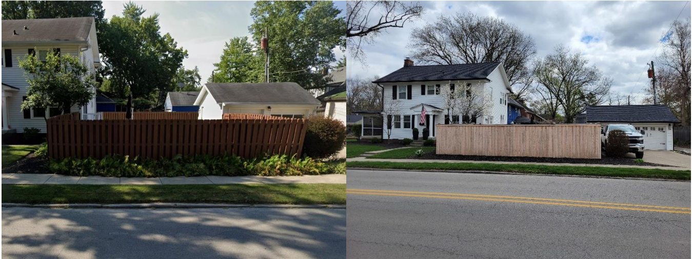
Photo 1: Subject Site Viewed from North (October 2023 vs. April 2025)