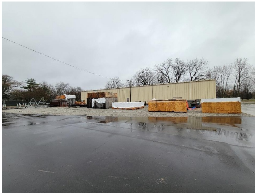
Photo 2: Accessory Building & Northern Storage Area Viewed from South