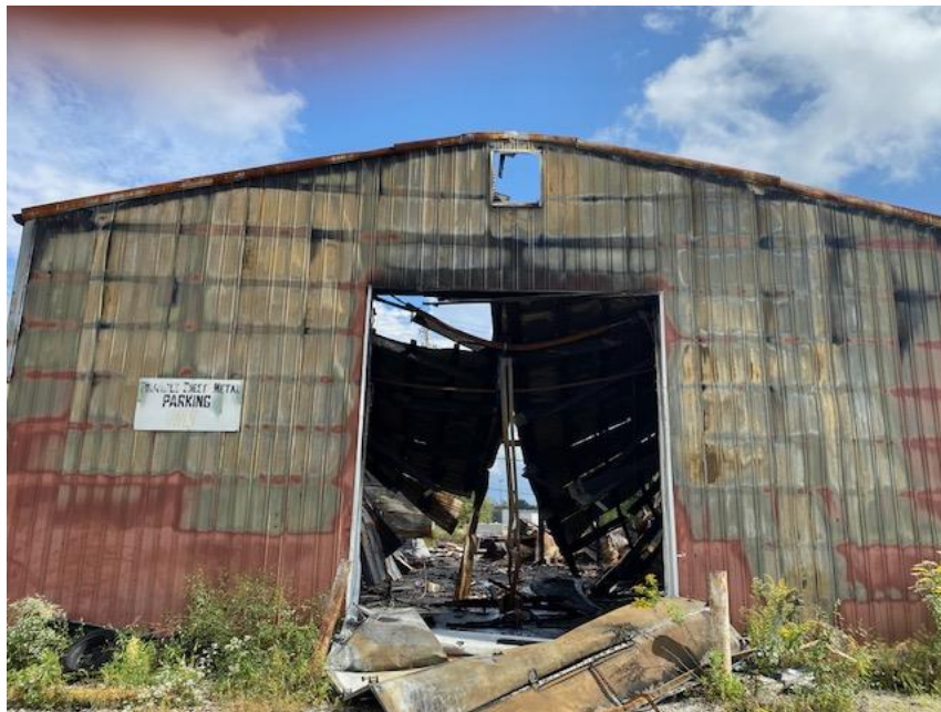
Photo 10: Damaged Structure Viewed from West