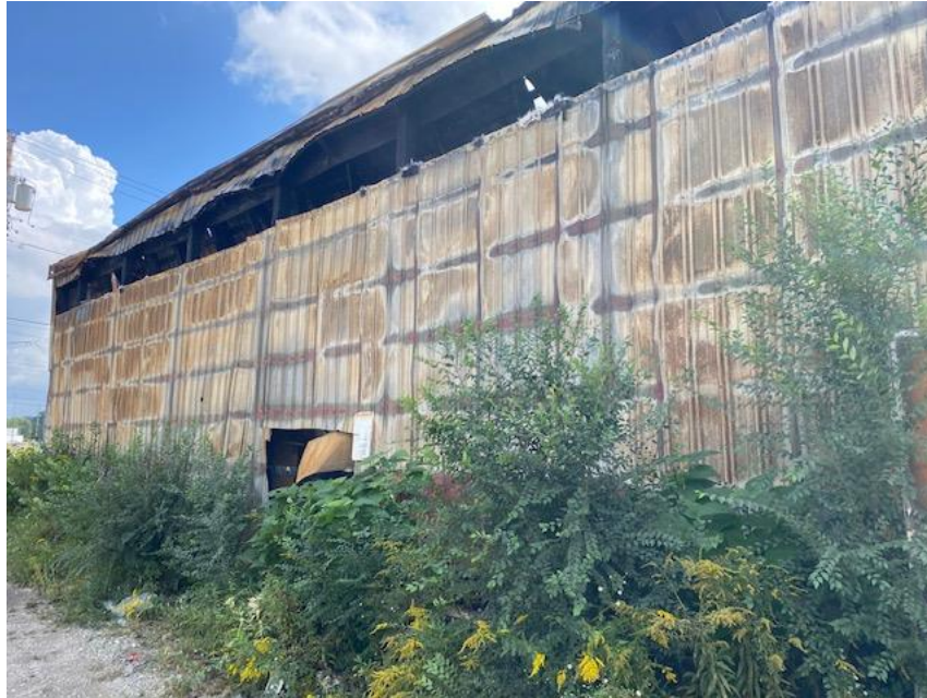
Photo 9: Damaged Structure Viewed from South