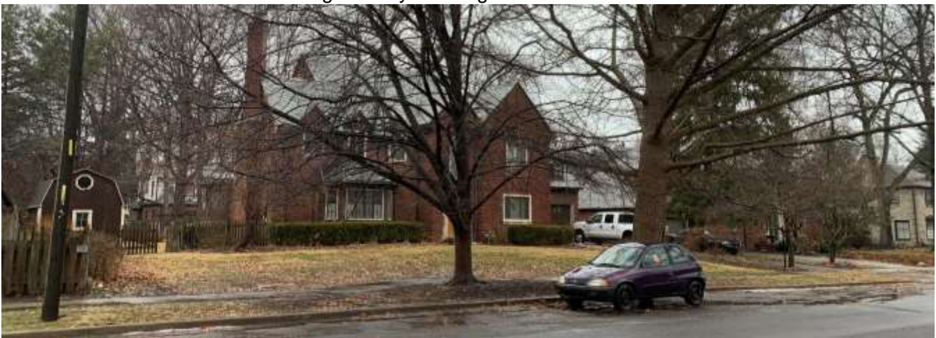
Single-family dwelling east of the site.