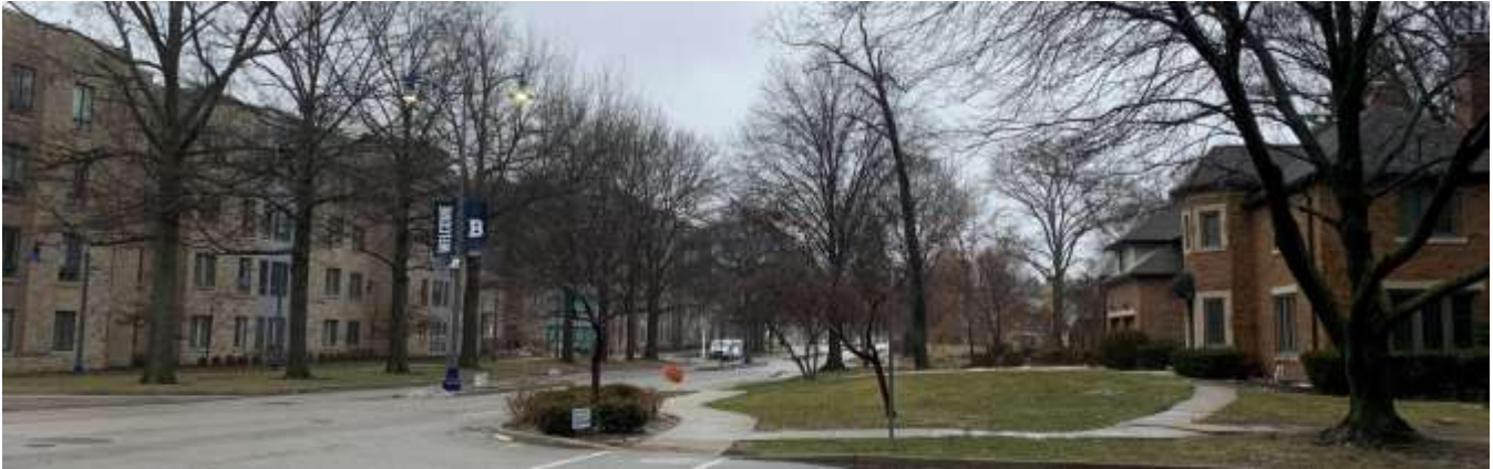
University dorms to the west of the subject site across Sunset Avenue.