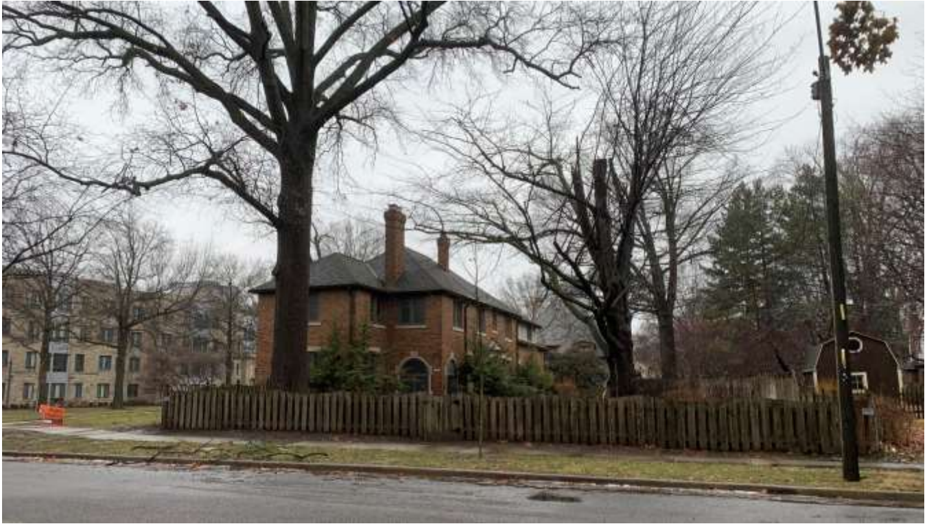
Front yard along Blue Ridge Road