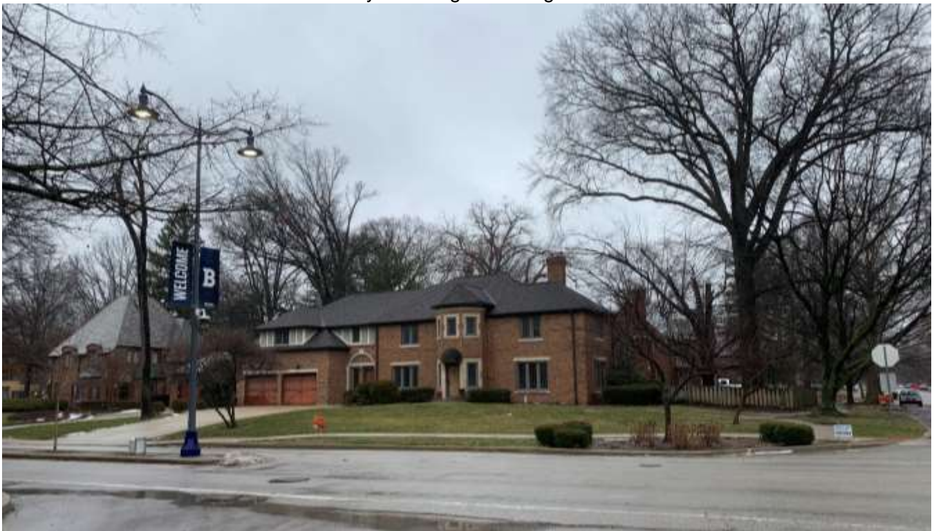
Corner side yard along Sunset Avenue.