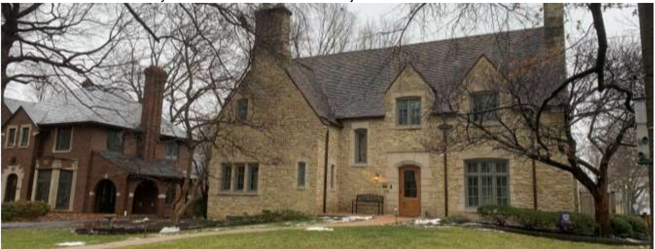
Single-family dwelling south of the site.