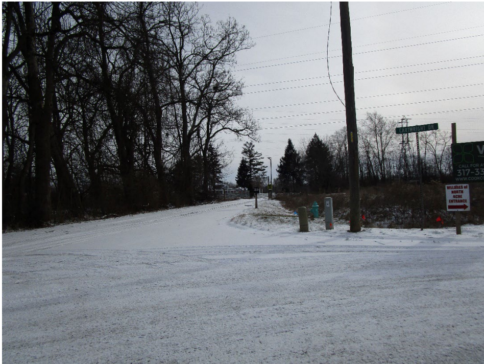
View looking south at intersection of State Avenue and Cartwright Drive