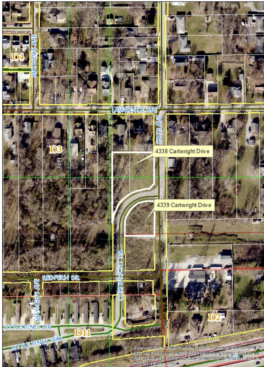
4338 and 4339 Cartwright Drive