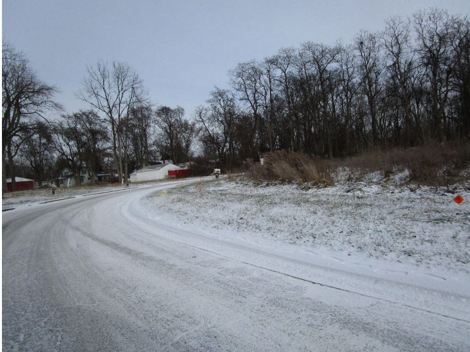
View northeast along Cartwright Drive