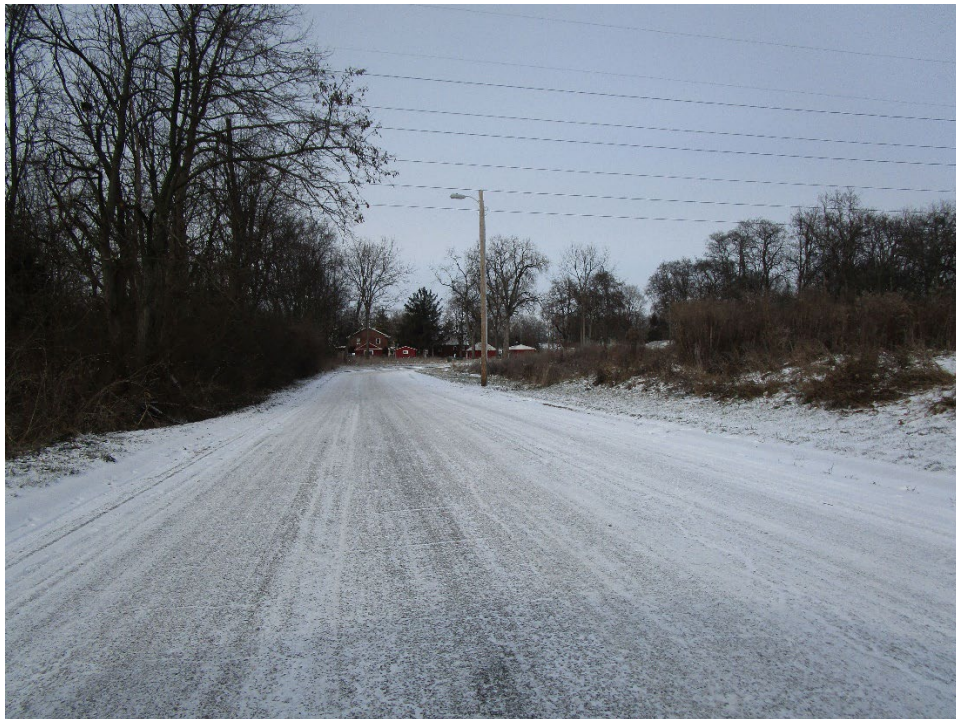
View of site looking south along Cartwright Drive