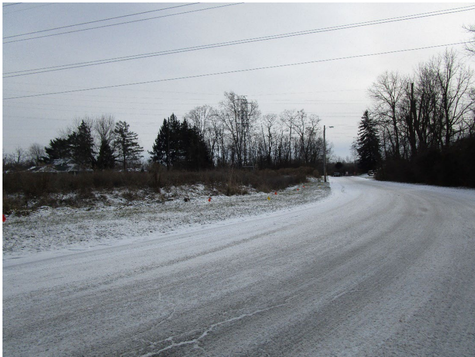
View southern portion of site looking south across Cartwright Drive