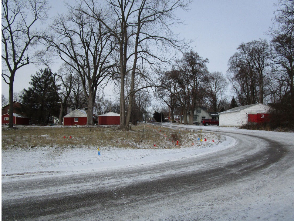
View of northern portion of site looking north across Cartwright Drive (State Avenue)