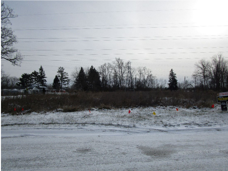
View southern portion of site looking east across Cartwright Drive