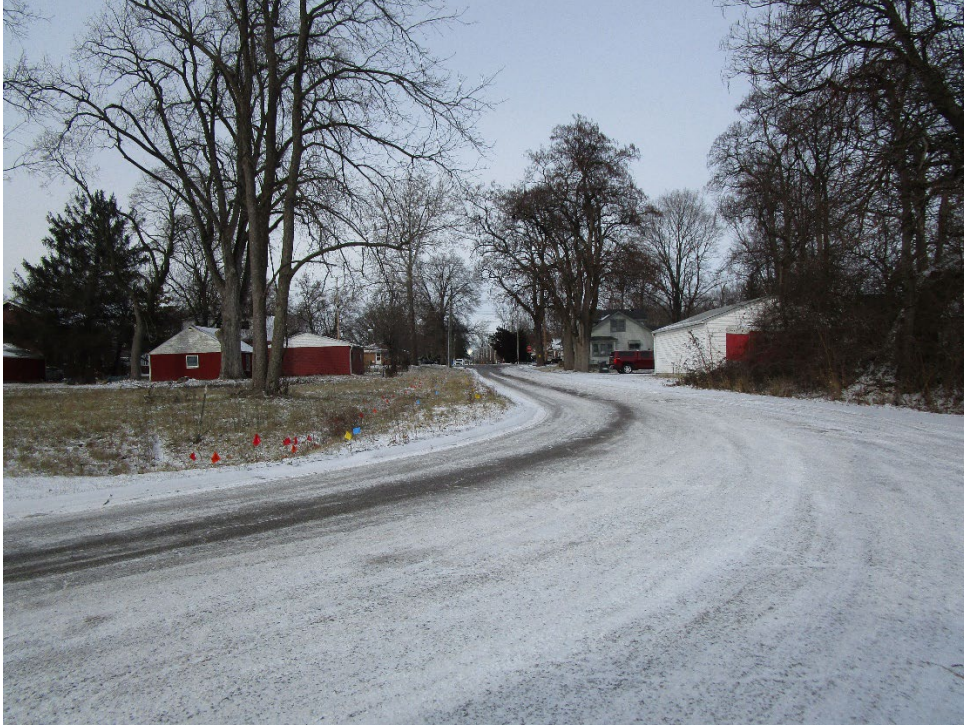
View looking north along State Avenue