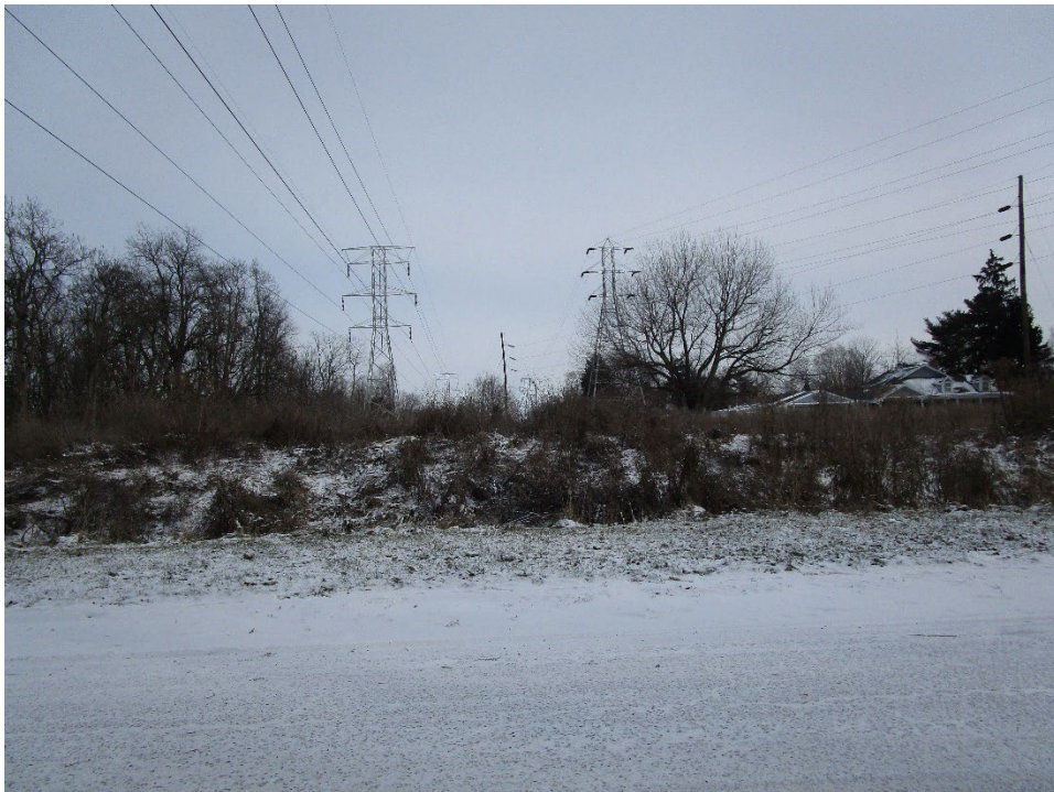
View of southern portion of site looking east across Cartwright Drive