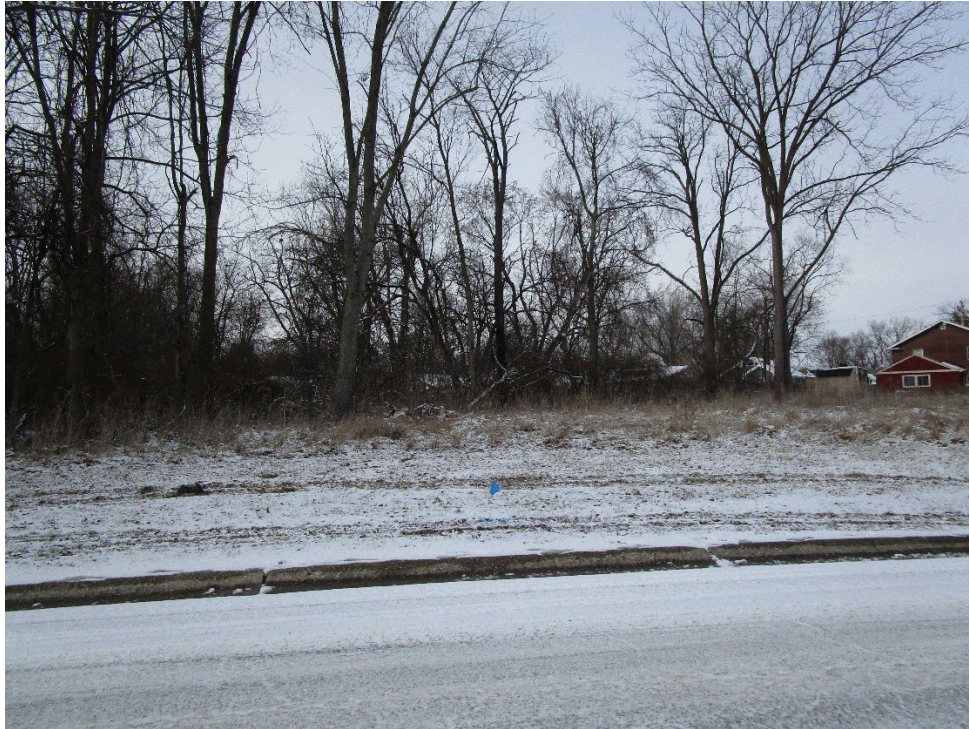
View of northern portion of site looking north across Cartwright Drive