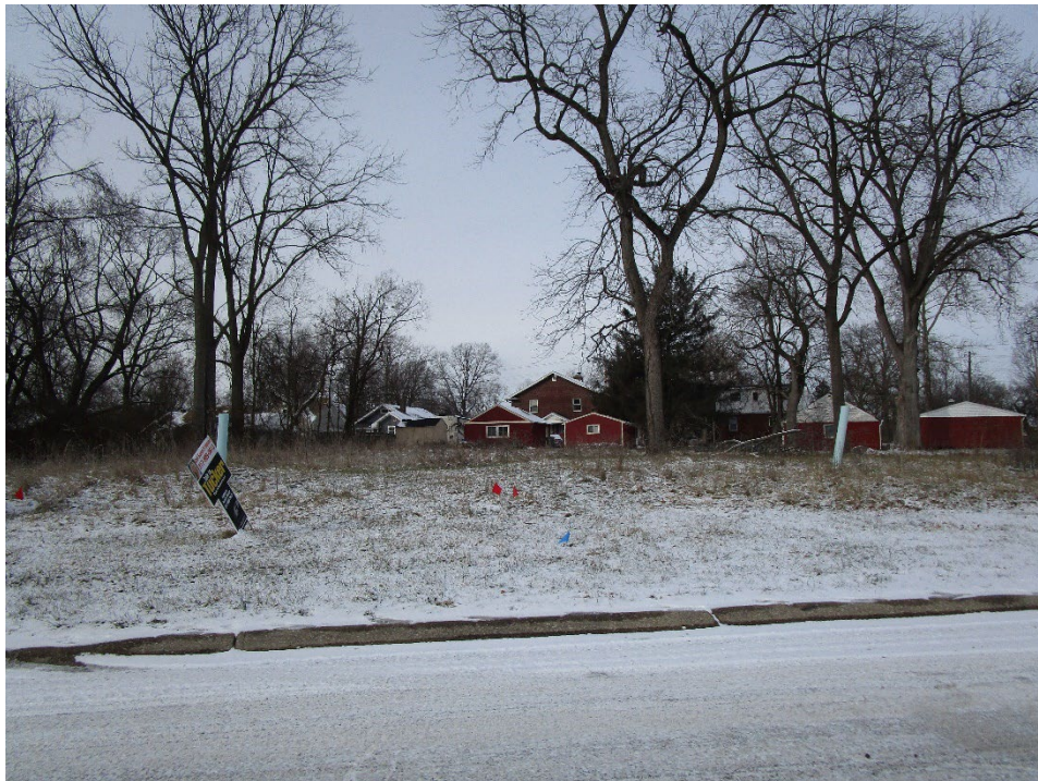
View of northern portion of site looking north across Cartwright Drive