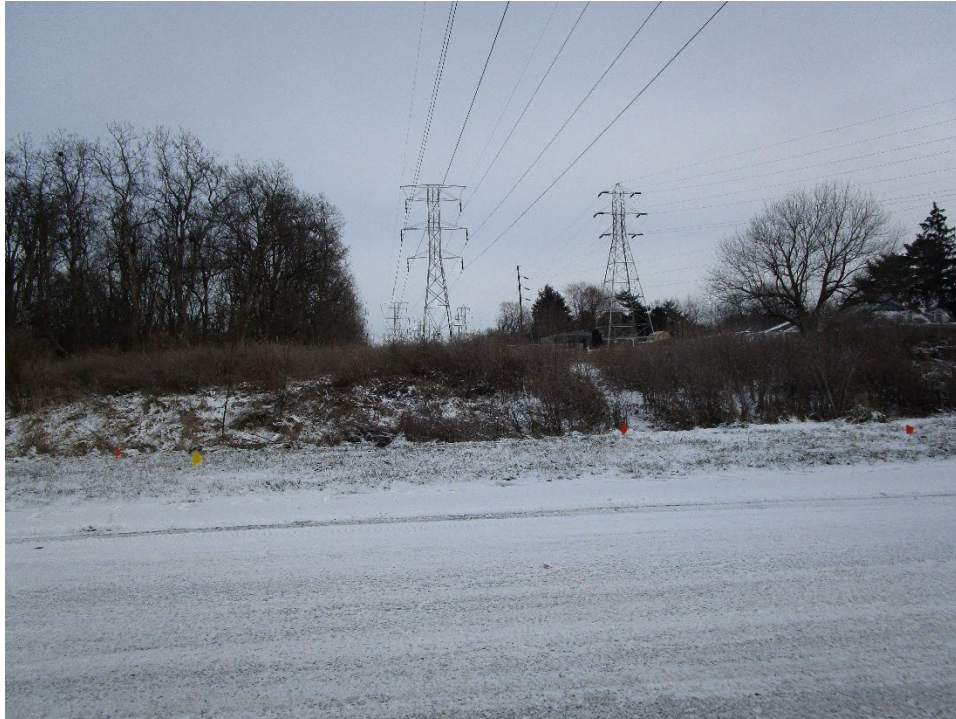
View of southern portion of site looking east across Cartwright Drive