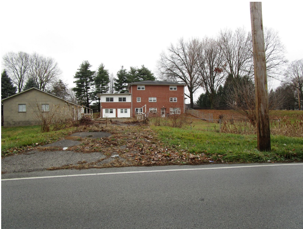
View of site looking south across West 52nd Street