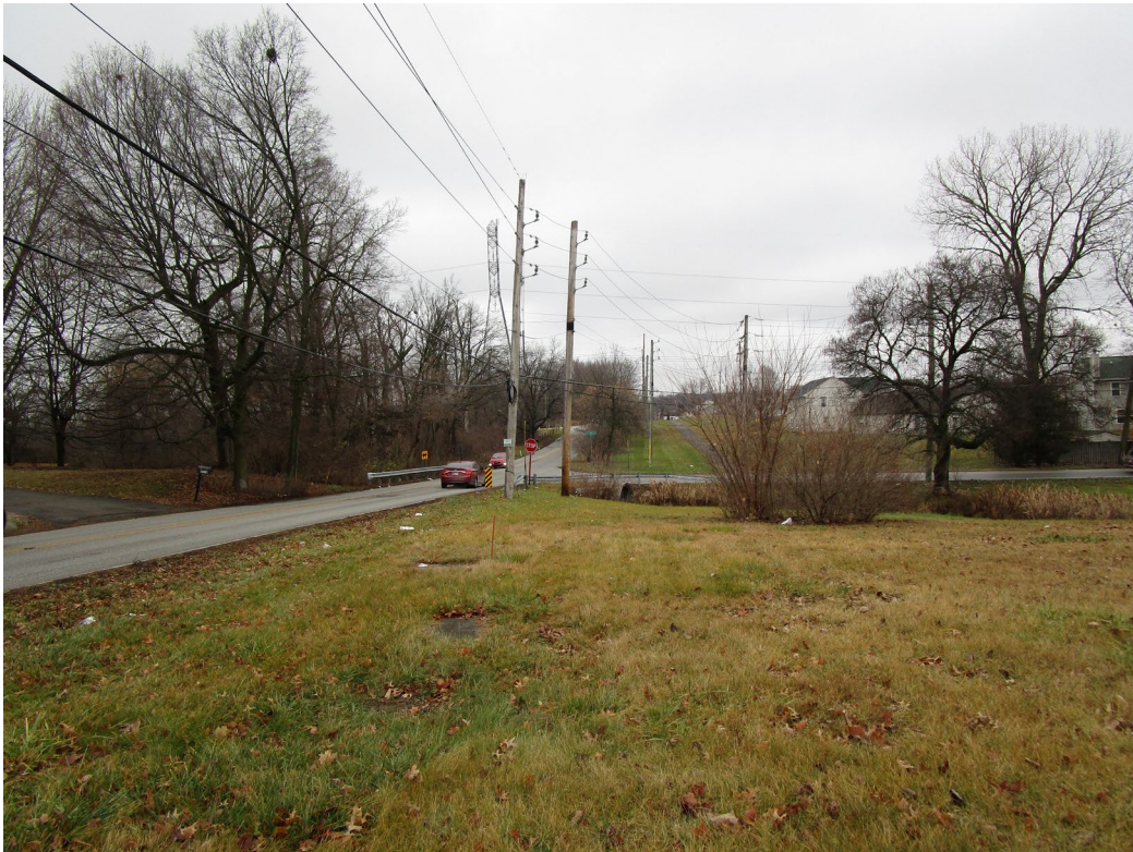
View looking north along North High School Road