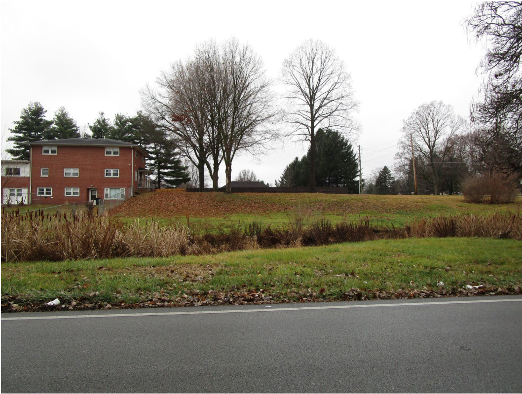
View of site looking south across West 52nd Street