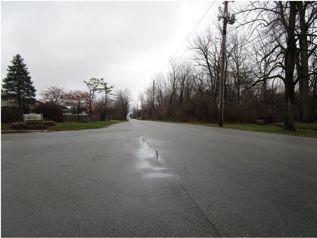
View looking east along West 52nd Street