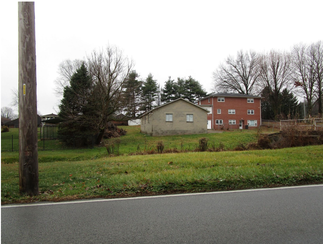
View of site looking south across West 52nd Street