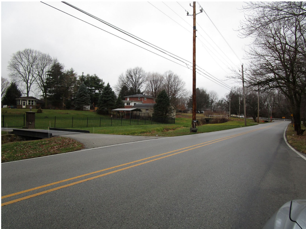
View looking west along West 52nd Street