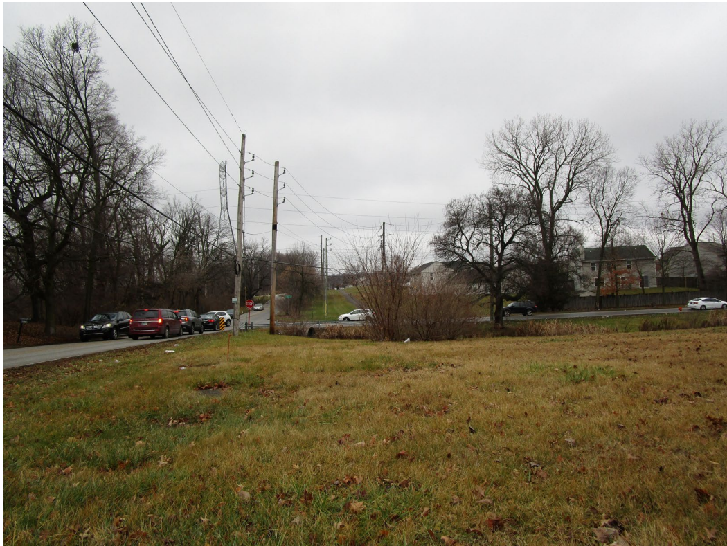
View from site looking north at intersection of North High School Road and West 52nd Street