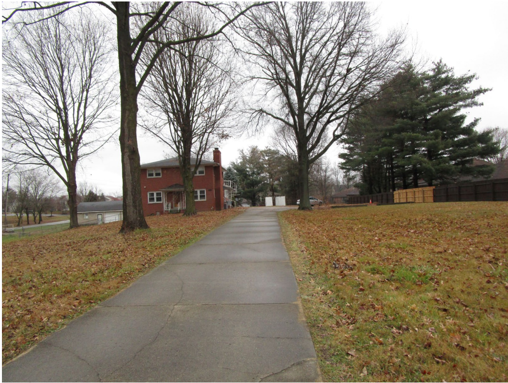
View of site looking east