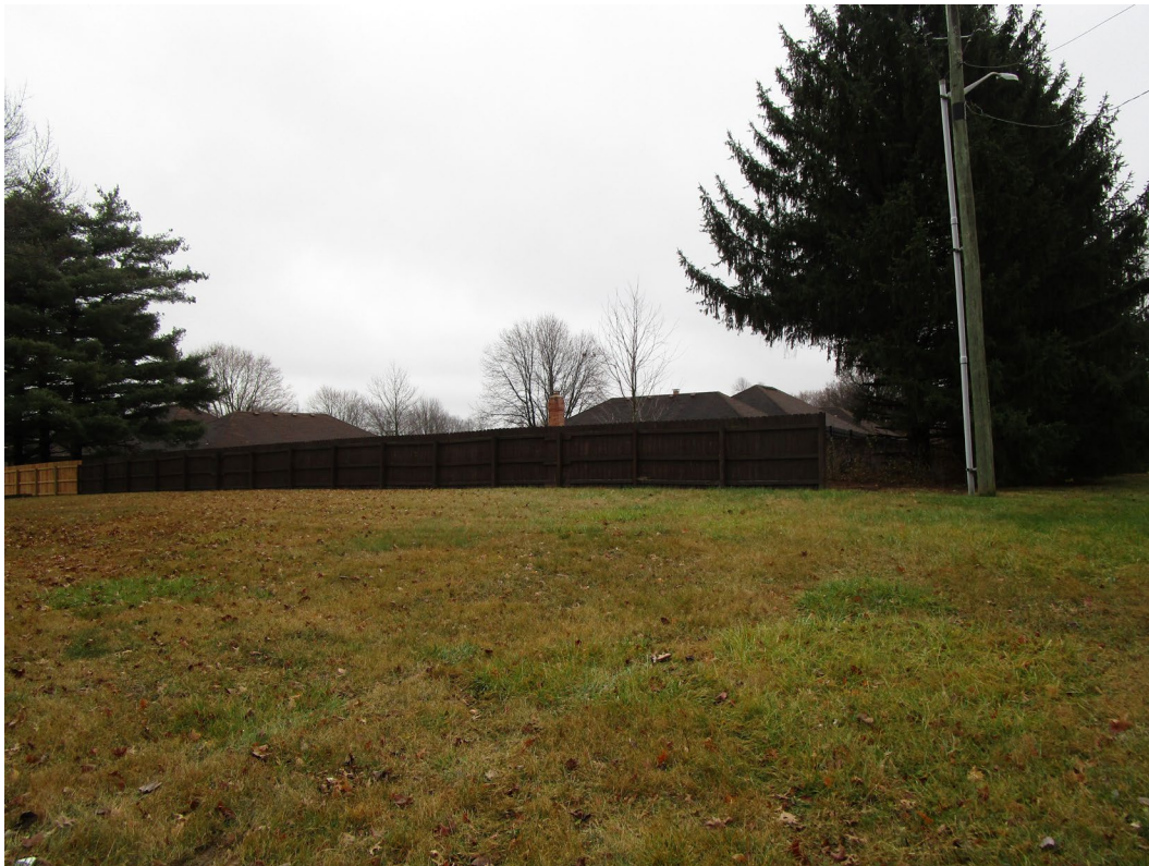
View from site looking southeast