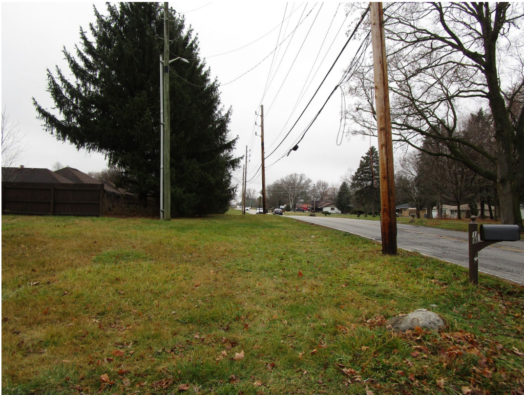
View looking south along North High School Road