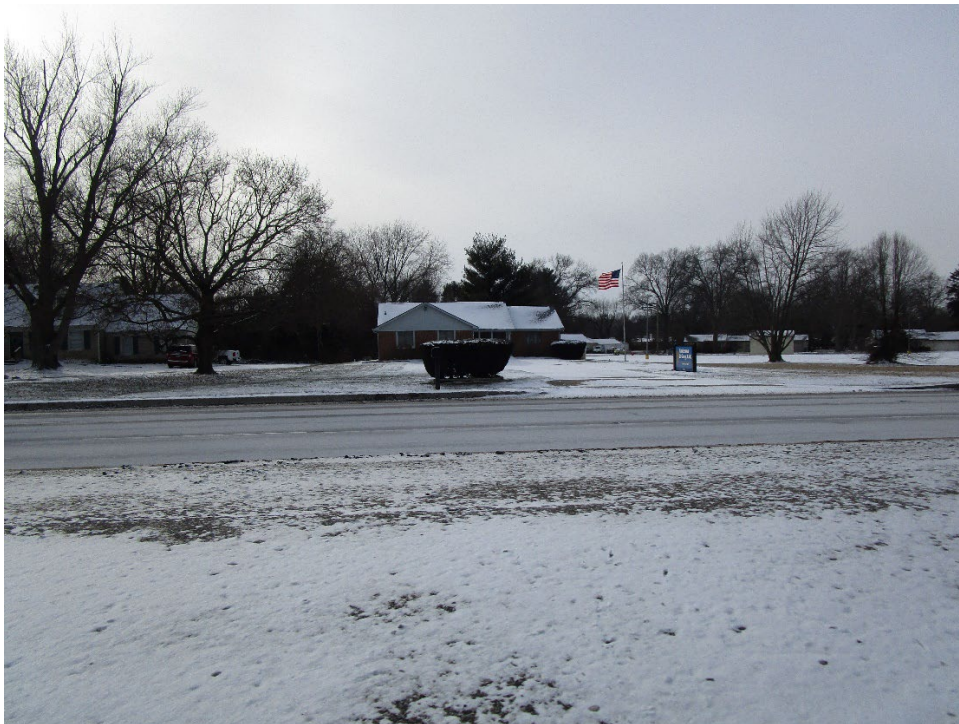
View of site (addressed as 7110 US 31) looking west across US 31