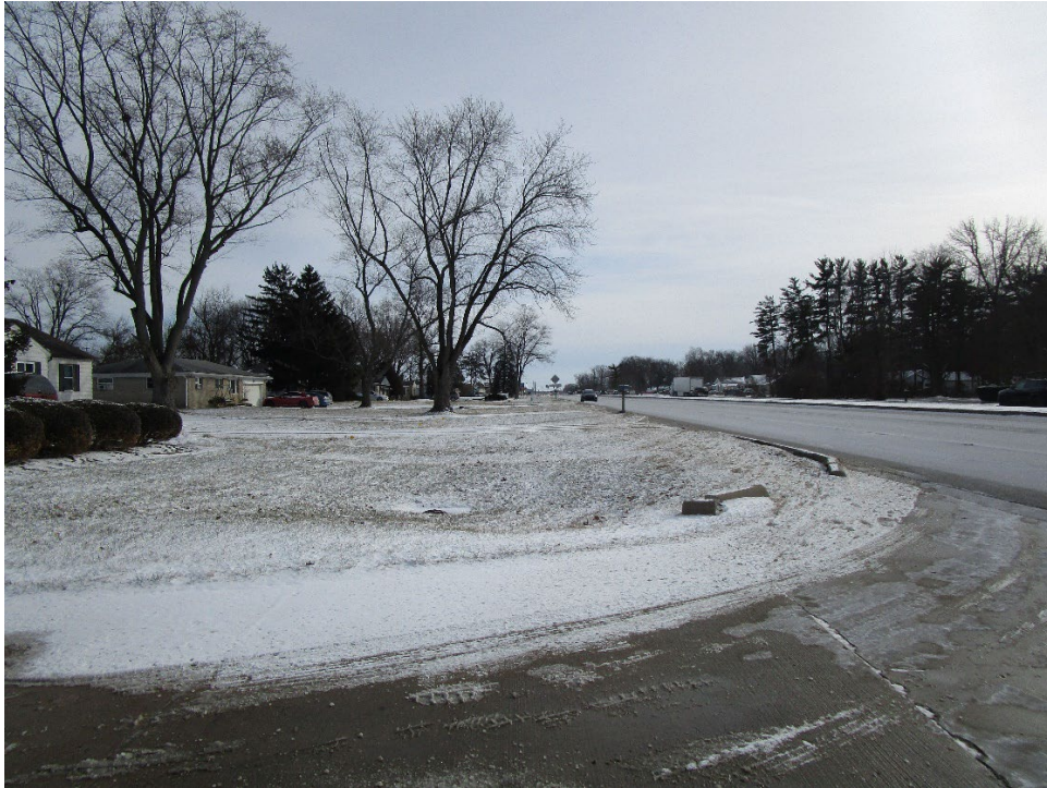
View looking north across US 31