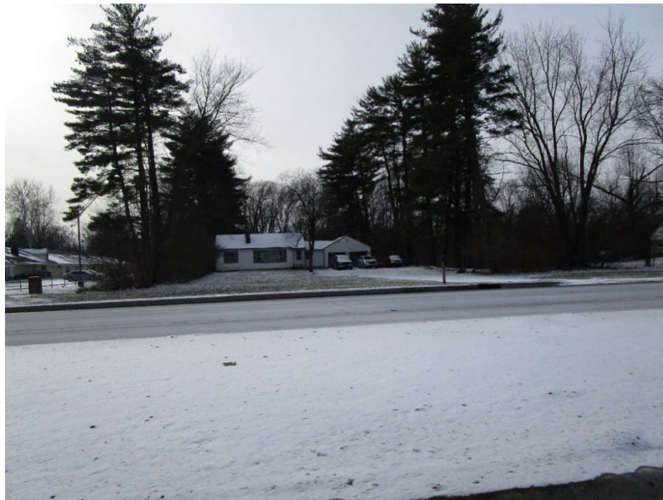
View of site (addressed as 7112) looking west across US 31