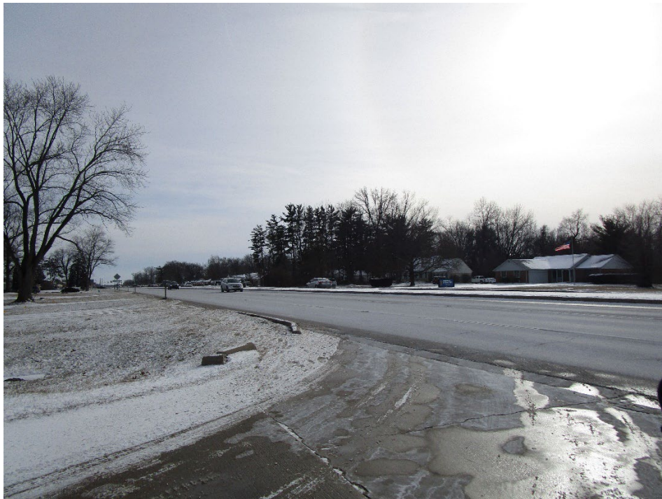
View looking northeast across US 31