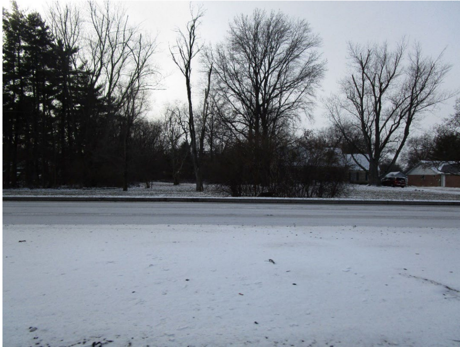
View of site (addressed as 7110 US 31-undeveloped) looking west across US 31