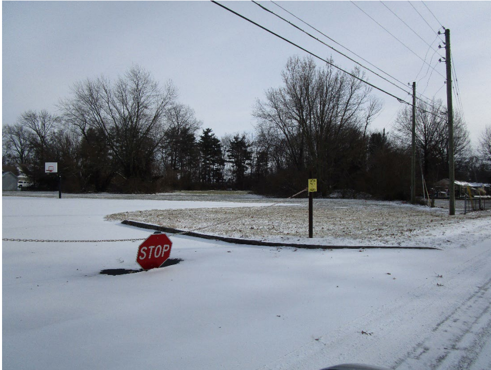
View of site looking southeast across South East Street from adjacent property to the north