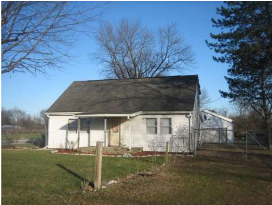
Subject site 2815 Curry Road single family dwelling, looking east