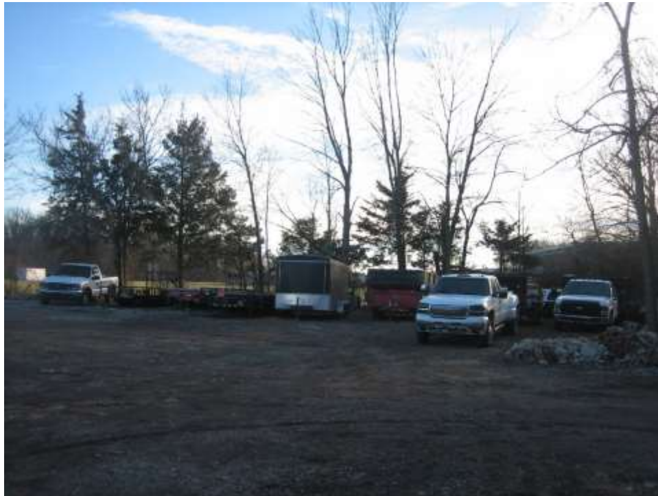
Subject site, storage of multiple commercial trucks and trailers