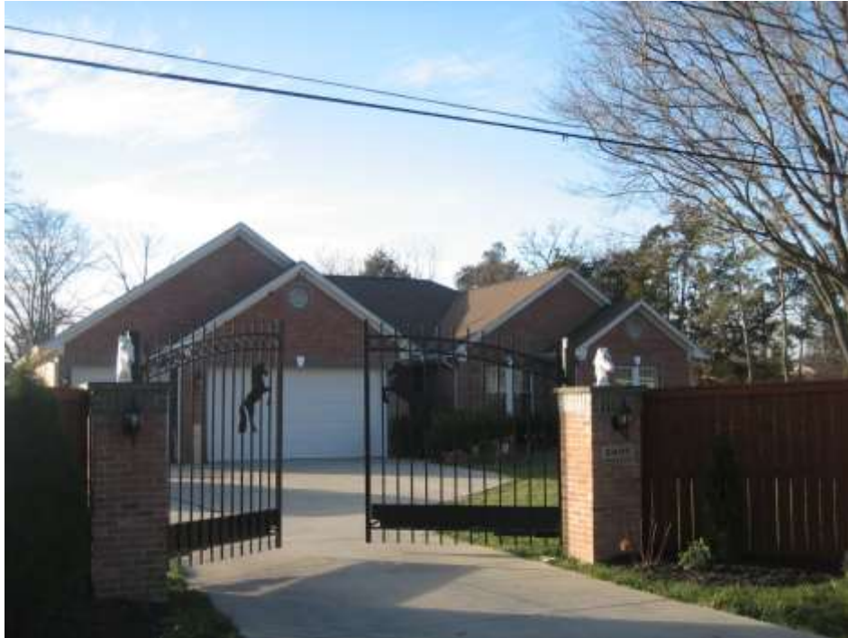
Adjacent single family dwelling to the west