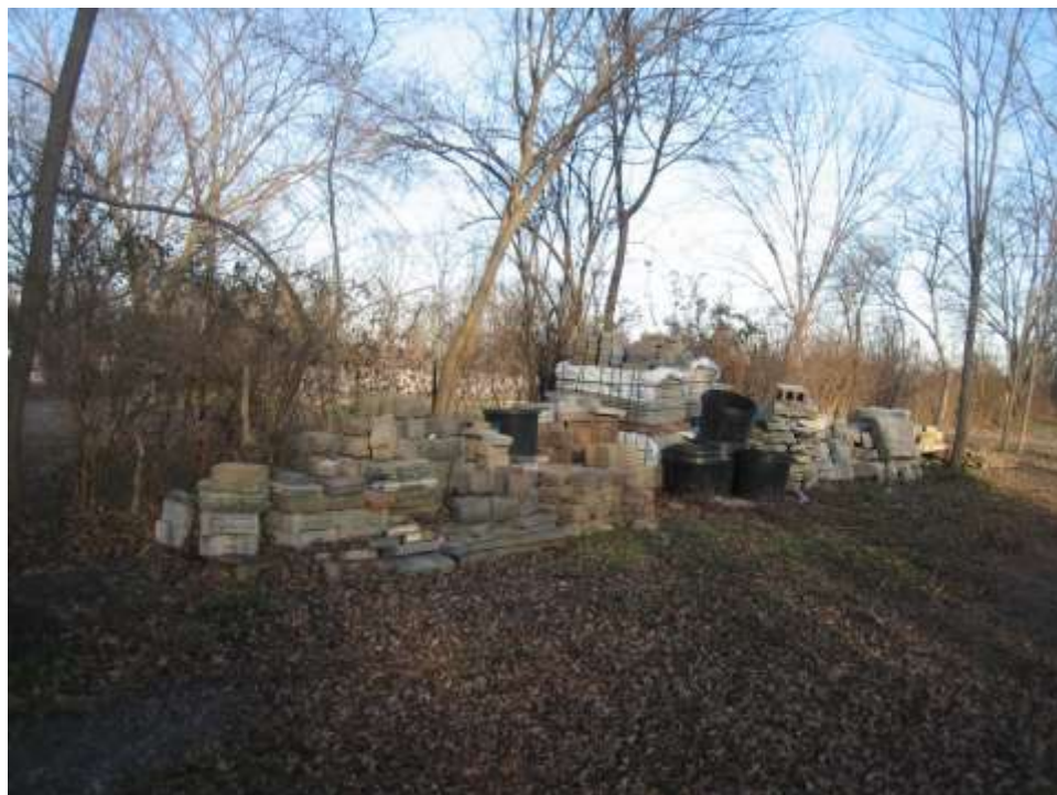
Subject site, storage of commercial landscaping materials