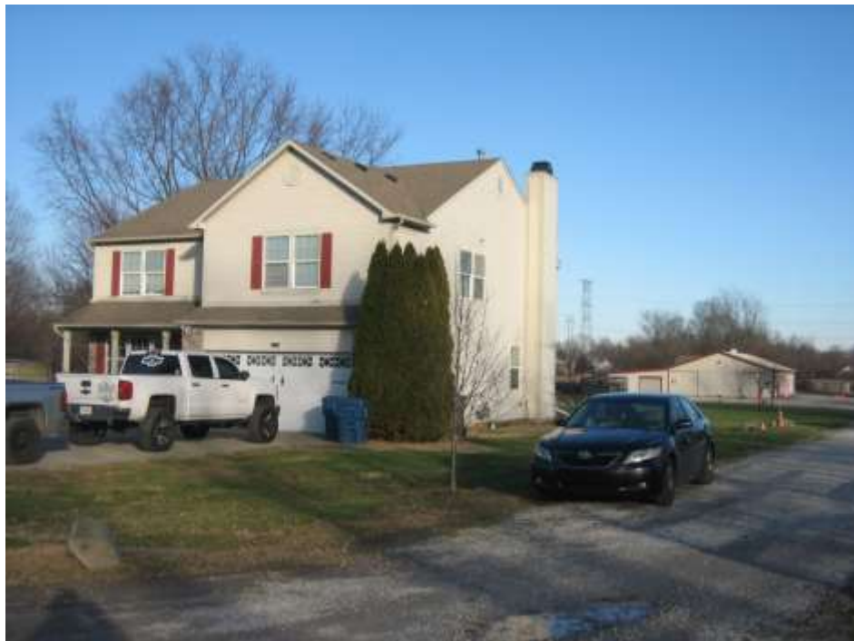
Adjacent single family dwelling to the north, looking east.