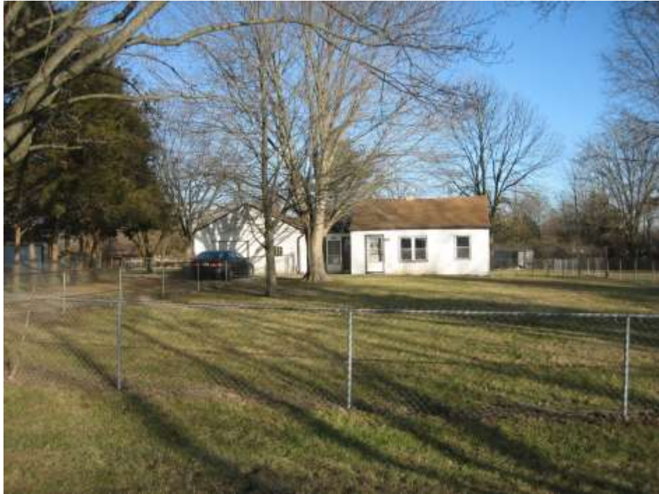
Subject site 2745 Curry Road single family dwelling, looking east