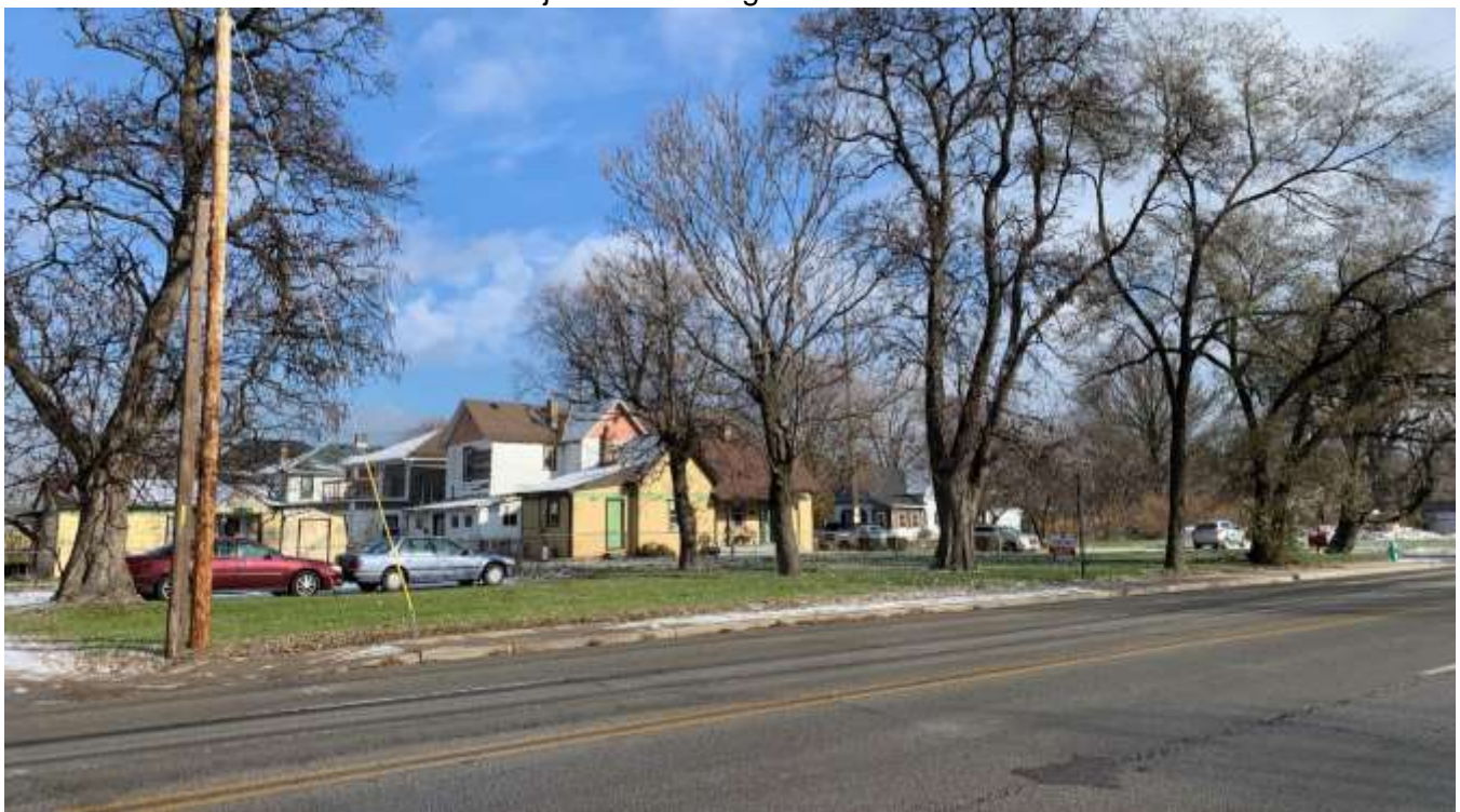
Photo of the subject site looking north from 16<sup>th</sup> Street.