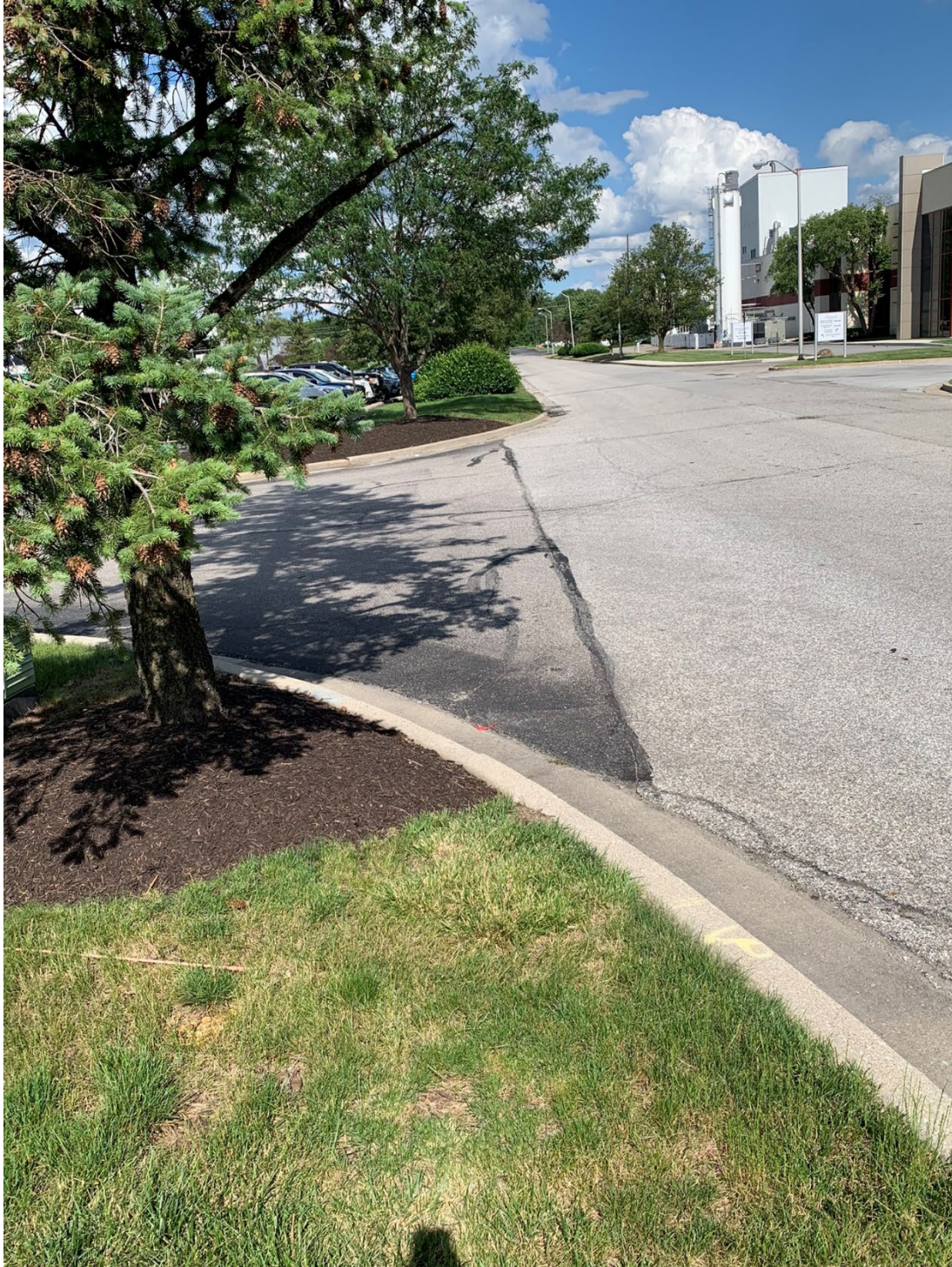
View of an internal drive connecting to 84 th Street looking east