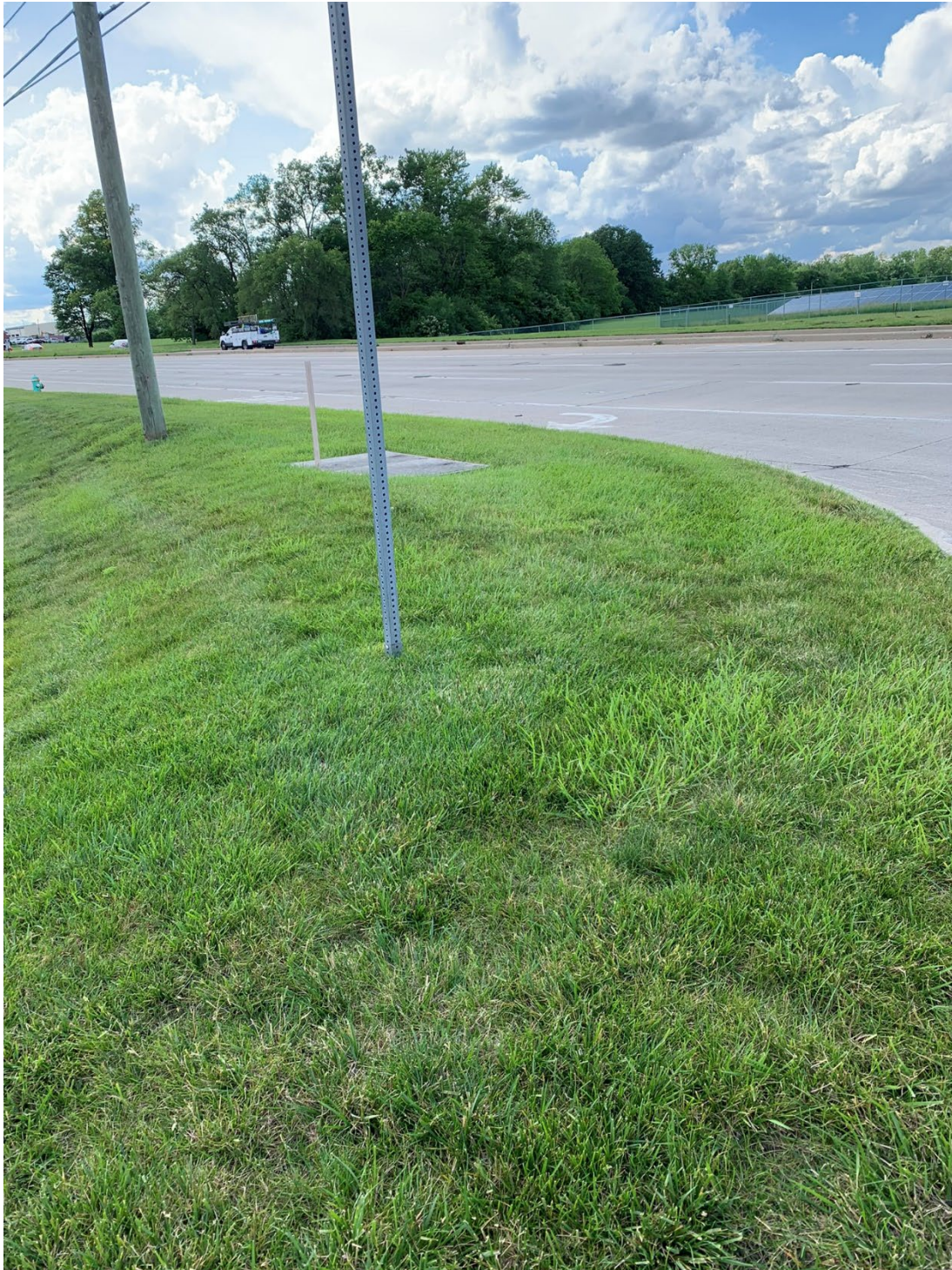
View of 86 th Street intersection with Bearing Drive