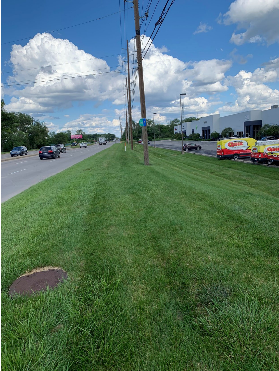
North boundary of site along 86 th Street looking east – note bus stop in grass area