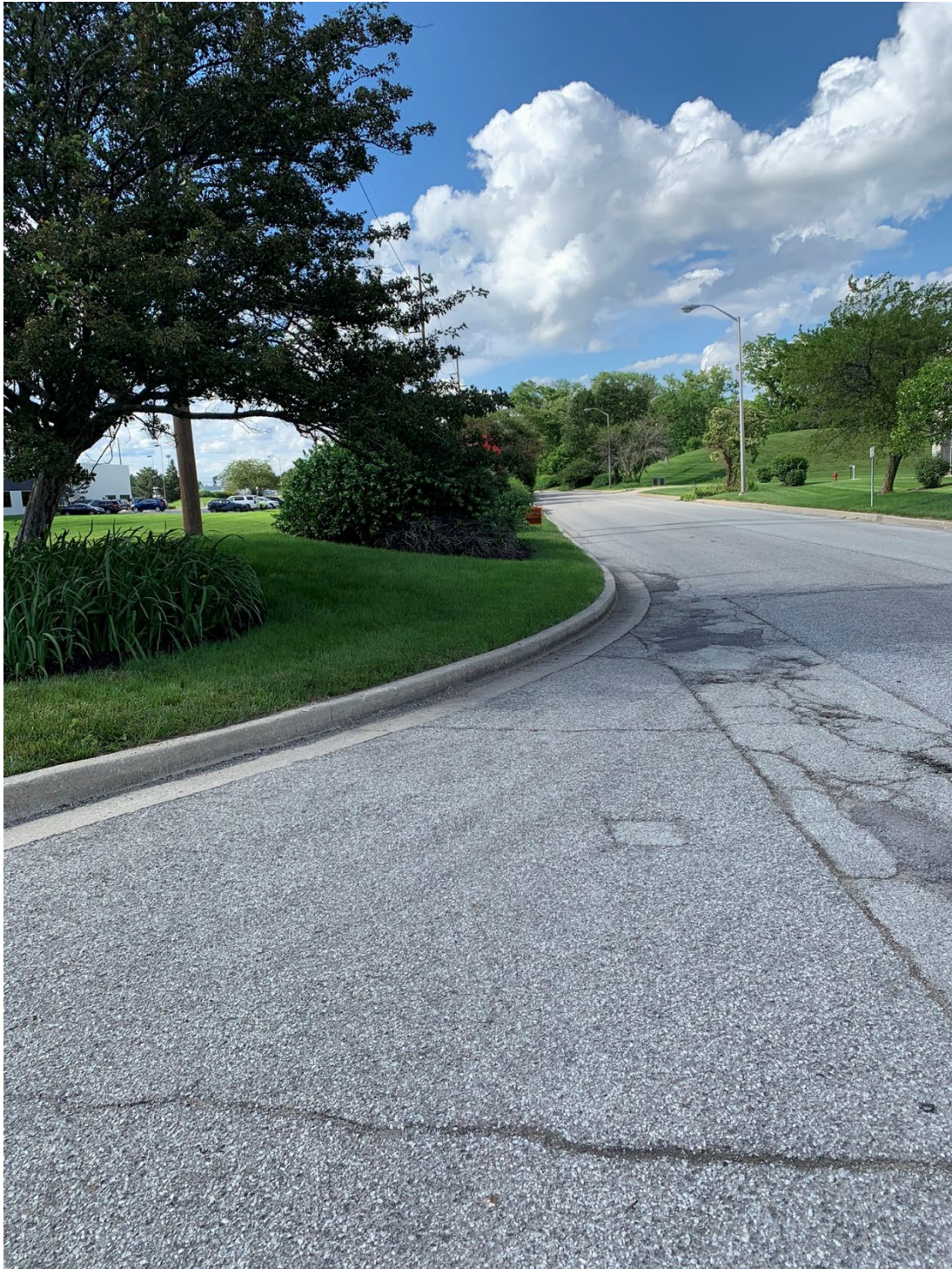
View of an internal drive connecting to Bearing Drive looking north