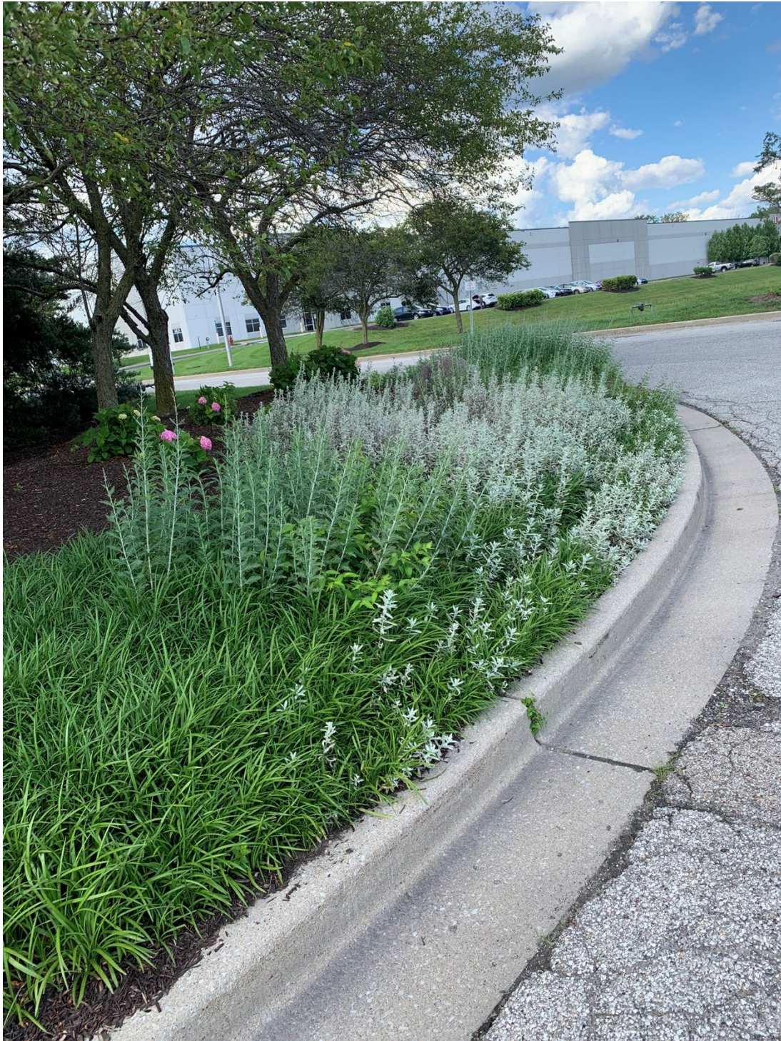
View of Bearing Drive intersection with 84 th Street at the southeast corner of the site