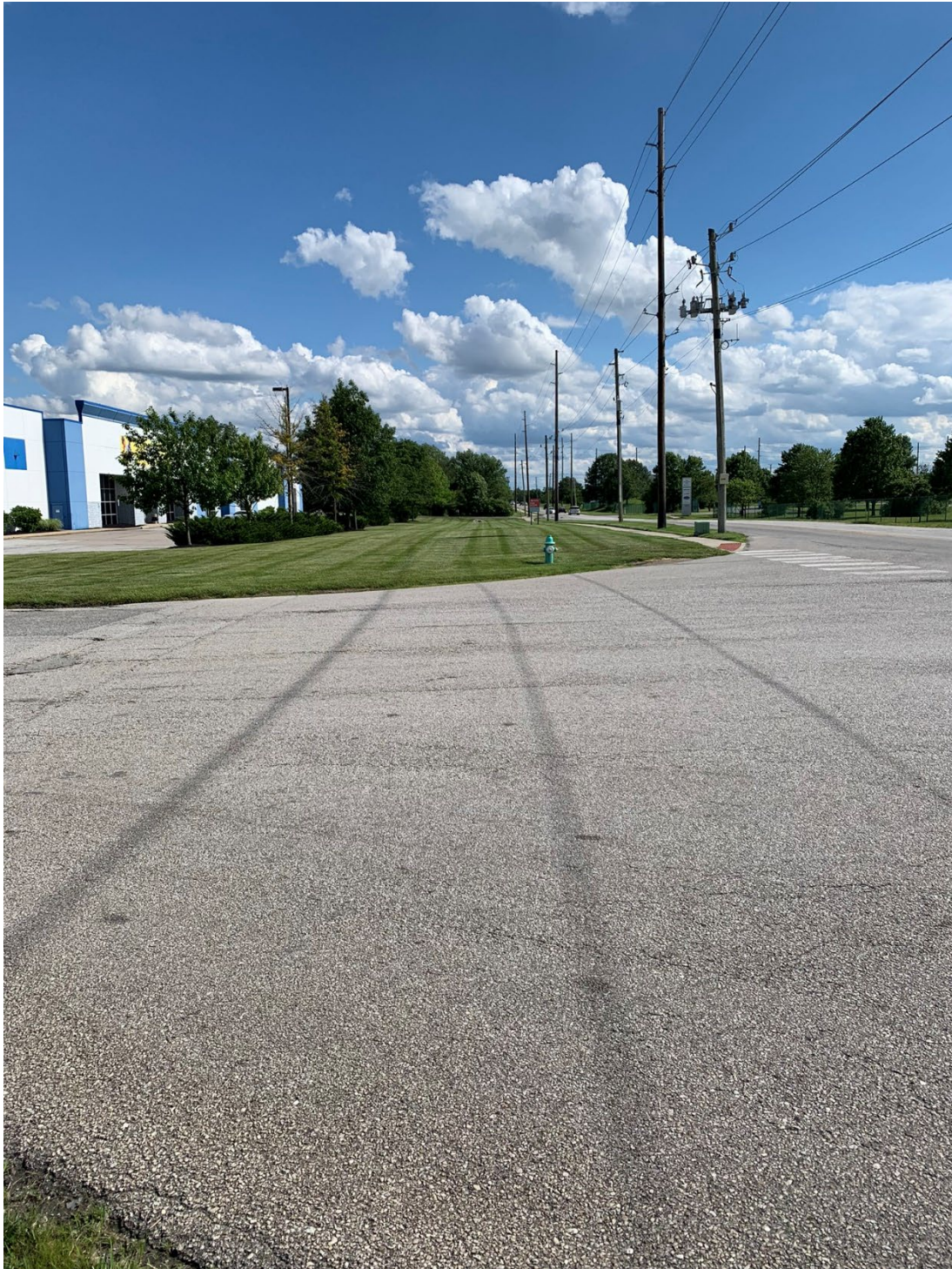
View of site to the south of subject site (south of 84 th Street); note the continuation of the sidewalk along Georgetown Road