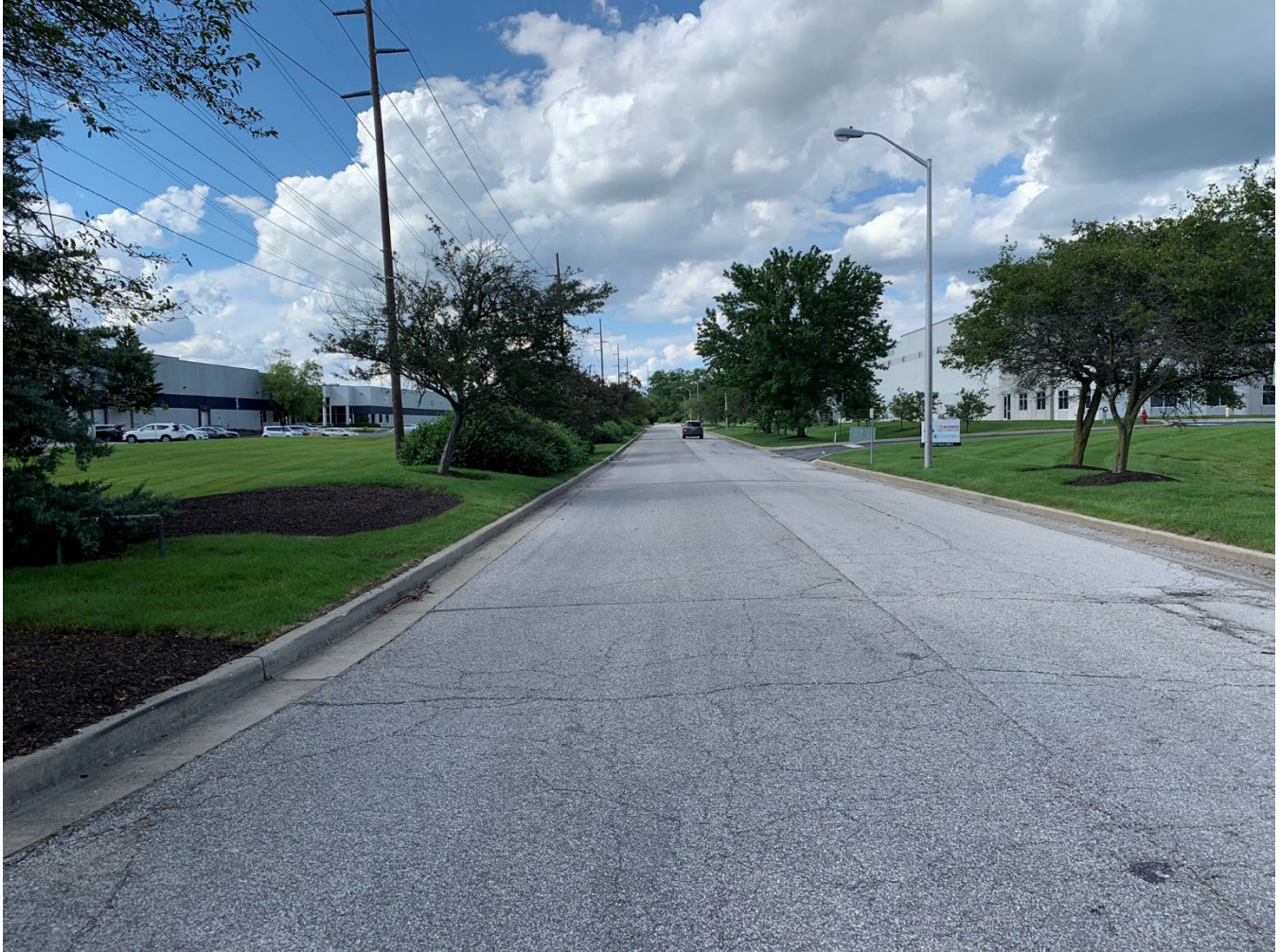
View of Bearing Drive looking north. Subject site is to the left.