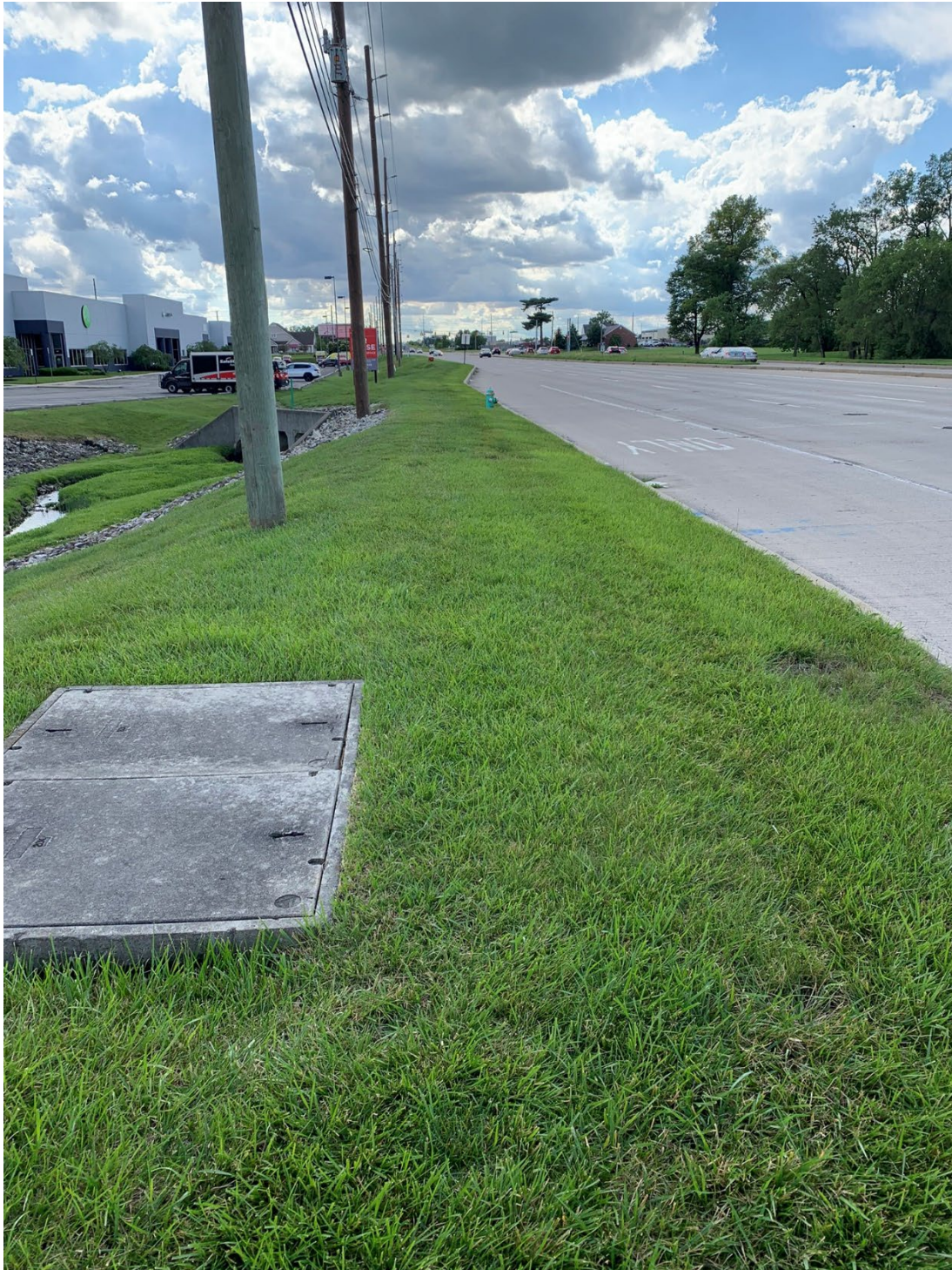
North boundary of site along 86 th Street looking west