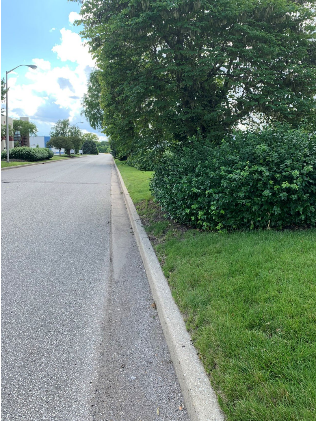
View of south boundary of site along 84 th Street looking west