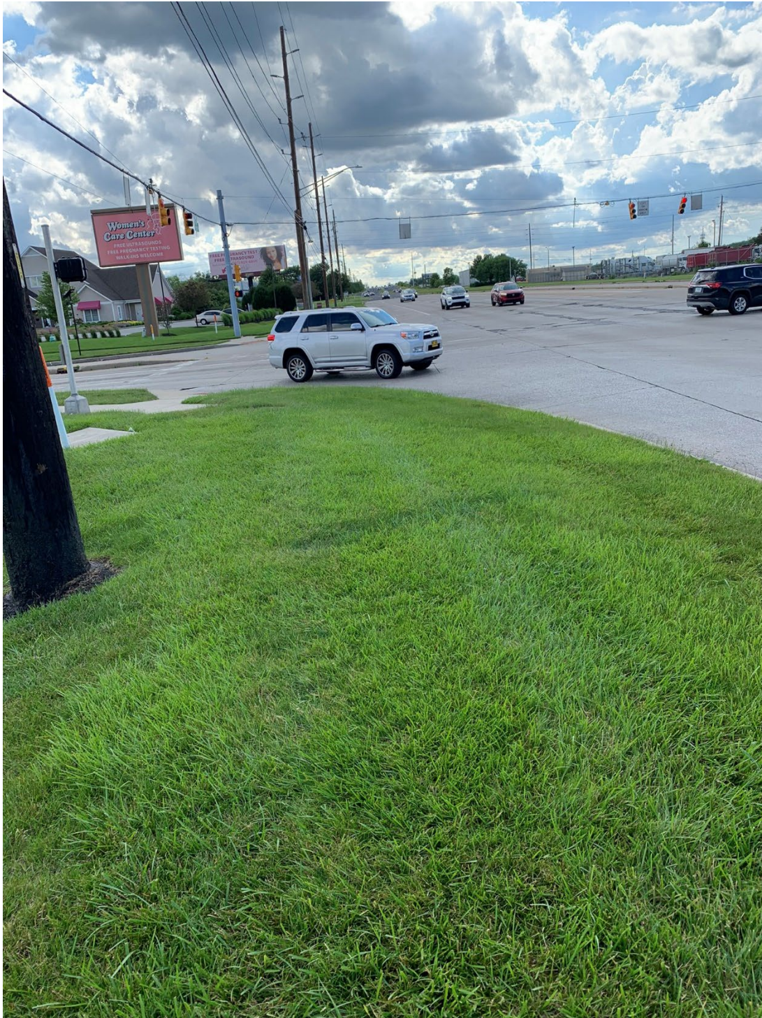
View of 86 th Street and Georgetown Road intersection at the northwest portion of the site – looking west