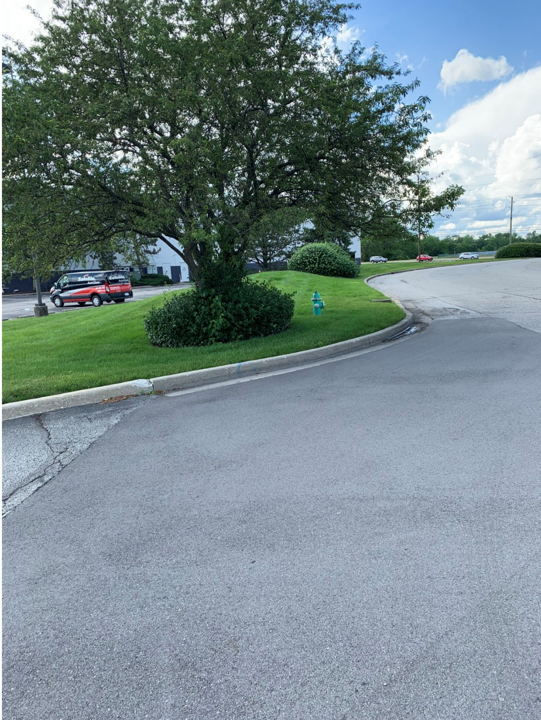
View of site along Bearing Drive looking northwest