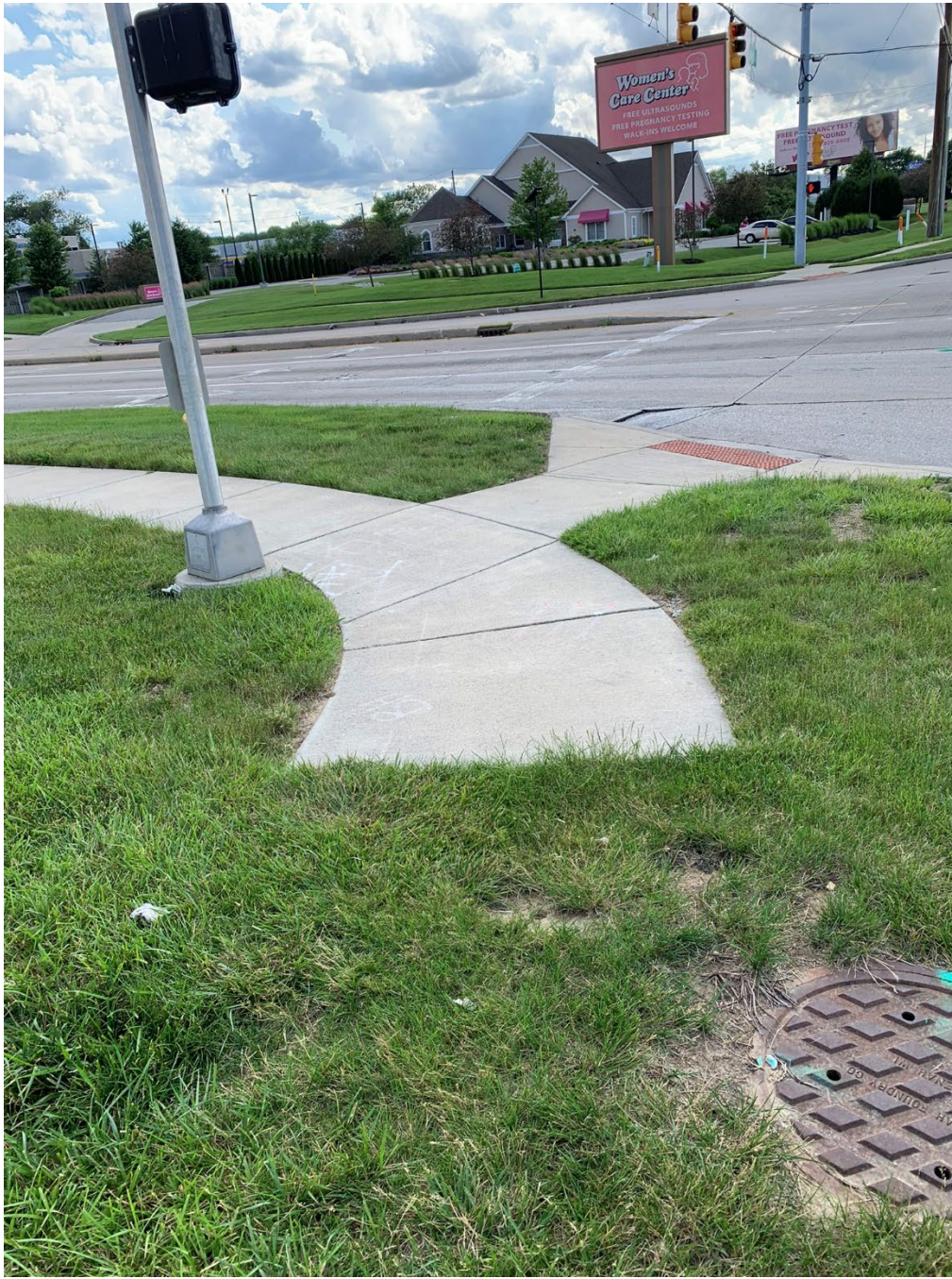
Existing sidewalk at 86 th Street and Georgetown Road intersection– sidewalk begins at this location and runs south