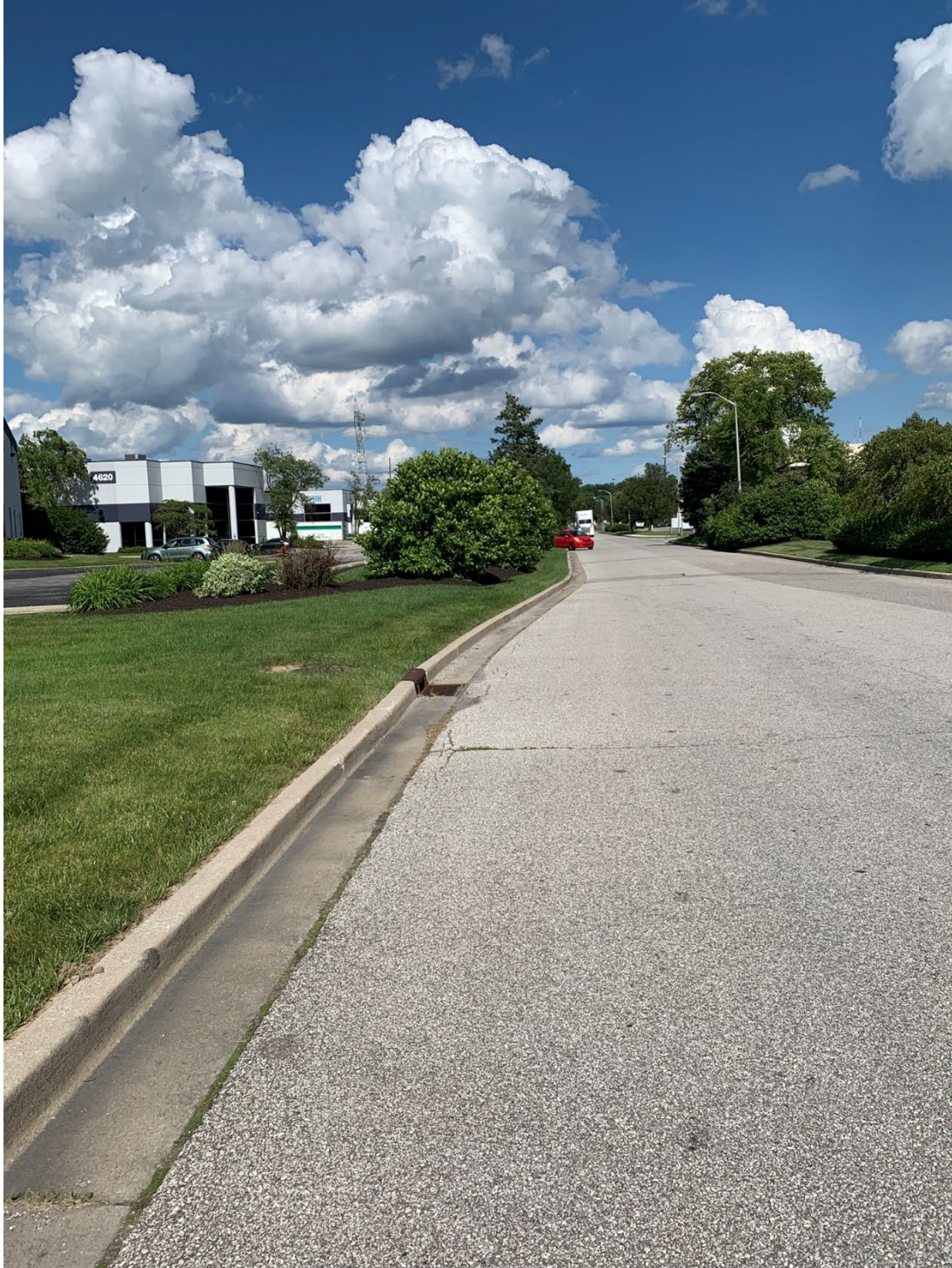
View of southern boundary of site along 84 th Street looking east