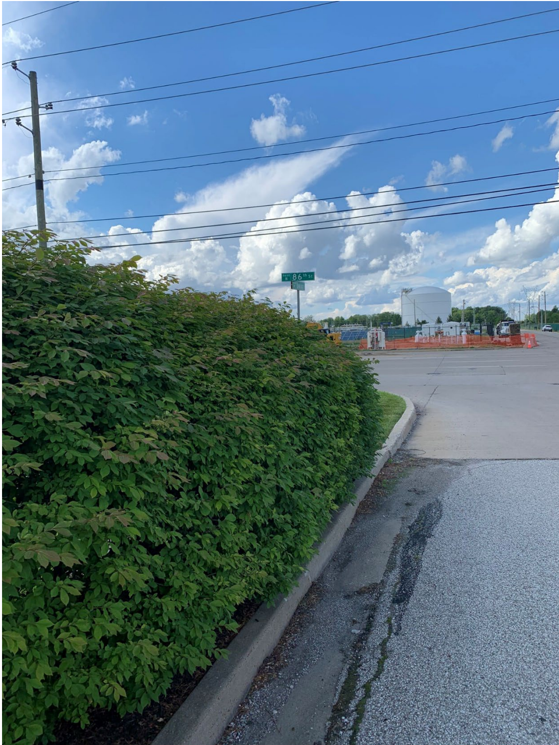
View of site at Bearing Drive and 86 th Street intersection