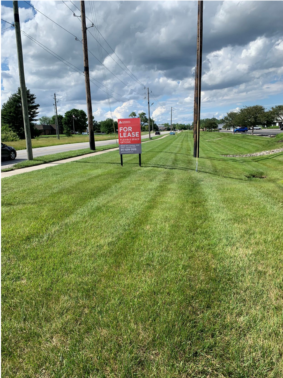
View of western boundary of site along Georgetown Road