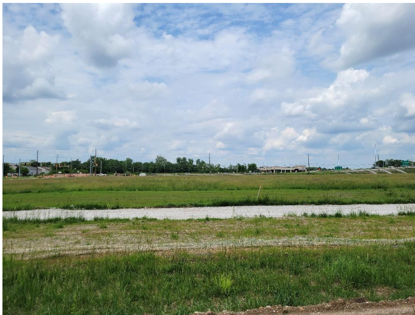
Photo 4: Subject Site Viewed from South (Southern Dunes Apartments)