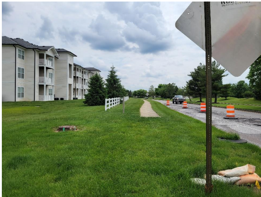
Photo 8: Existing Sidewalk along Wellingshire (Southwest of Subject Site)