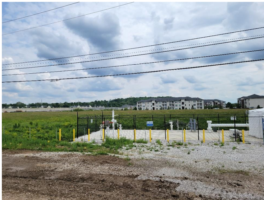
Photo 2: Subject Site + Utility Station Viewed from North (Southport)