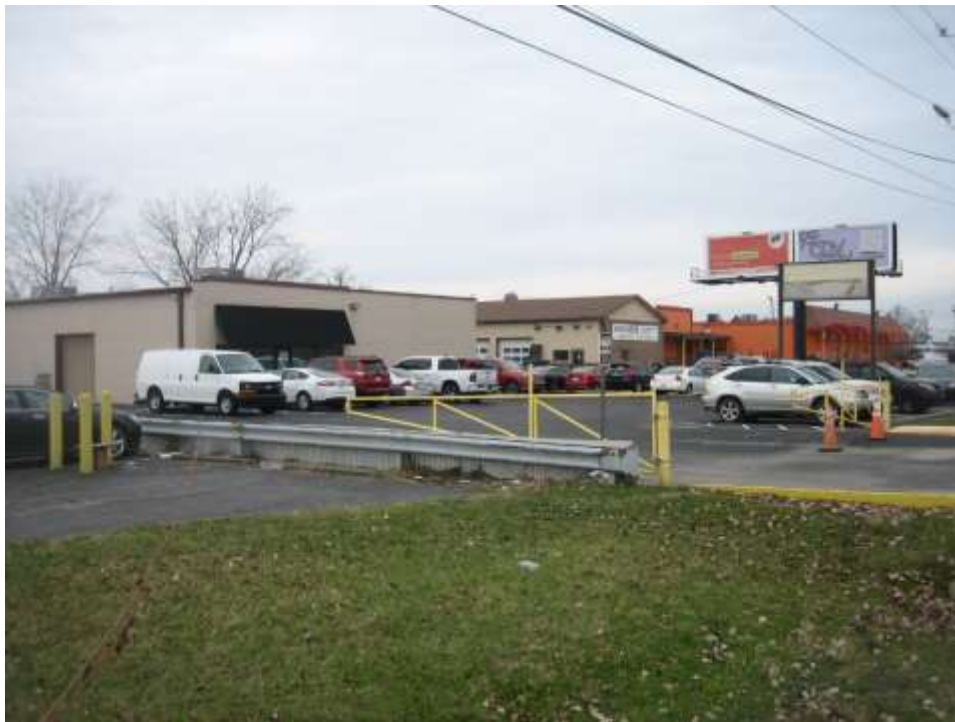
Adjacent commercial uses to the north, looking northwest