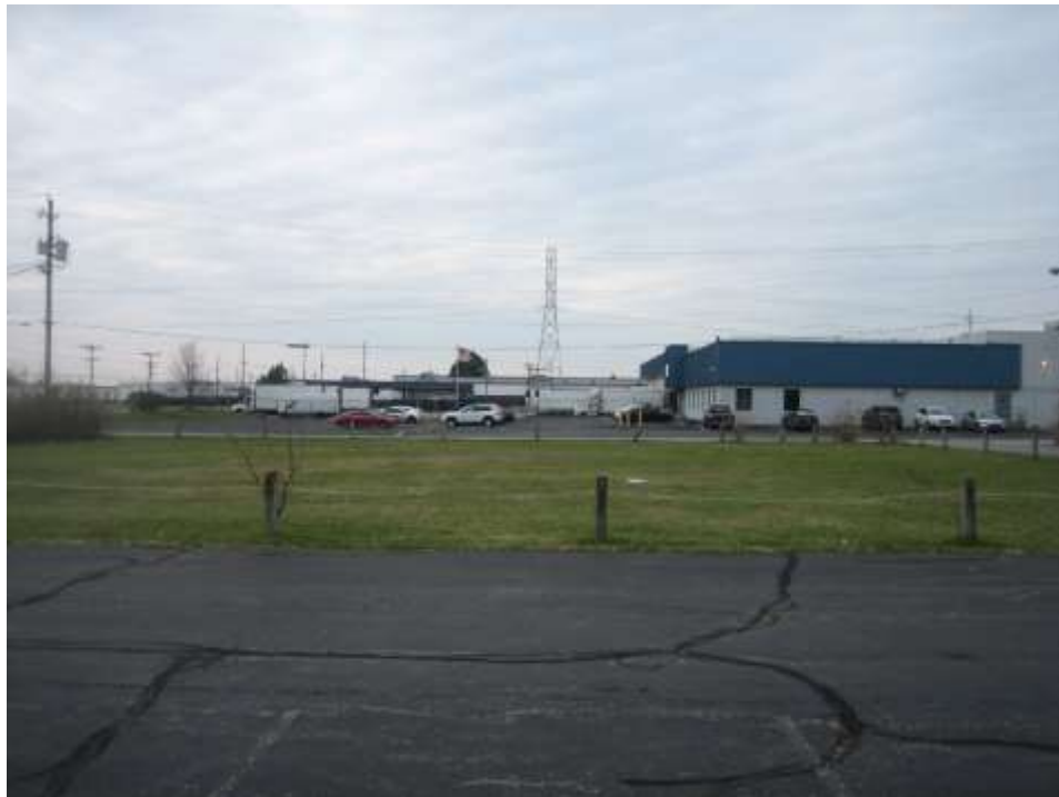
Subject site, rear of existing building looking west.