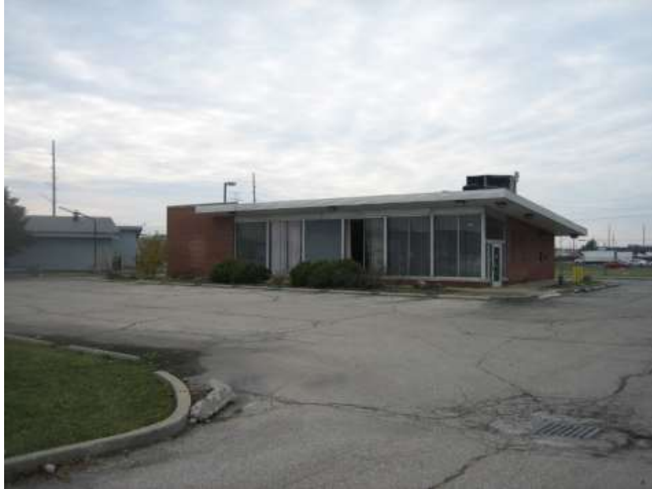
Subject site existing building, looking west.