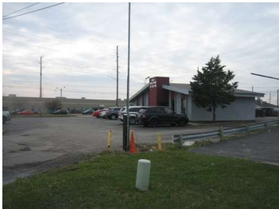
Adjacent commercial uses to the south, looking southwest.