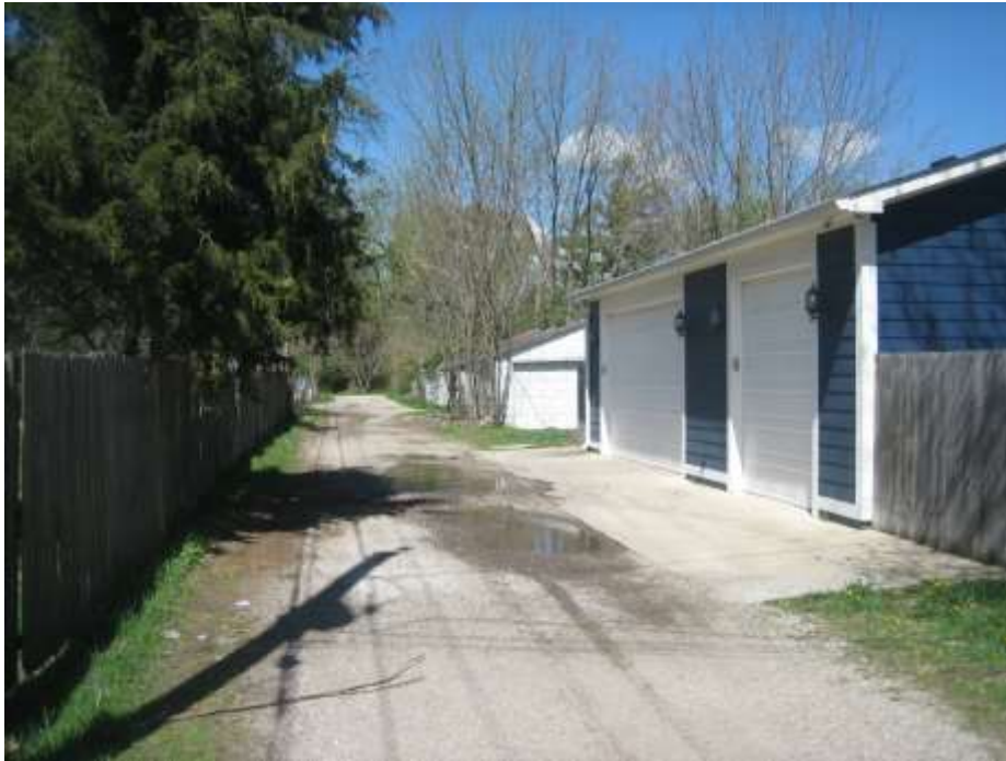
Photo of attached garage with with an 11-foot rear setback, looking north.