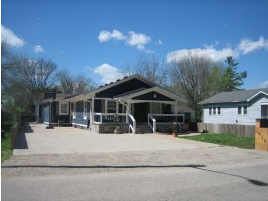
Photo of subject site, looking west.