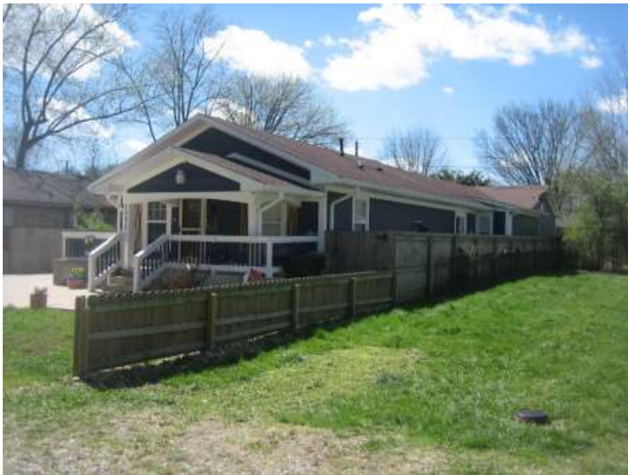
Photo of subject site, north elevation, looking southwest.