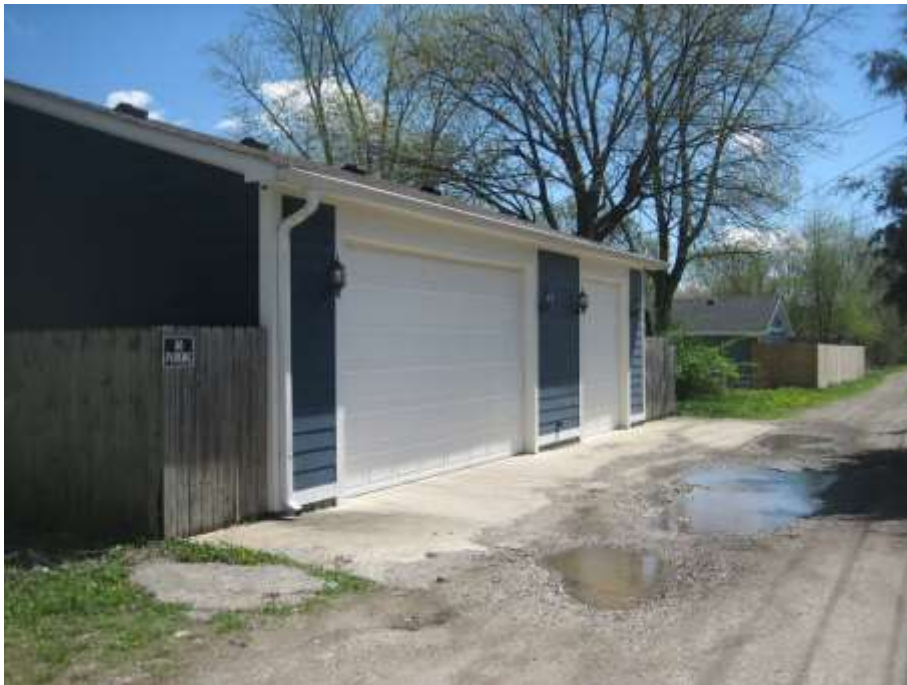
Photo of attached garage with with an 11-foot rear setback, looking south.