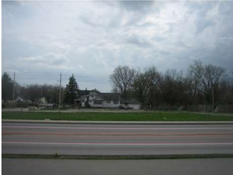
Subject site undeveloped, looking south from East 38 th Street