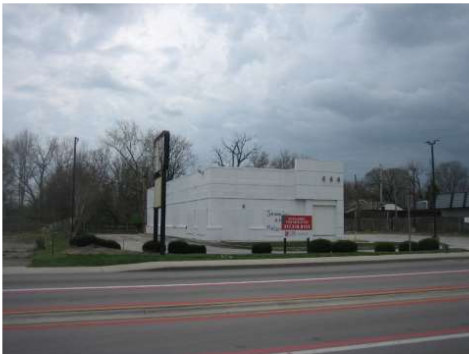
Adjacent vacant commercial restaurant to the west, looking south.