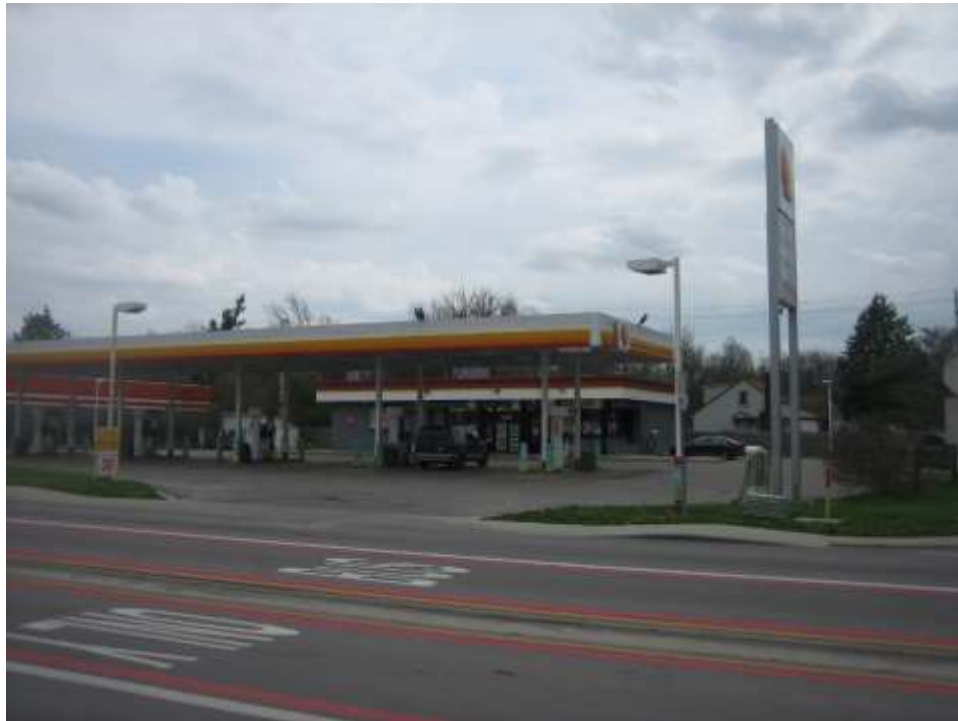
Adjacent commercial gas station to the east, looking south.