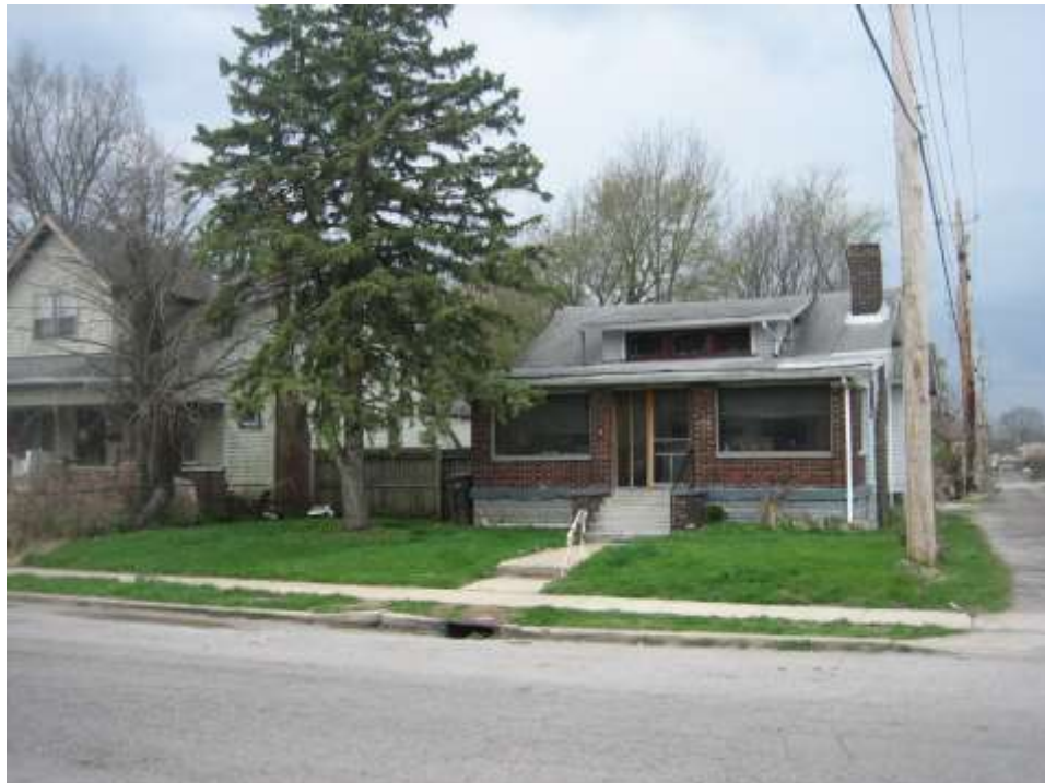
Adjacent single family dwelling residential district to the south, looking west.