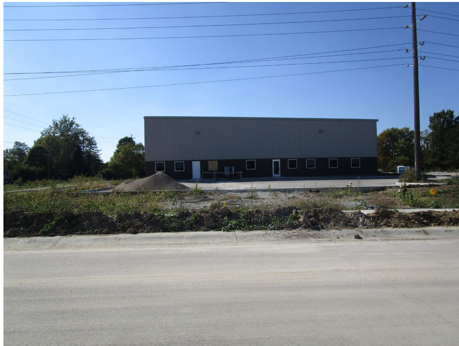
Figure 2 - New construction on proposed Lot 1