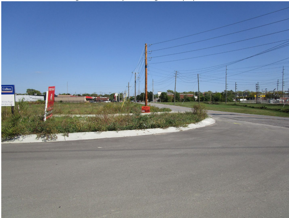
Figure 6 - Industry Dr & 16th Street looking east