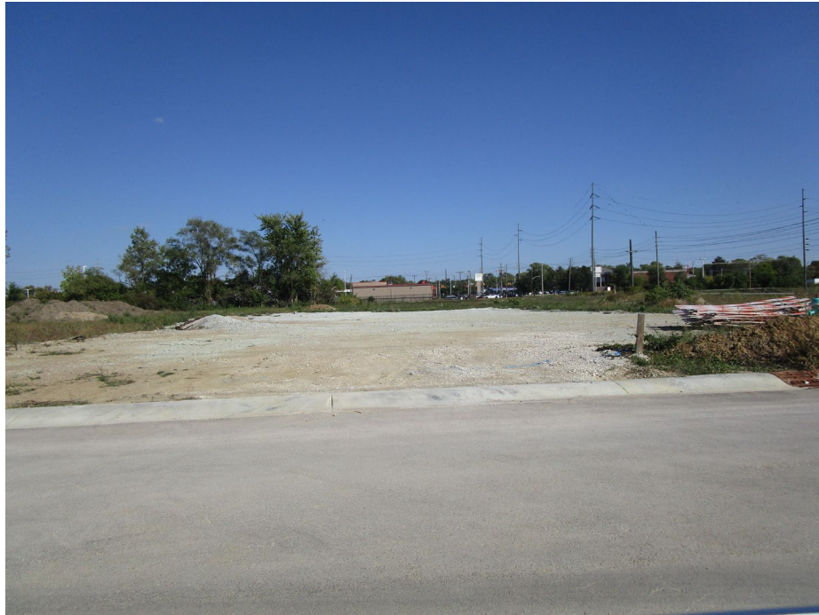
Figure 5 - Industry Dr looking east at proposed Lot