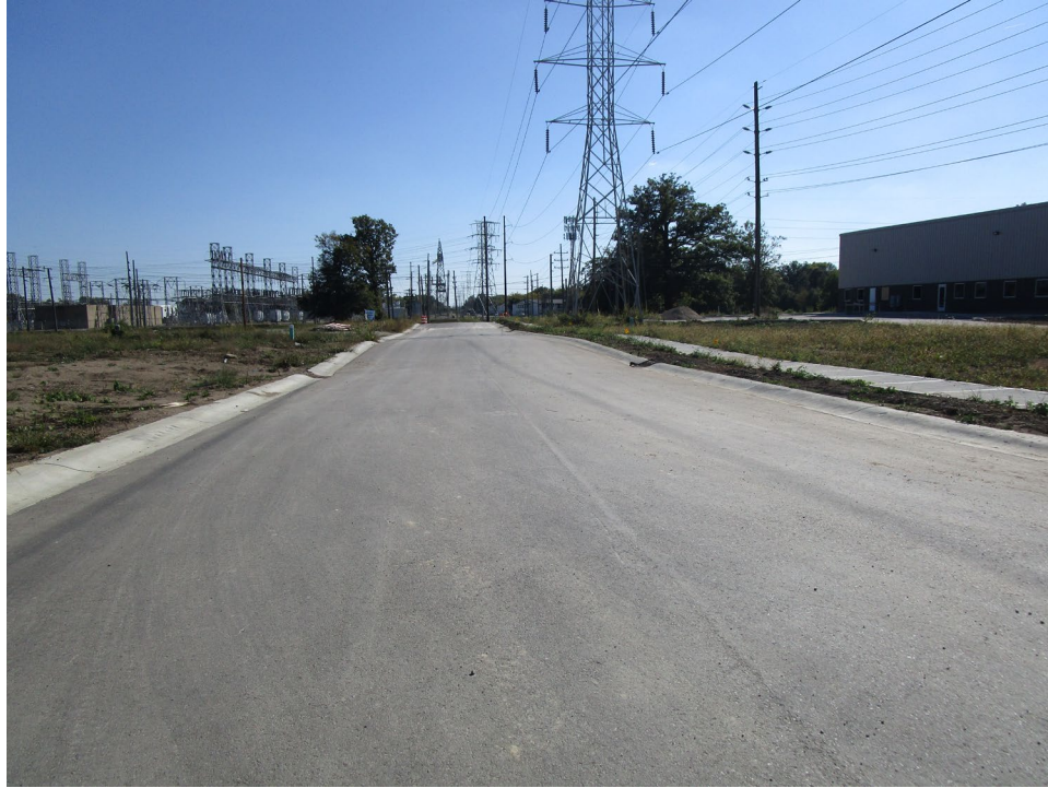
Figure 3 - Industry Drive looking south