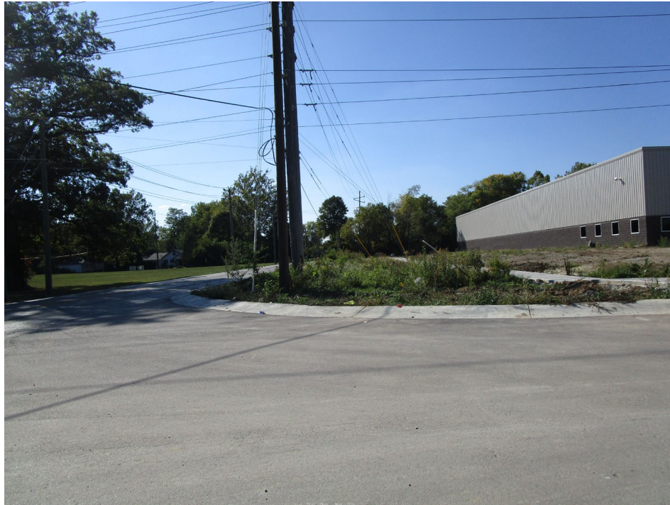
Figure 1 - Intersection of Industry Dr and 16th Street looking west