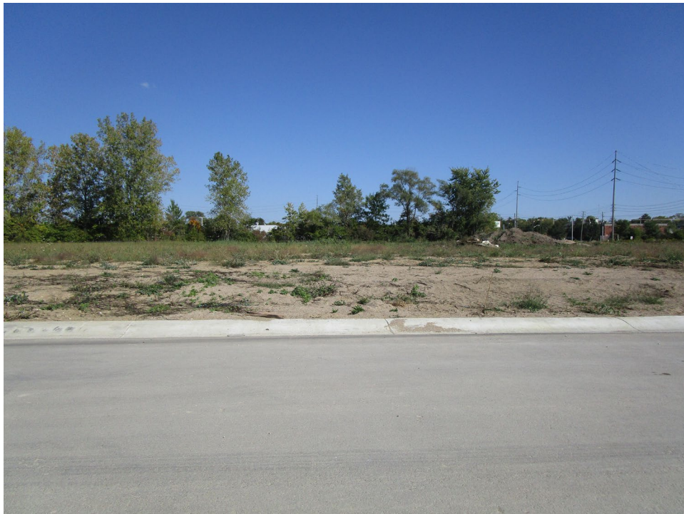
Figure 4 - Industry Drive looking east at proposed Lot 3