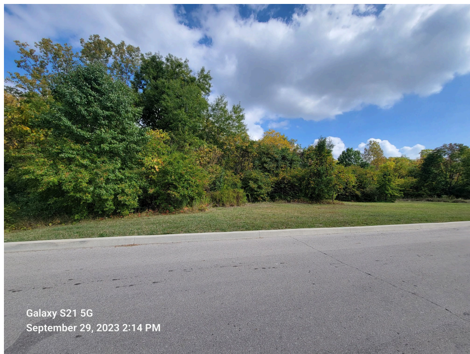
Figure 2 - Looking east at subject site