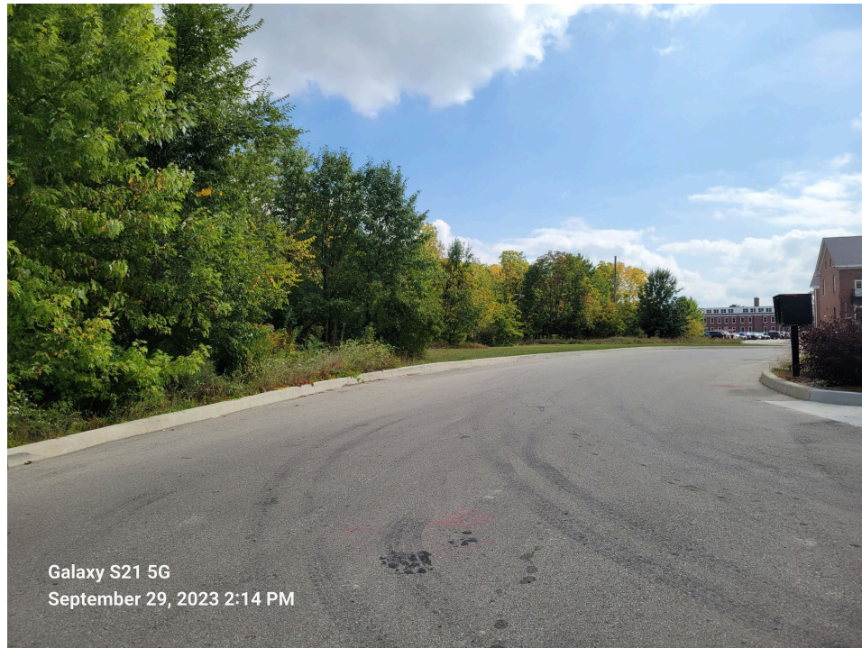
Figure 1 - Looking south - subject site to left