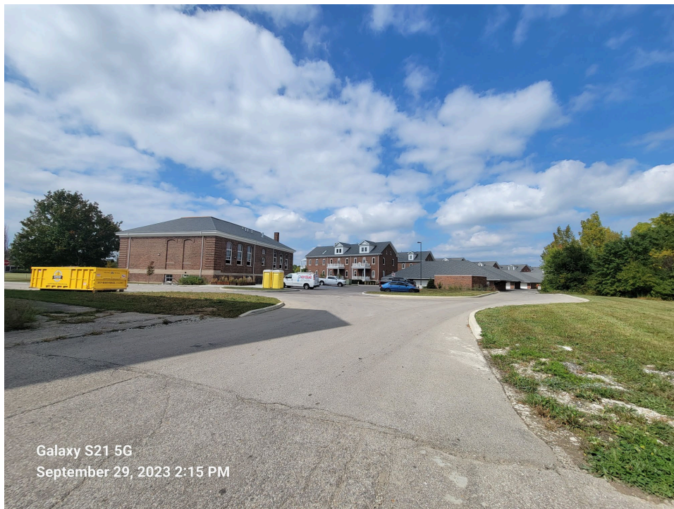
Figure 4 - Looking north at condominiums