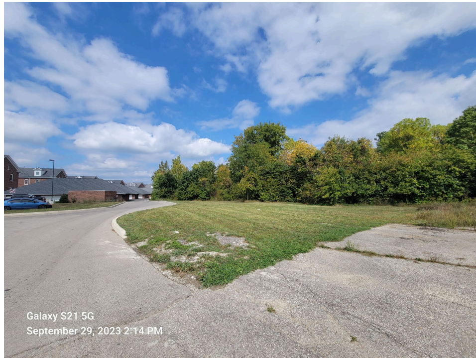
Figure 3 - Looking North - subject site to right