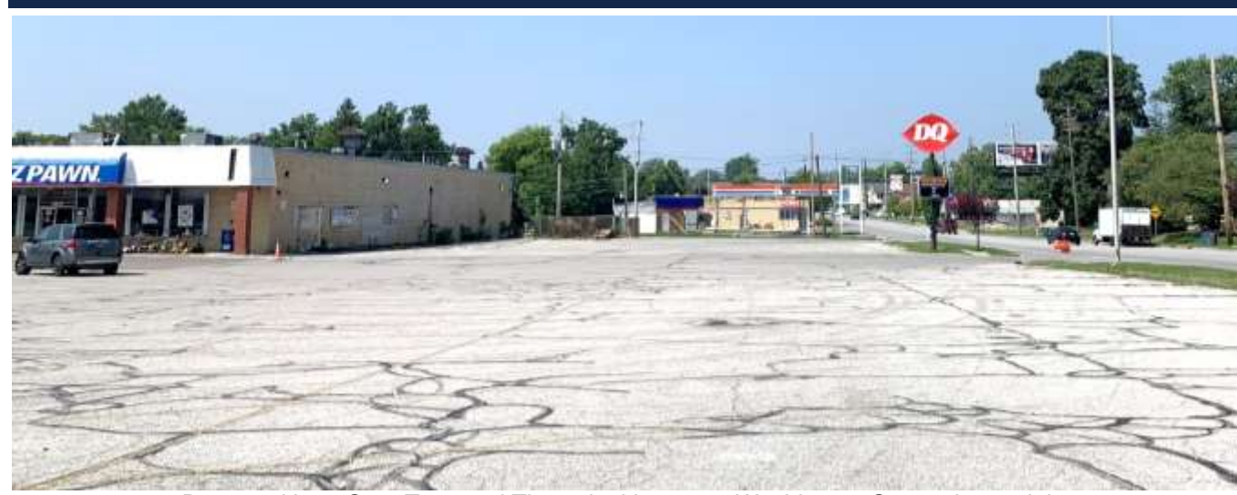
Proposed Lots One, Two, and Three, looking west. Washington Street shown right