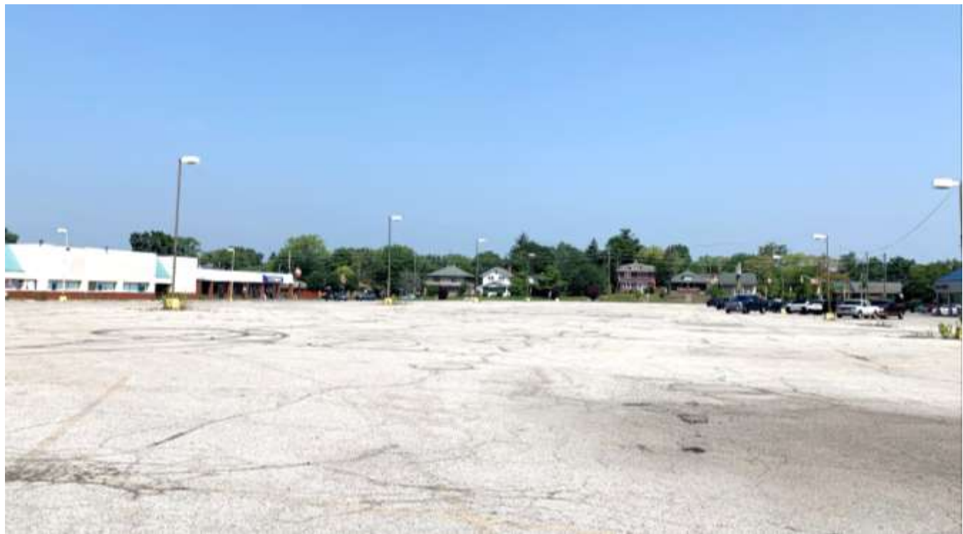
View of site from proposed Block A, proposed Lots One through Six in background, looking north