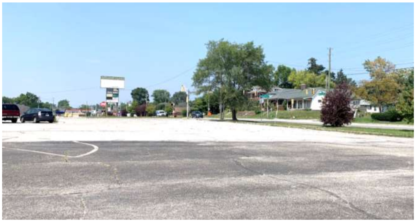
View of Lots One through Four, looking west