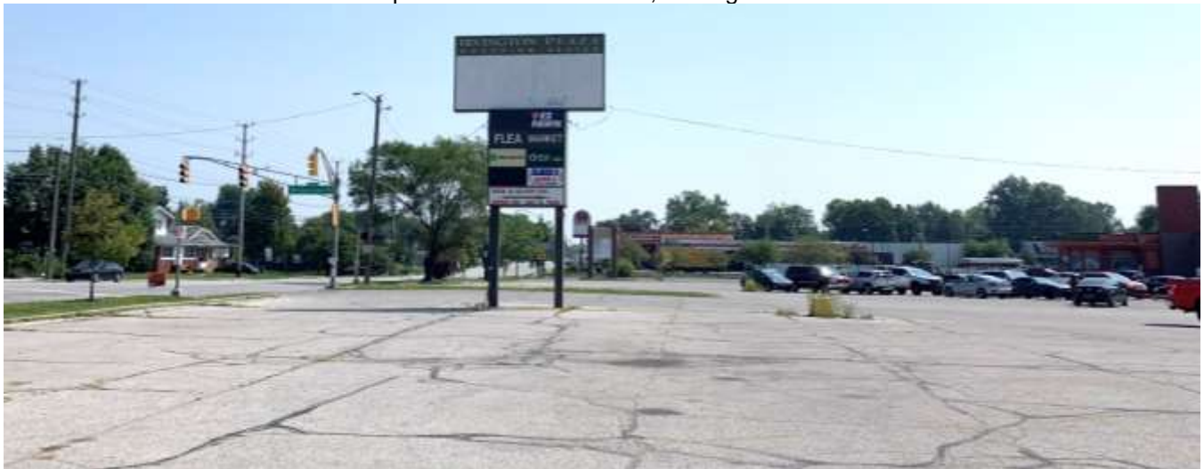
Proposed Lots Four and Five, looking east. Washington Street shown left.