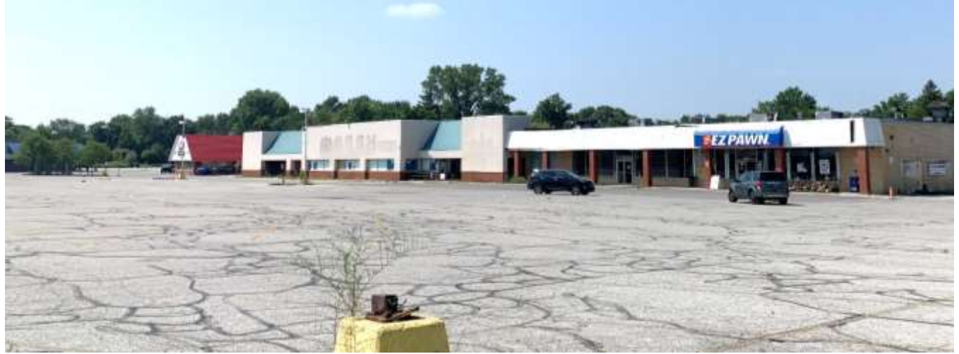
Proposed Lot Two and Block A, looking southwest