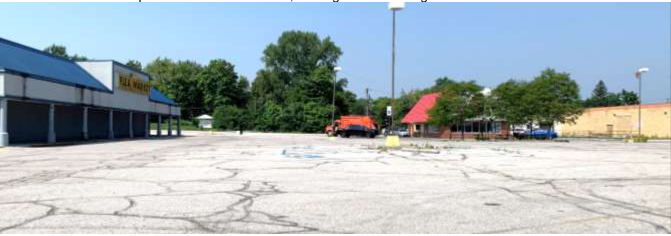
Proposed Block A, looking west