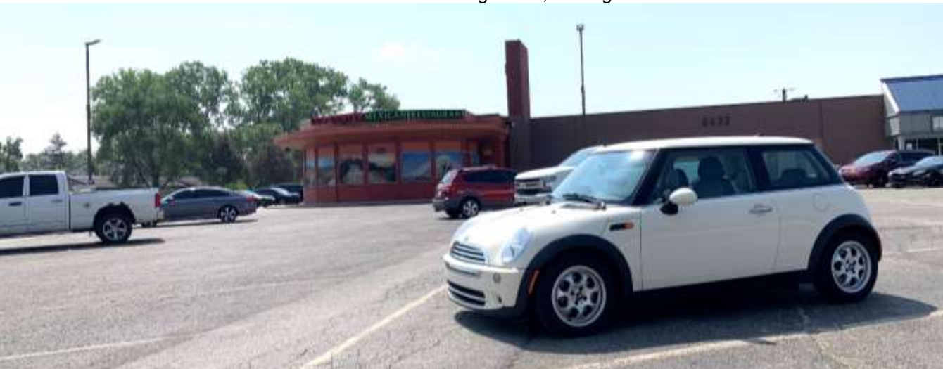
East of site, looking south