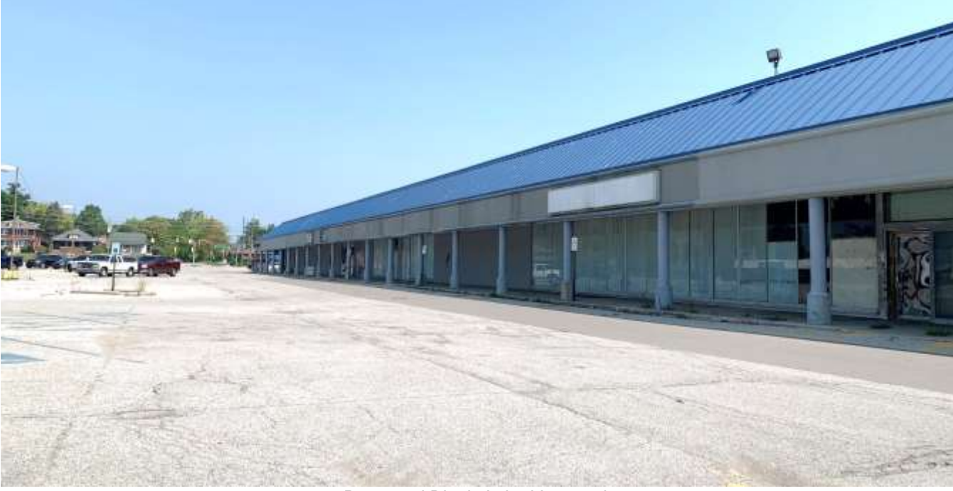
Proposed Block A, looking north