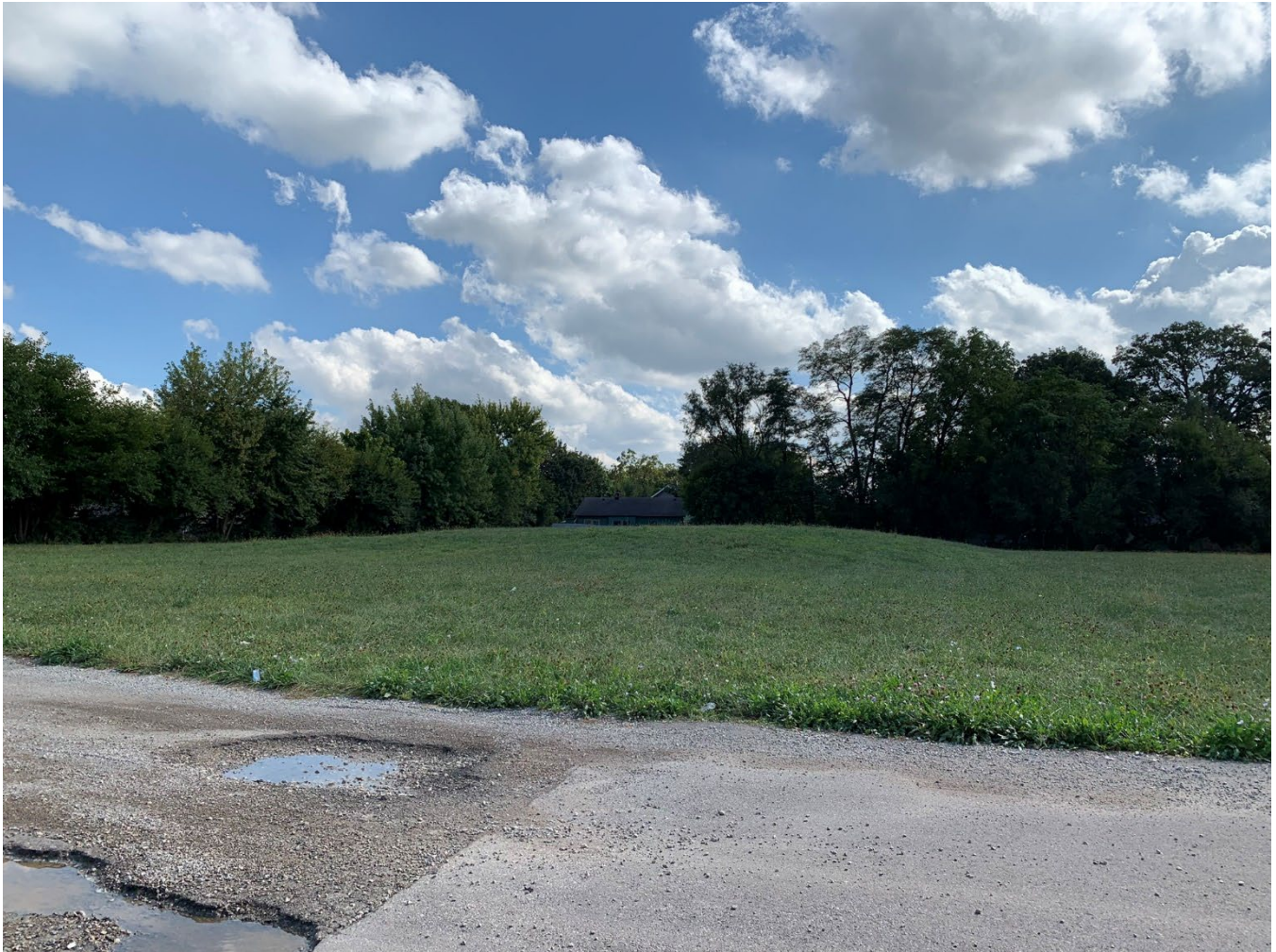
View of Proposed Lot Six