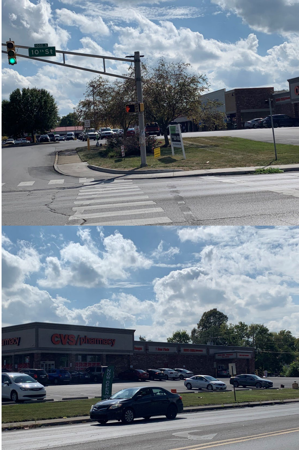
Views of Proposed Lot One