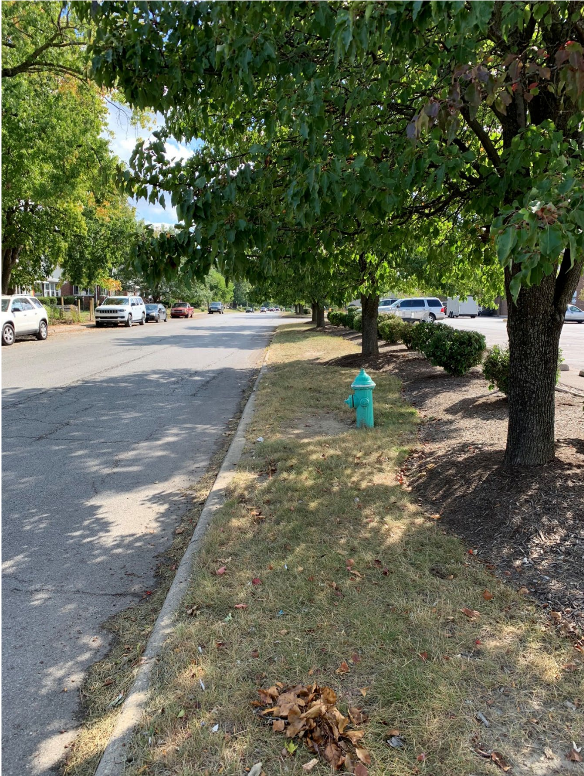
View of Linwood Avenue frontage along Proposed Lot Two, looking south