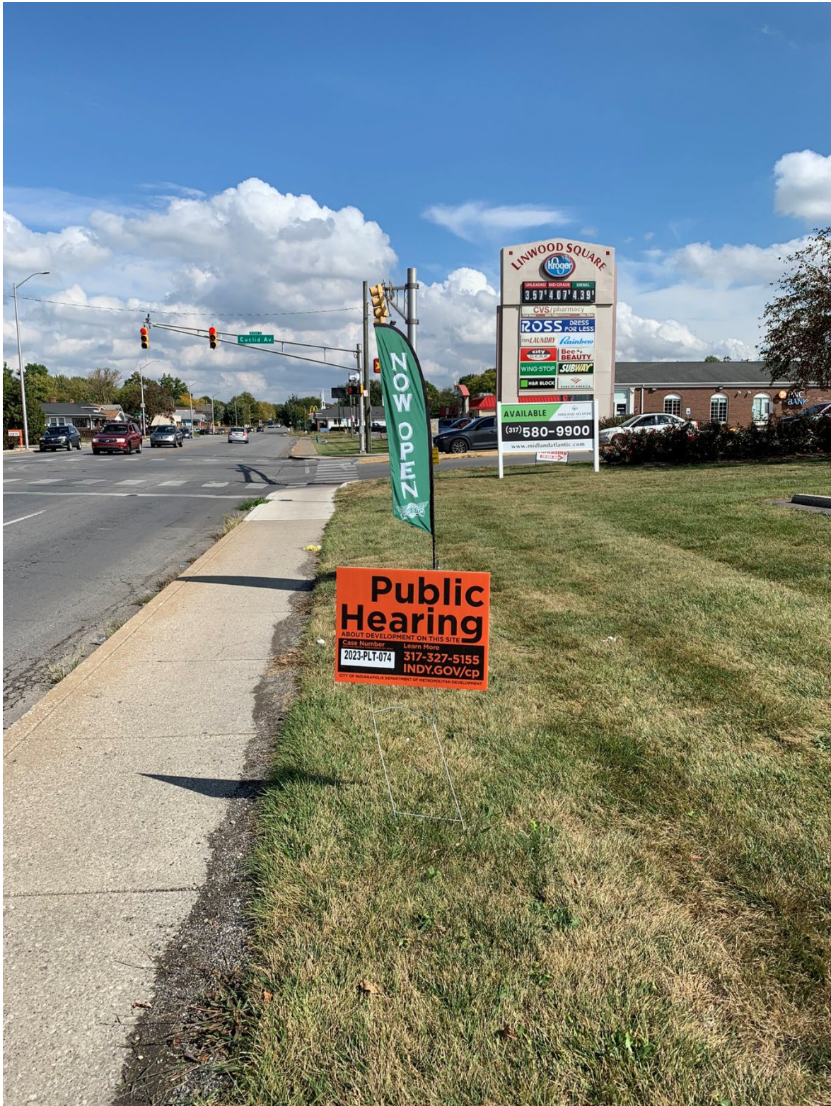
View Washington Street frontage along Proposed Lots One, Three and Four, looking east