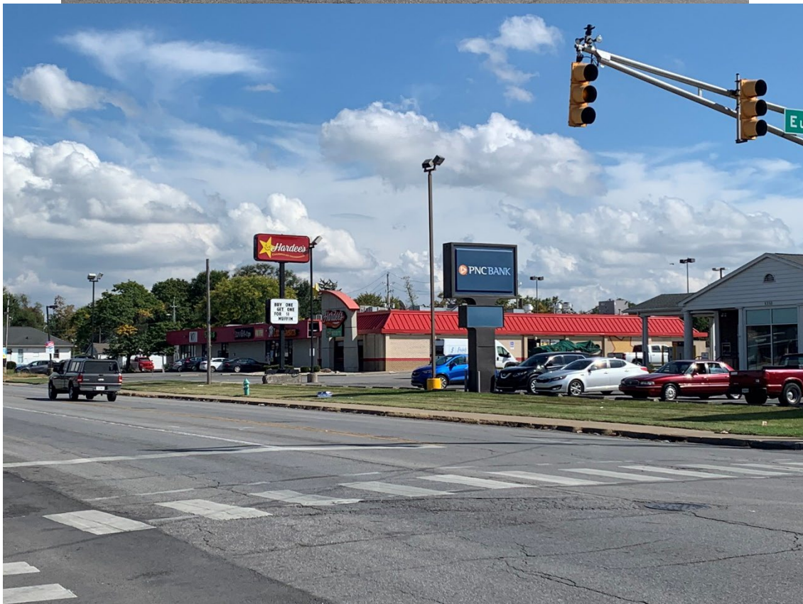
Views of Proposed Lots Three and Four