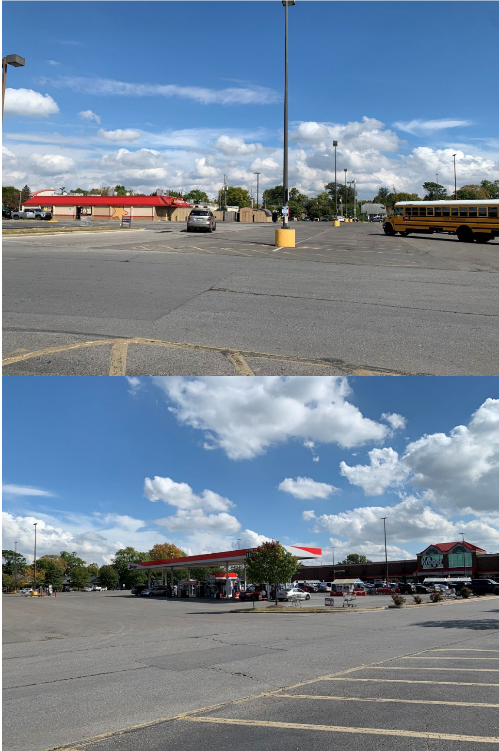
Views of Proposed Lots Two and Five