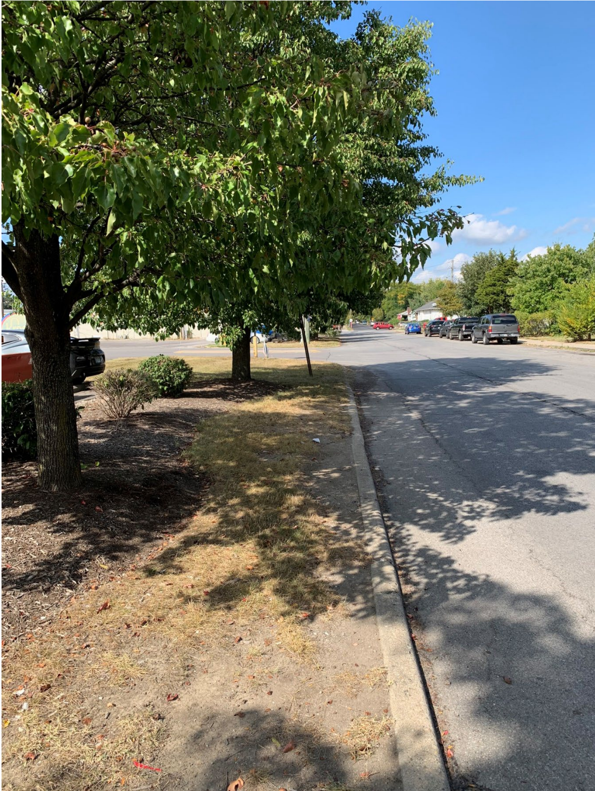
View of Linwood Avenue frontage along of Proposed Lots Two and Five, looking north