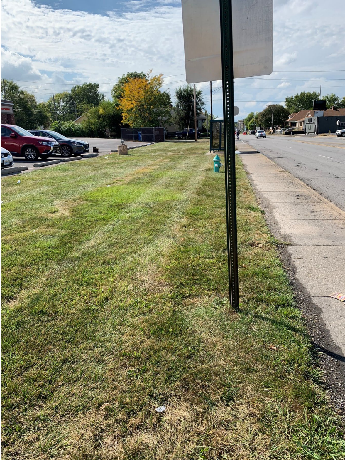
View of Washington Street frontage along Proposed Lot One, looking west