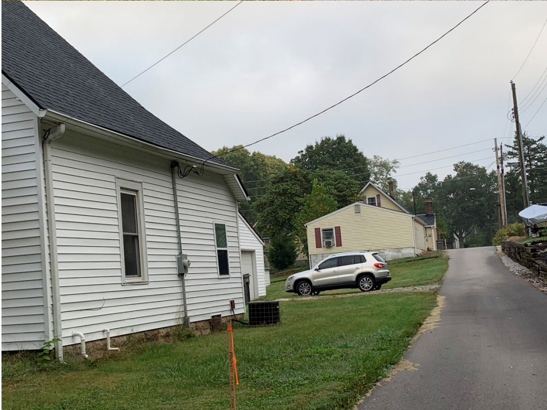
Views of the site along Market Street and along the alley south of the existing dwelling