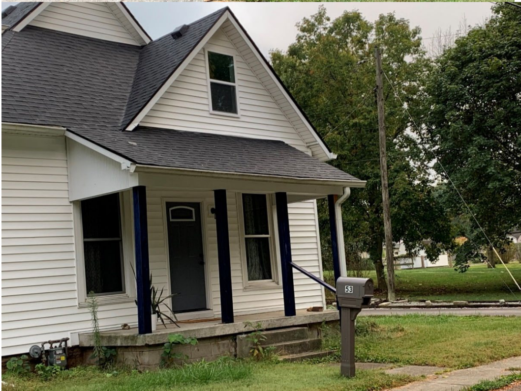
Views of the undeveloped northern portion of the lot and the existing dwelling on the southern portion of the lot