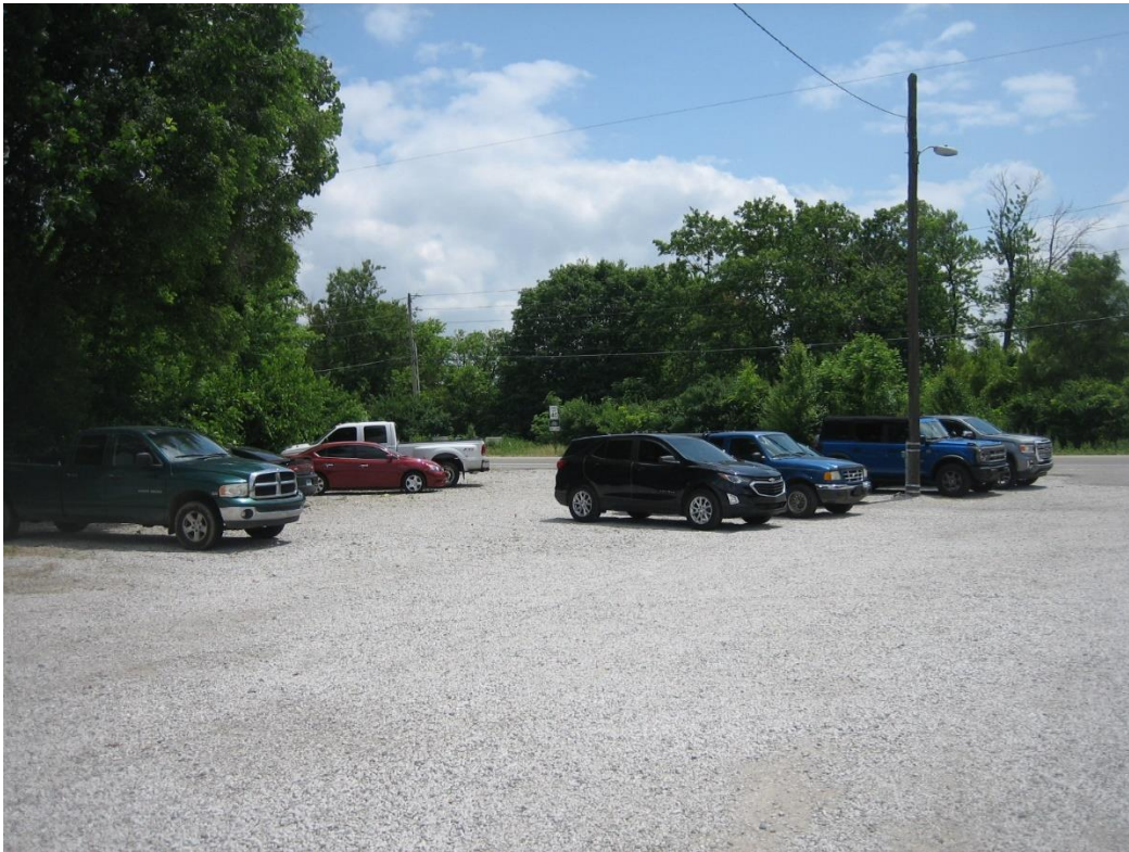
subject site looking southeast