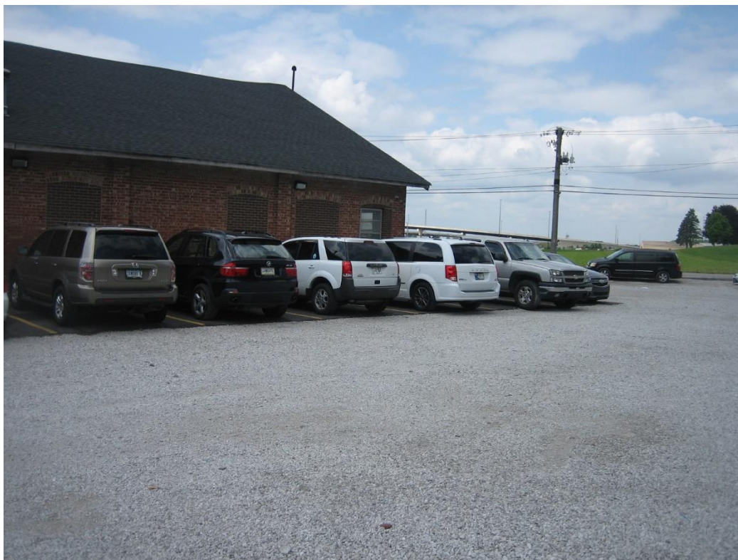
subject site looking north.