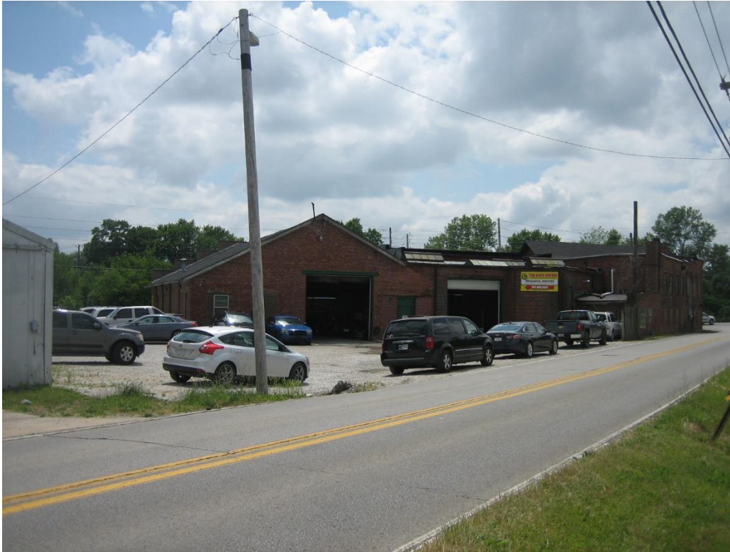
Subject site, looking southwest