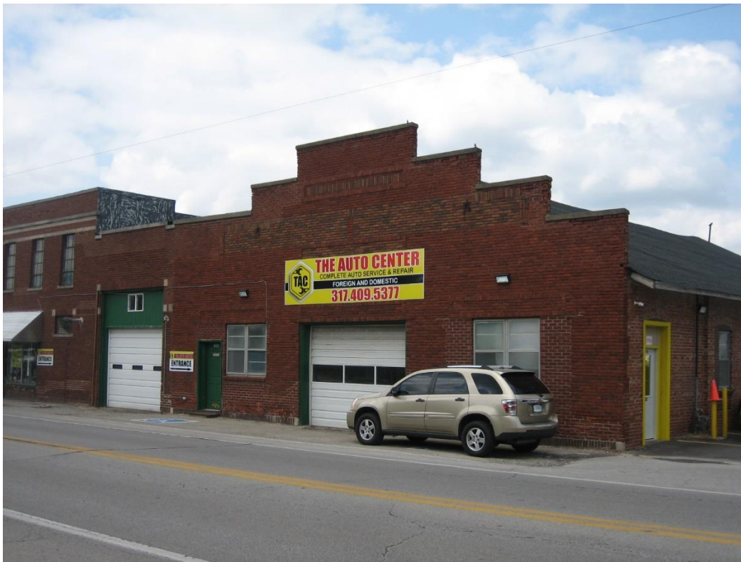
Subject site looking north