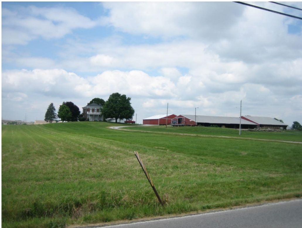
Adjacent single family residential and agricultural use to the north of site.