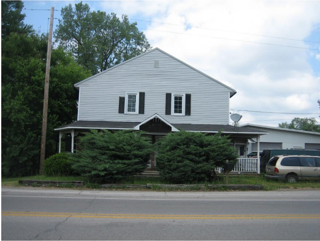
Adjacent single family residential to the east of site, looking north.