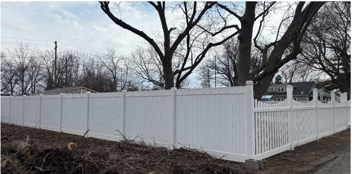
Residential property south of subject site.