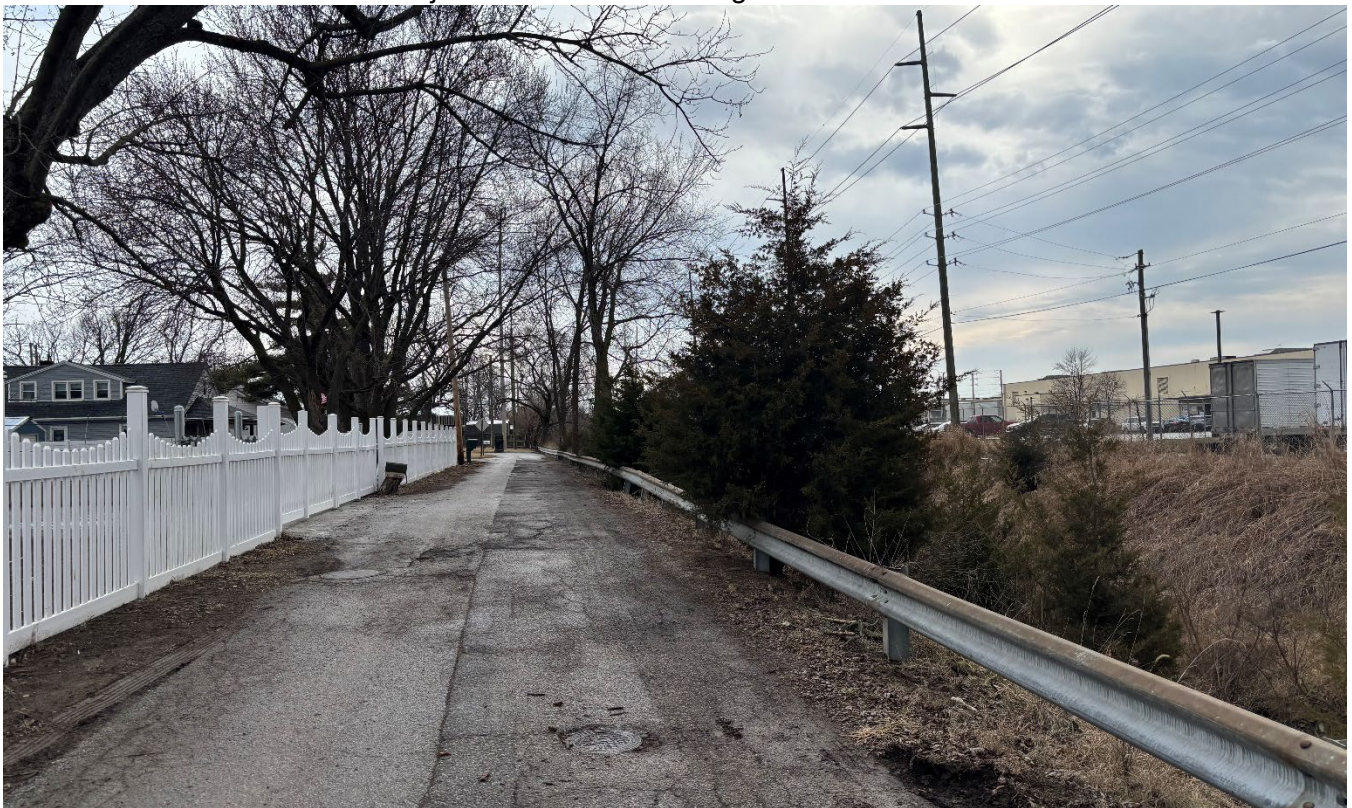
Looking south along Biltmore avenue