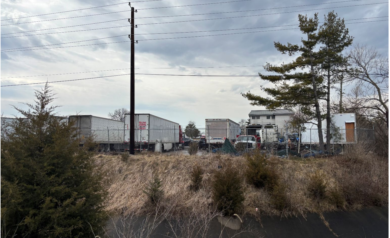
Looking east from the subject site.