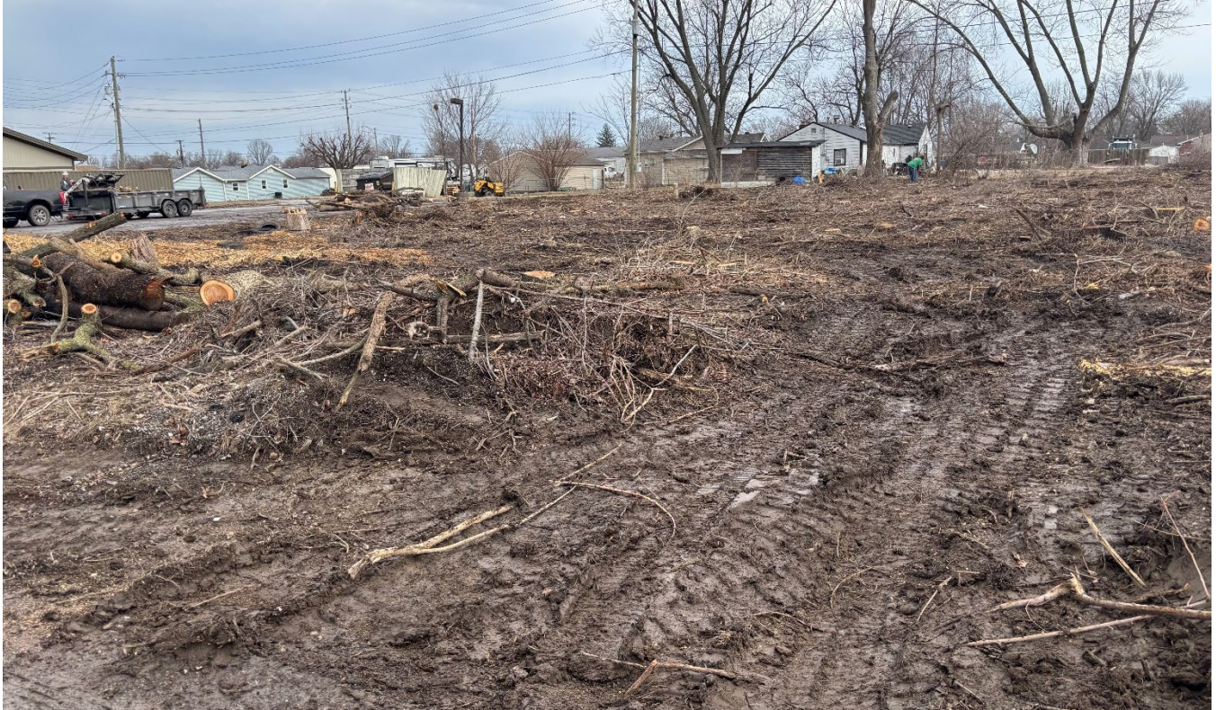
Subject site looking east along Biltmore Avenue.