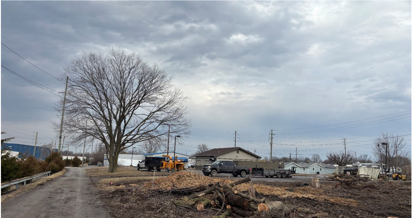
Subject site look north along Biltmore Avenue