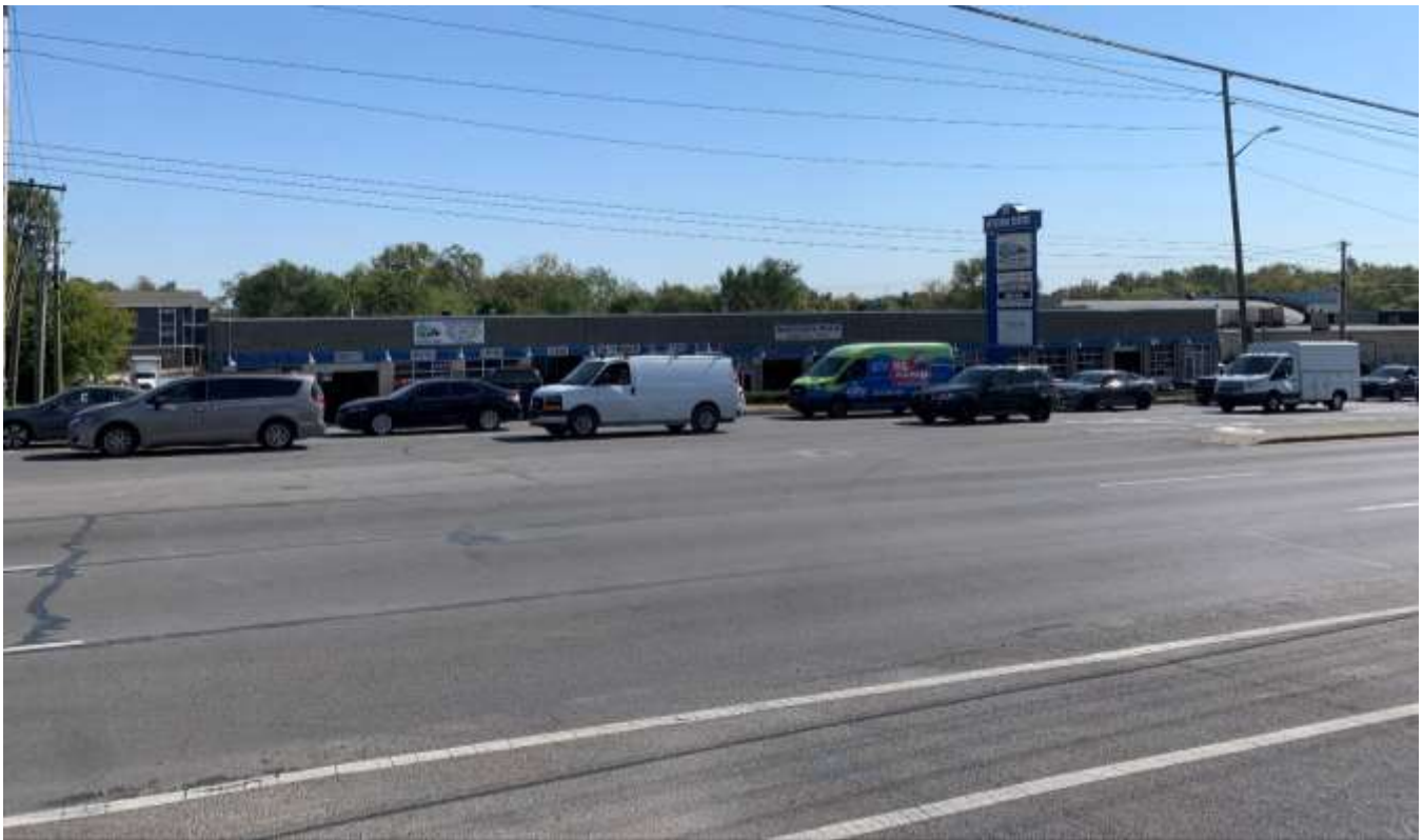
Photo of a commercial shopping strip east of the site.