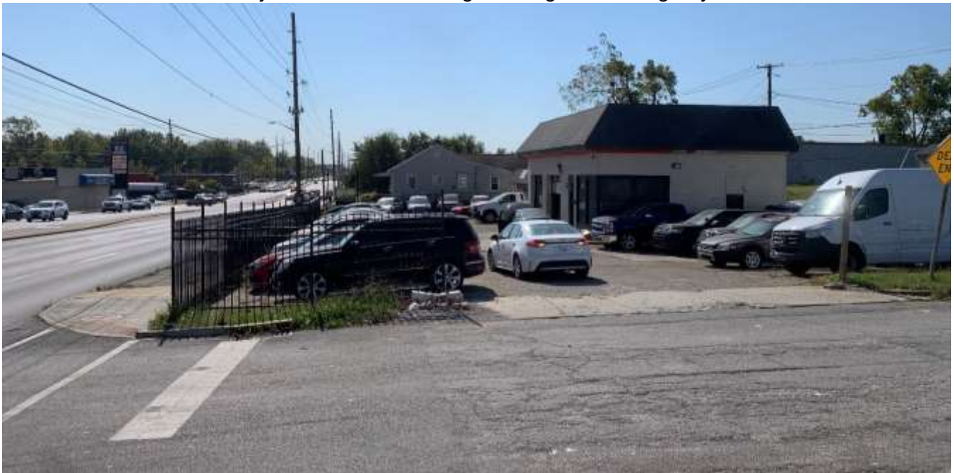
Photo of the subject site looking south from 45 th Street.