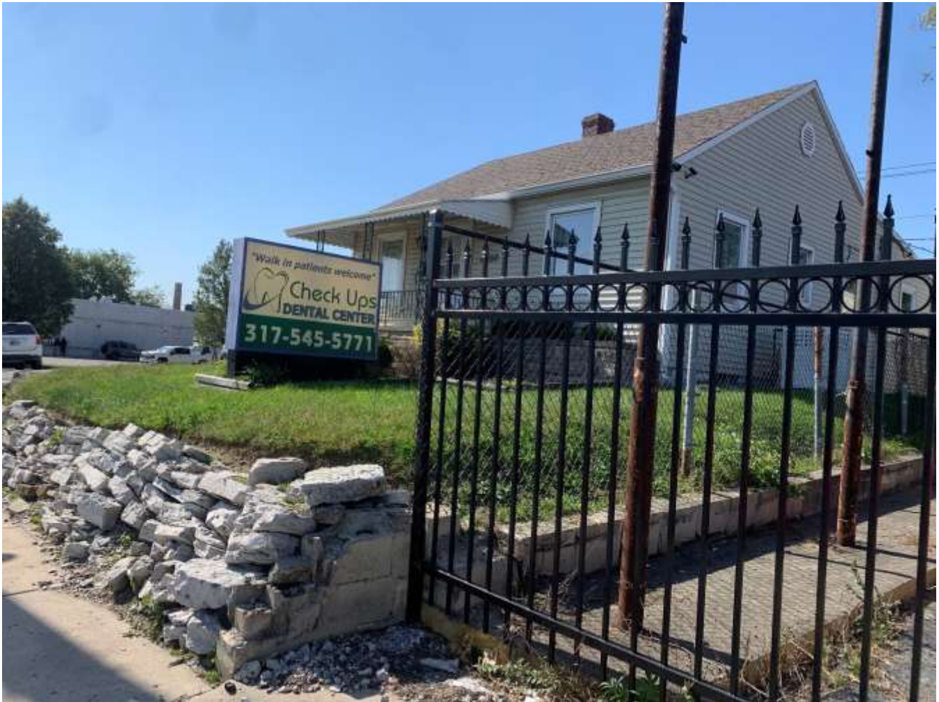
Photo of the dentist office south of the site zoned C-3.