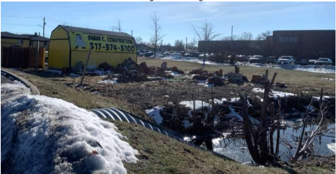
Proximity of outdoor storage in relation to the Blue Creek Stream.