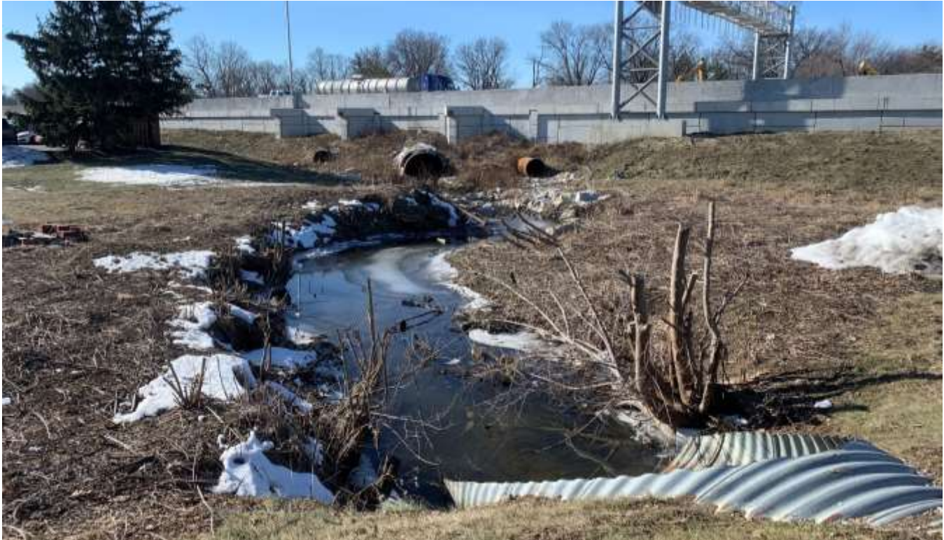
Photo of Blue Creek Stream and interstate in the background.