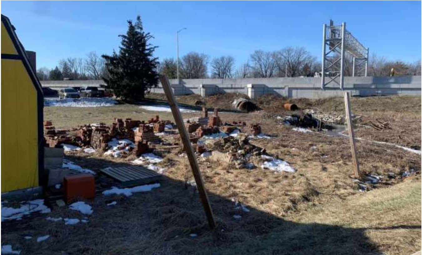
Photo of the existing outdoor storage of materials.