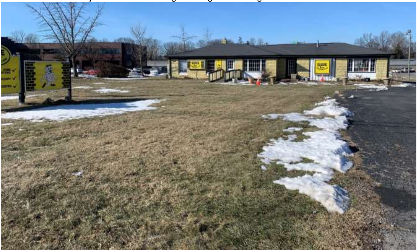
Photo of the subject site.