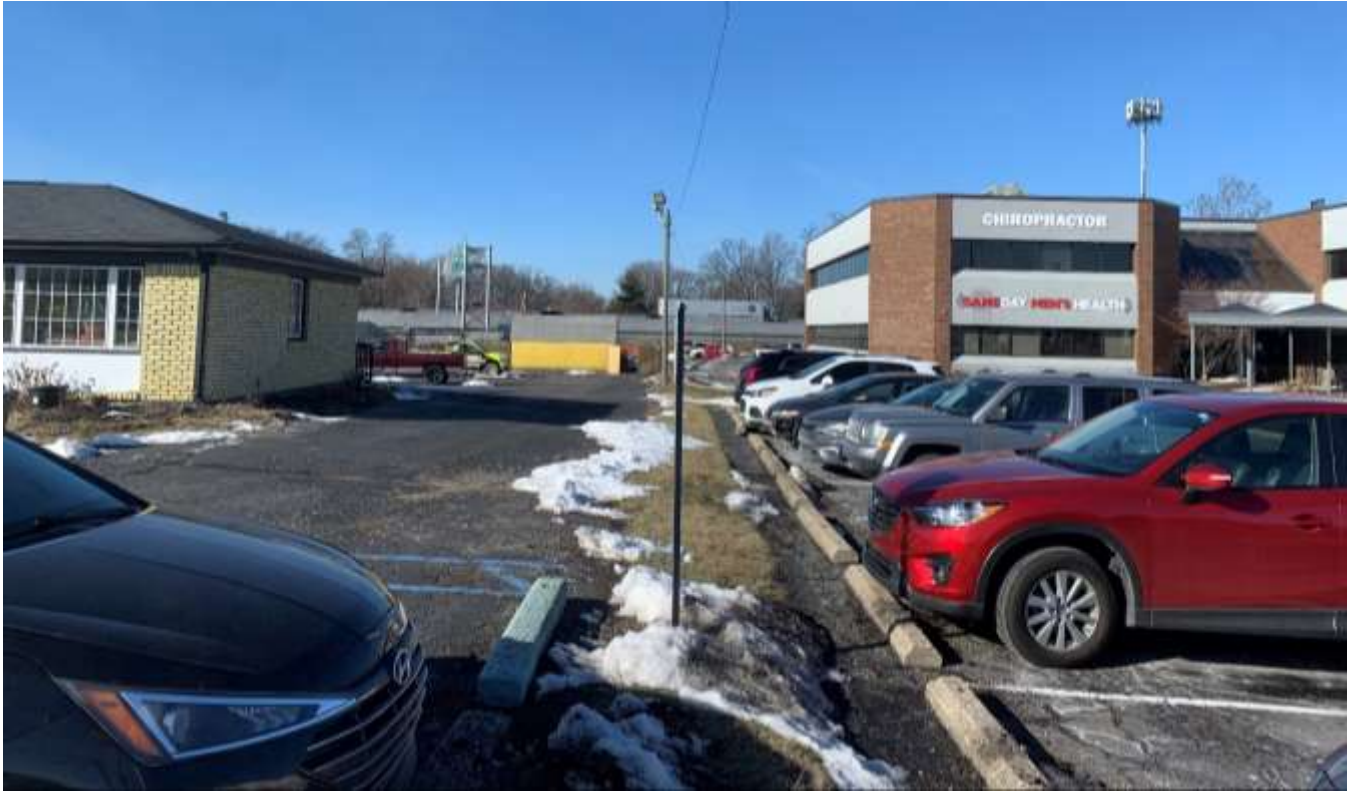
Northern property boundary looking west.