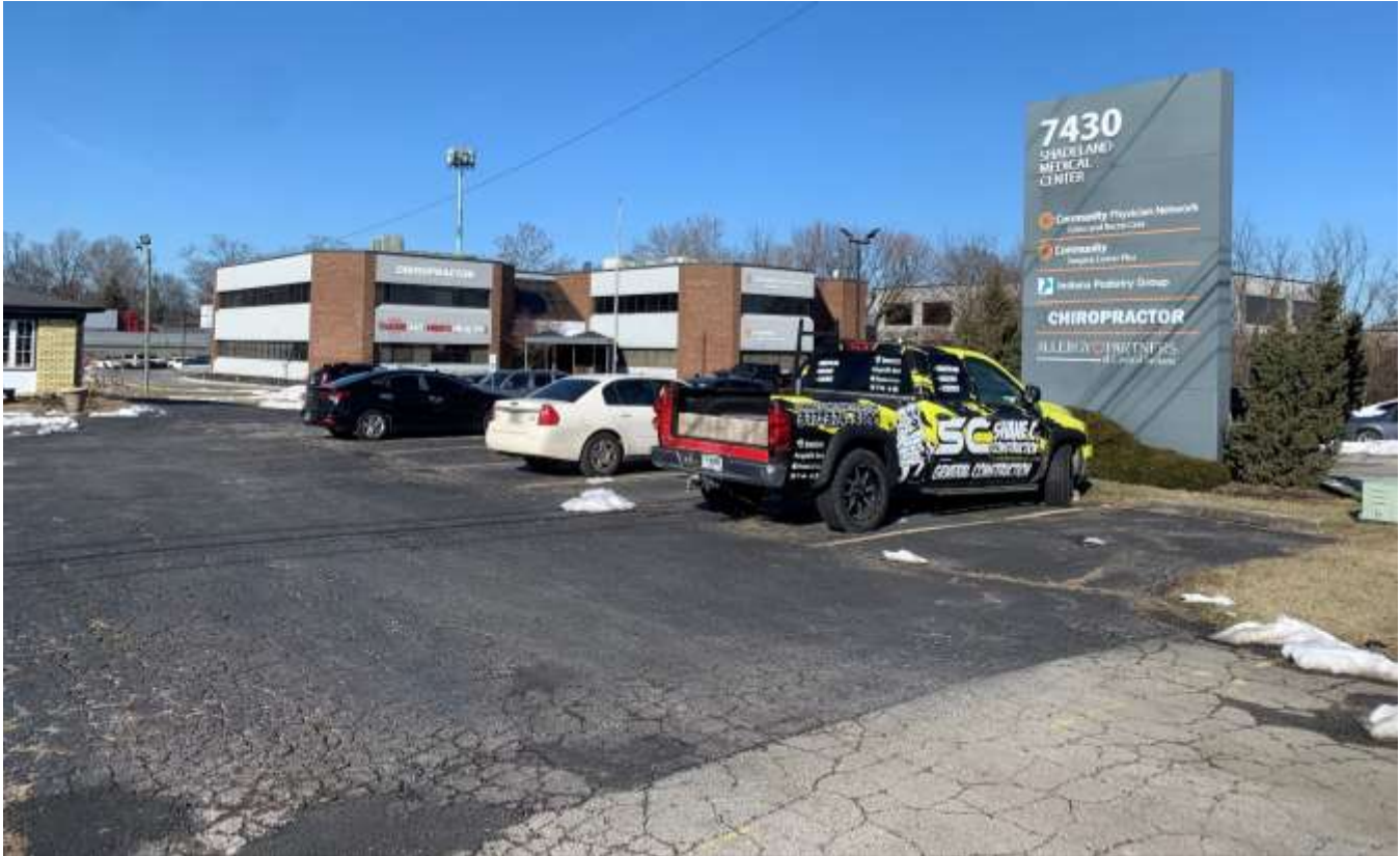
Photo of the front parking area and offices north of the site.