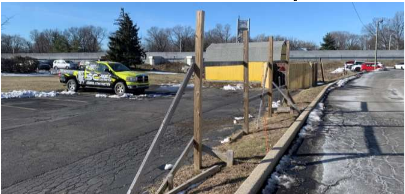
Photo of what appears to be the start of a perimeter fence and enclosed dumpster at the rear.