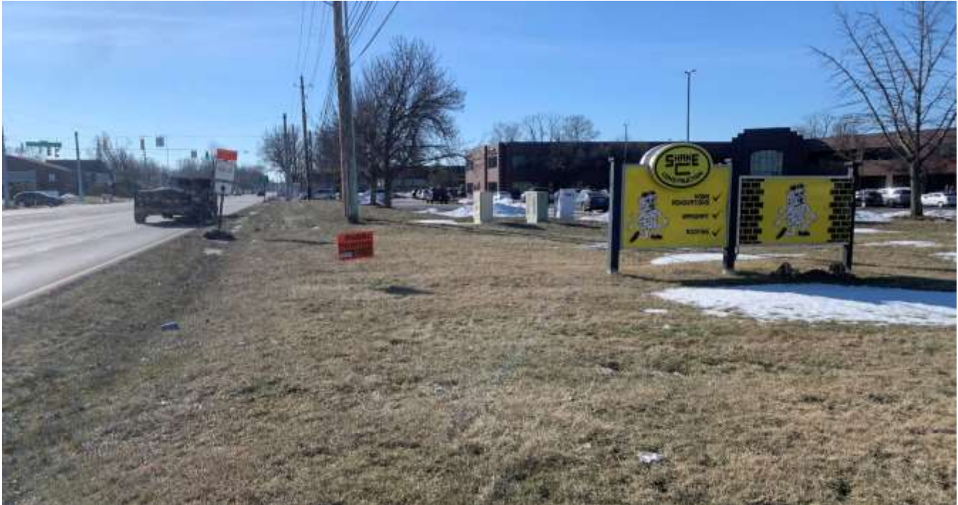
Subject site street frontage looking south along Shadeland Avenue.