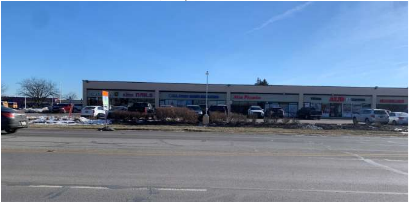
Commercial shopping strip east of the site.