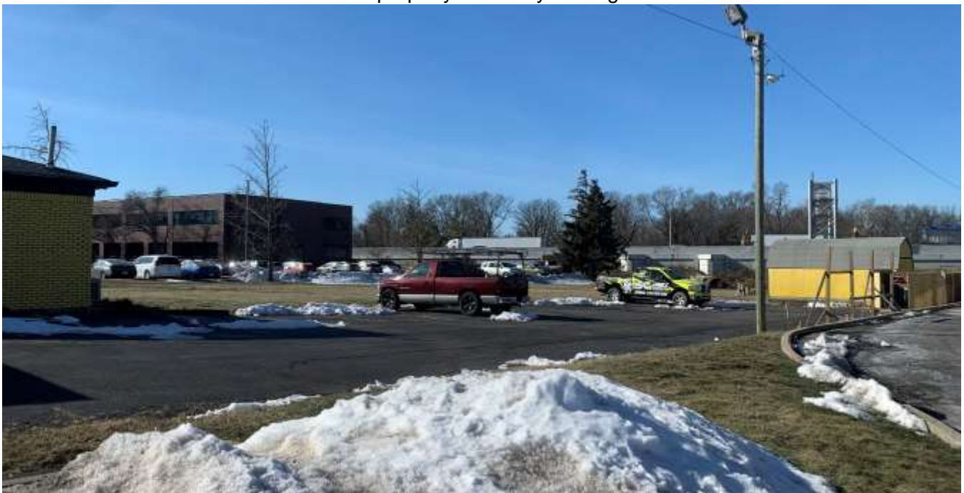
Photo of the rear parking area.