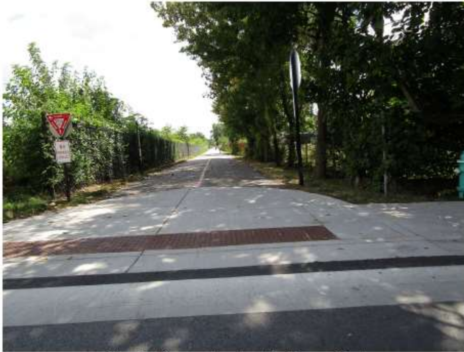
View looking south along the Monon Trail