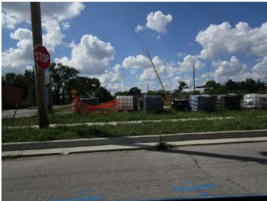
View of site looking west across Alvord Street