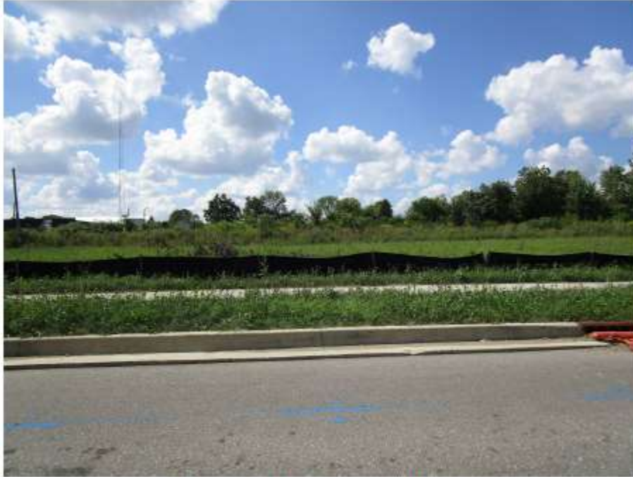
View of site looking west across Alvord Street