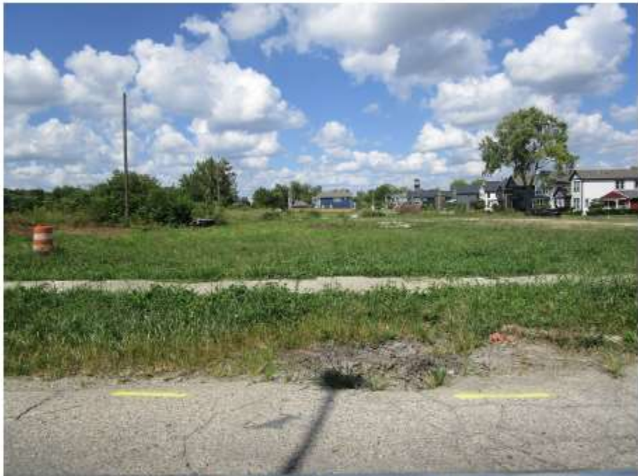
View of site looking north across East 19 th Street