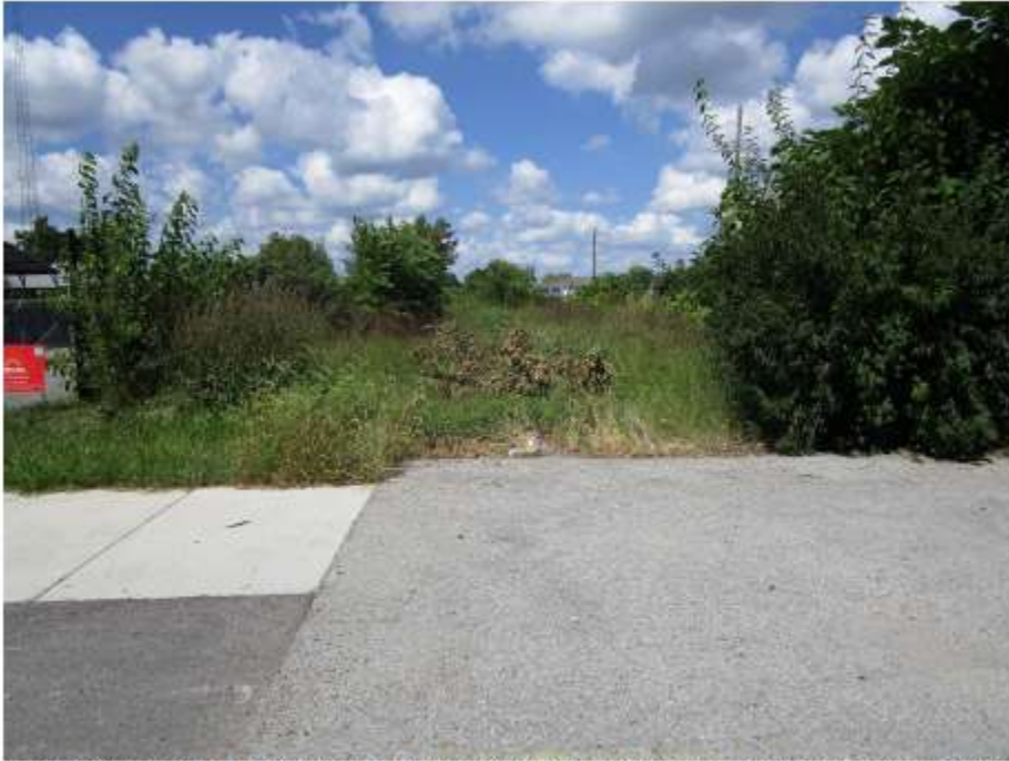
View looking north of abutting north /south alley to the west (Monon Trail on the left)