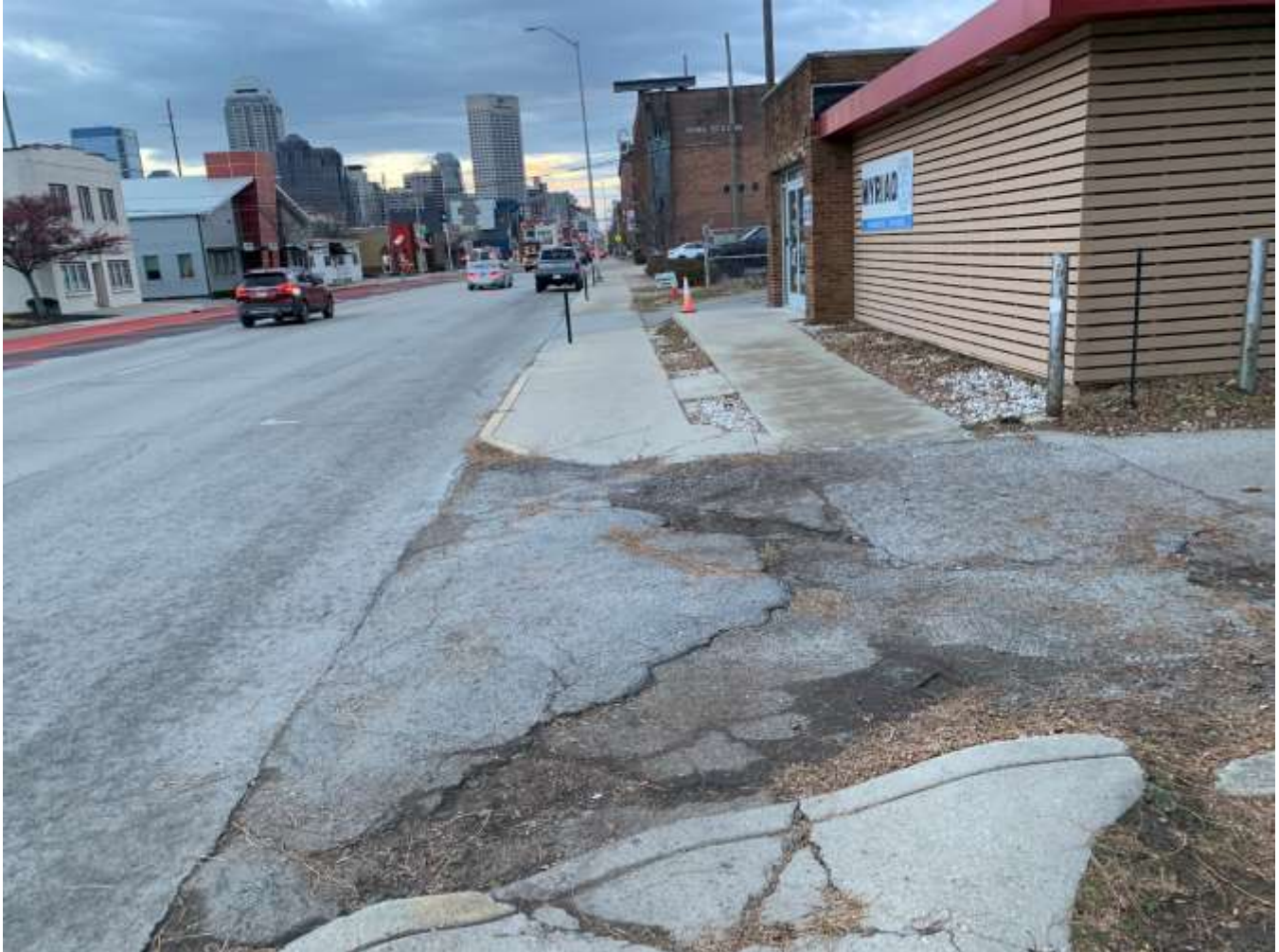
Curb cut to subject alley, from Capitol Avenue