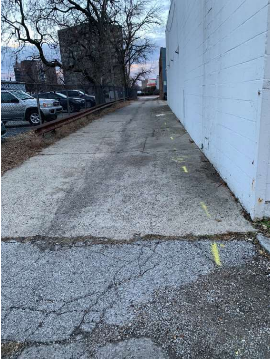
View of subject alley, looking east toward Capitol Avenue