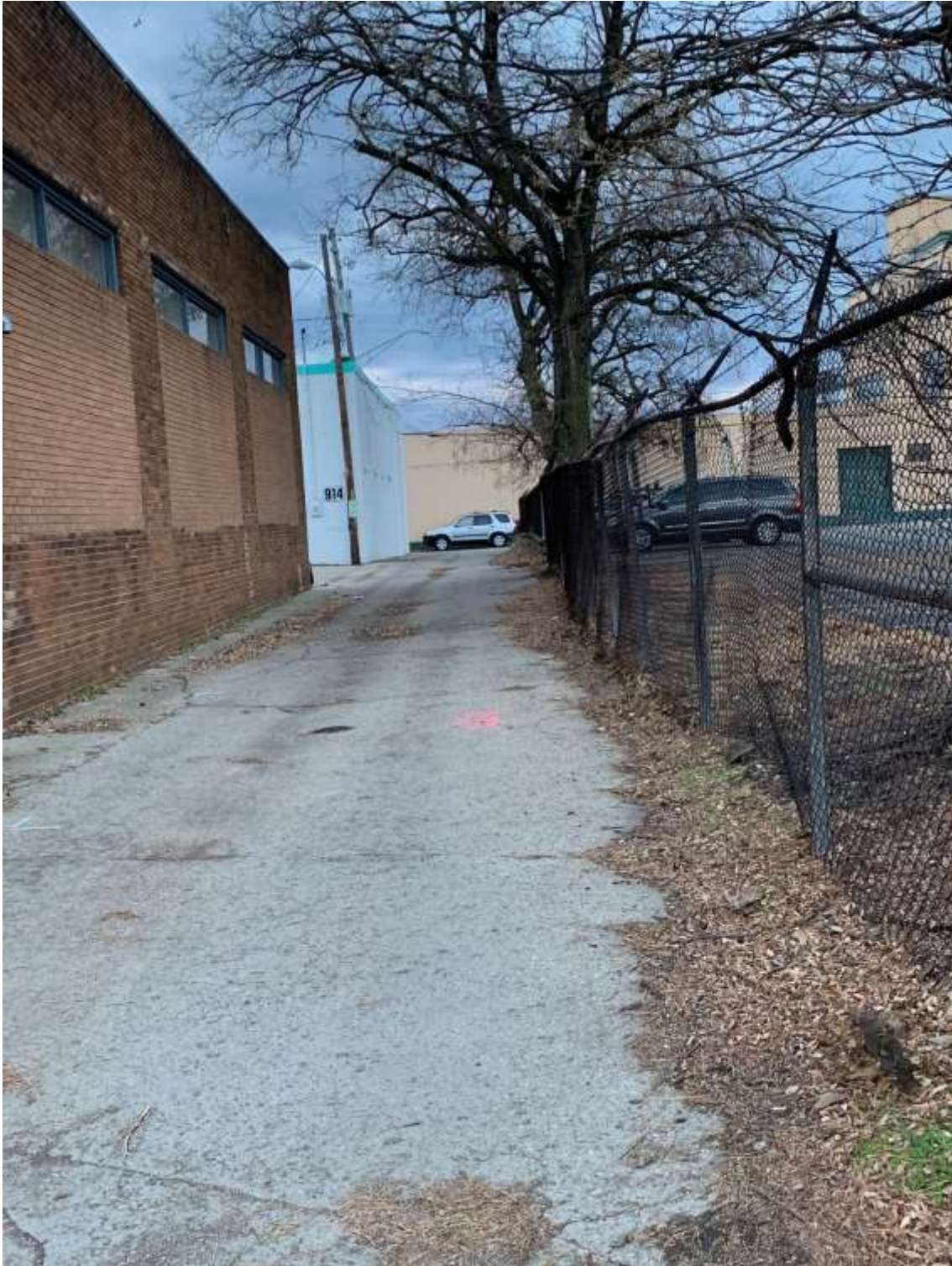
View of subject alley from Capitol Avenue, looking west toward Roanoke Street (a named alley)