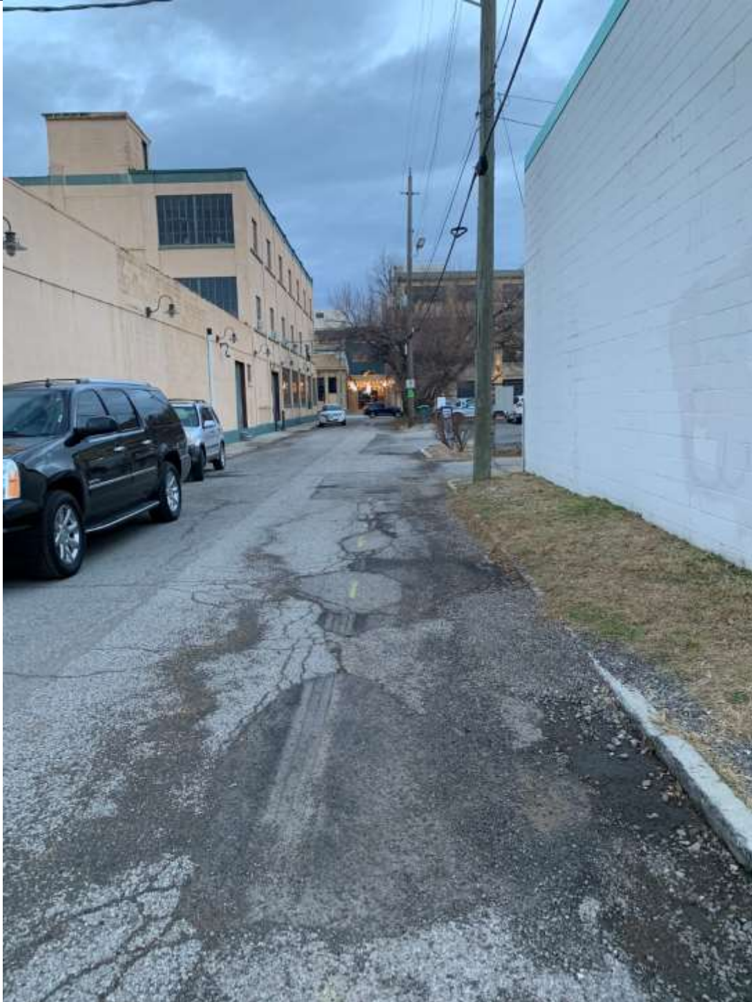
View of Roanoke Street, looking north. Subject alley is to the north of the white building