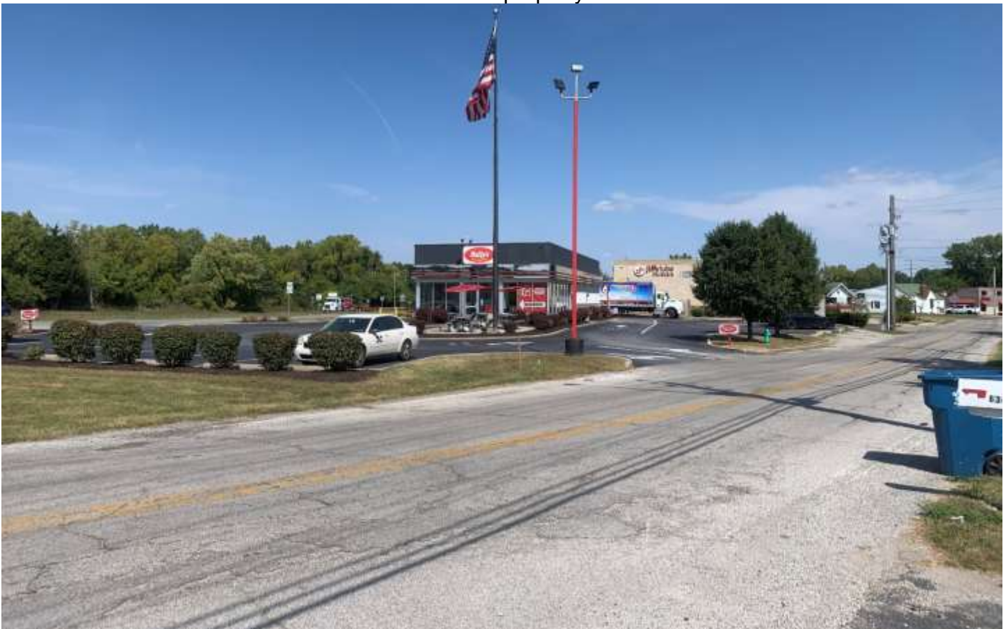
Photo looking north across Thompson Road at the commercial property.