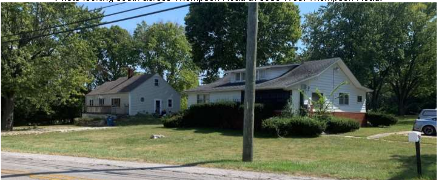
Photo looking south across Thompson Road to subject site and adjacent single-family dwelling east.