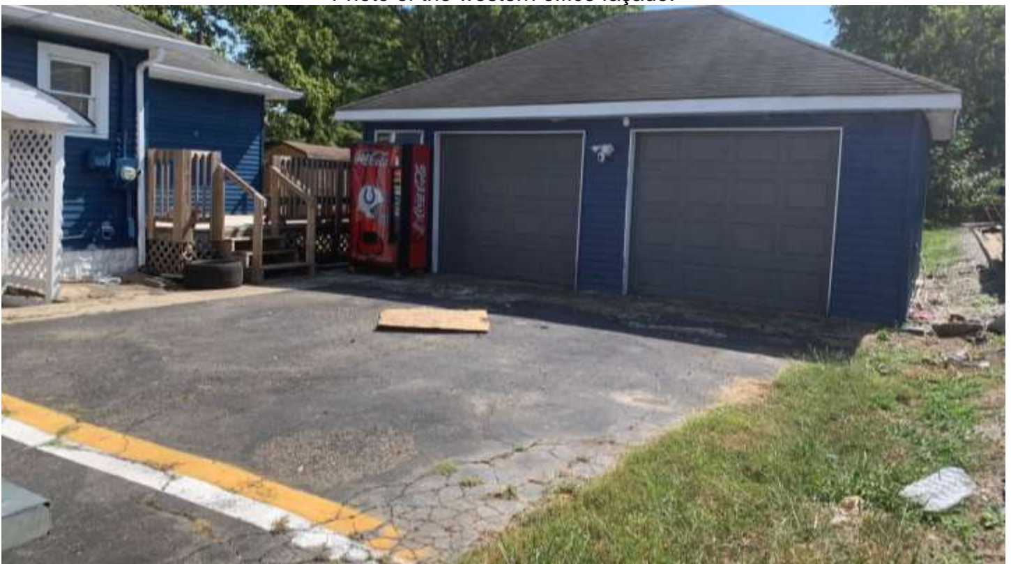
Photo of the existing garage on site.