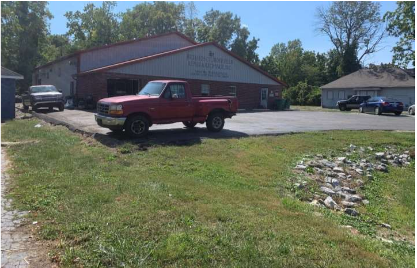
Photo of the commercial property west of the site.