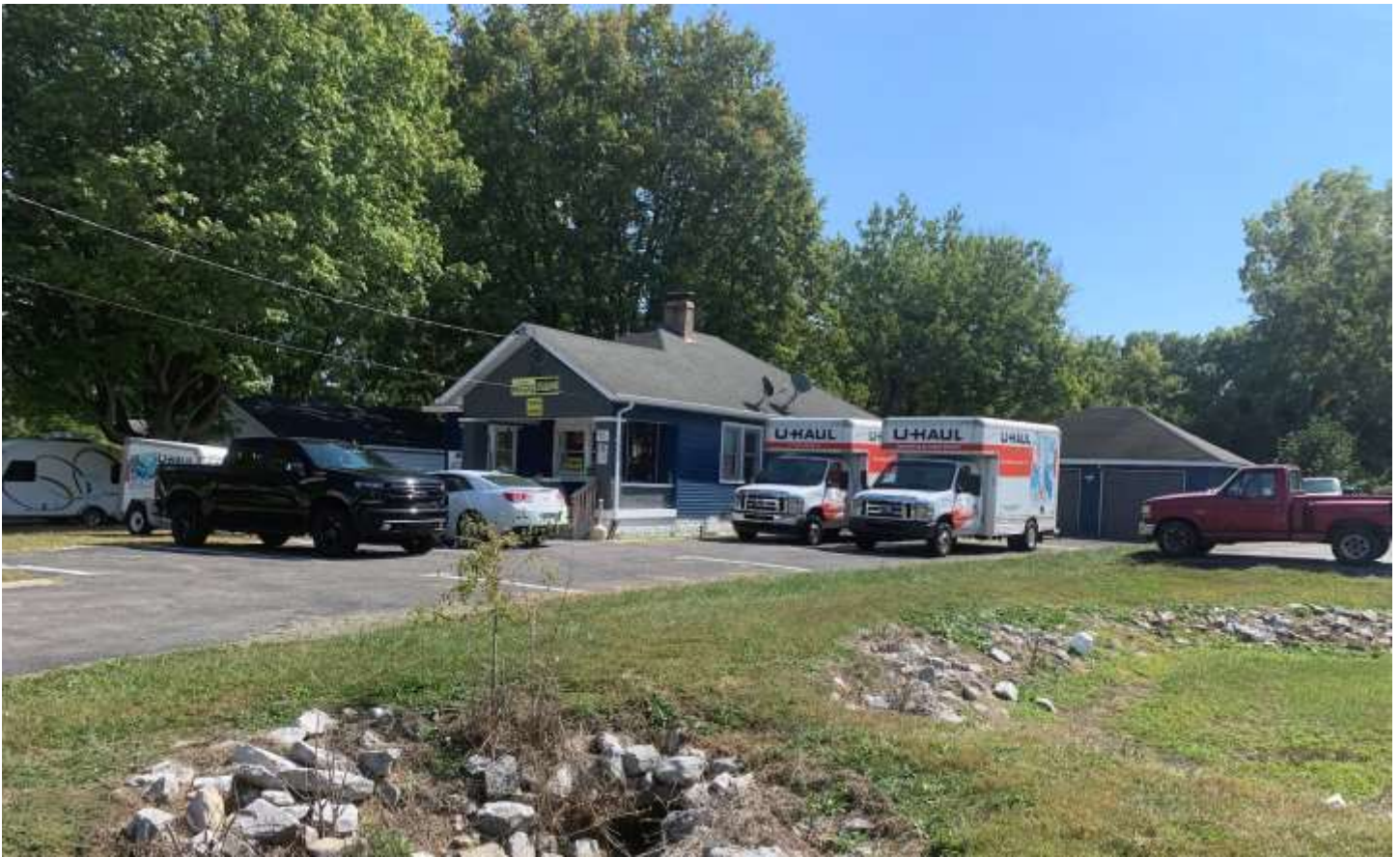
Photo of the outdoor storage of commercial vehicles on site.