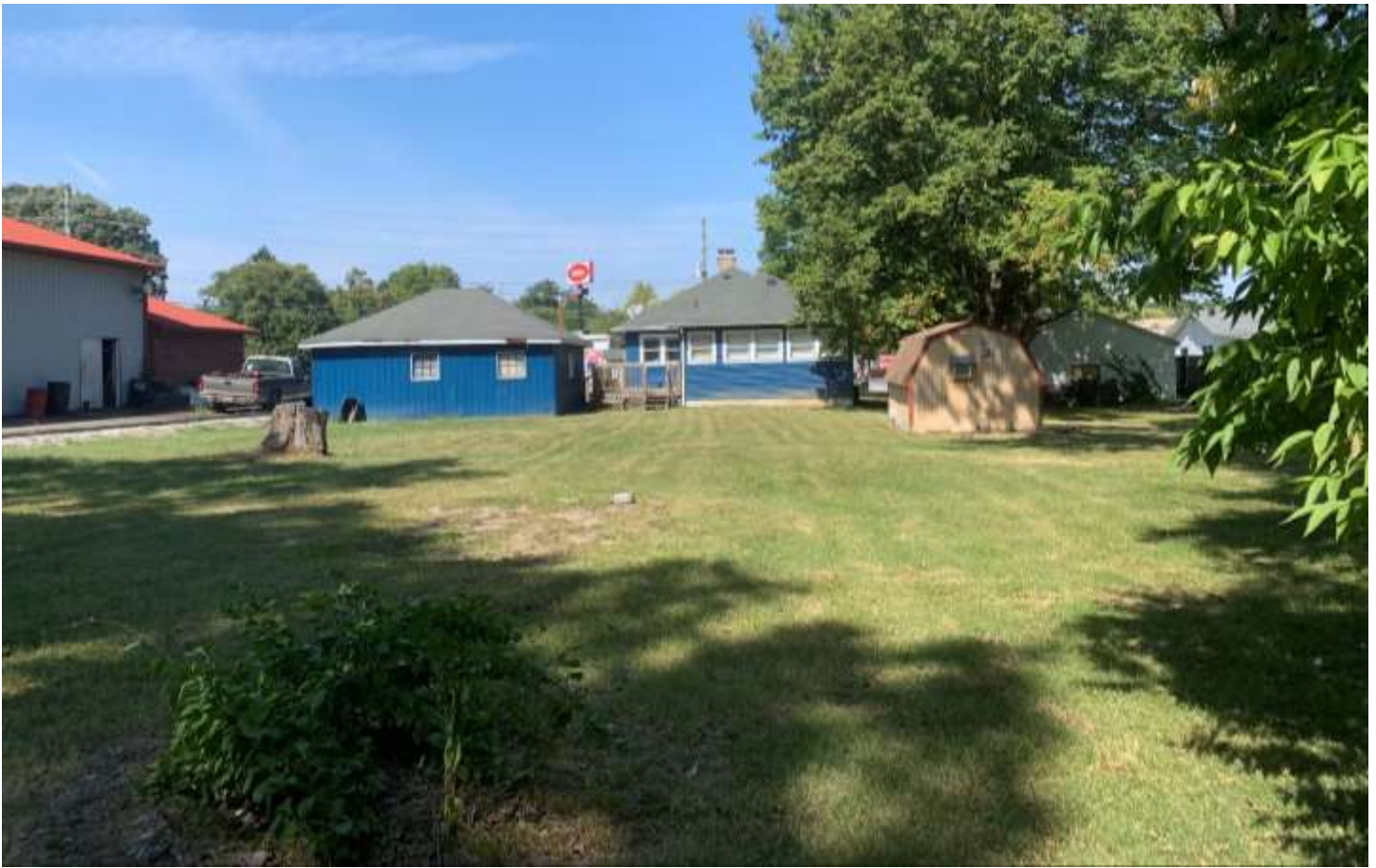
Photo of the property at 6345 West Thompson Road looking north.