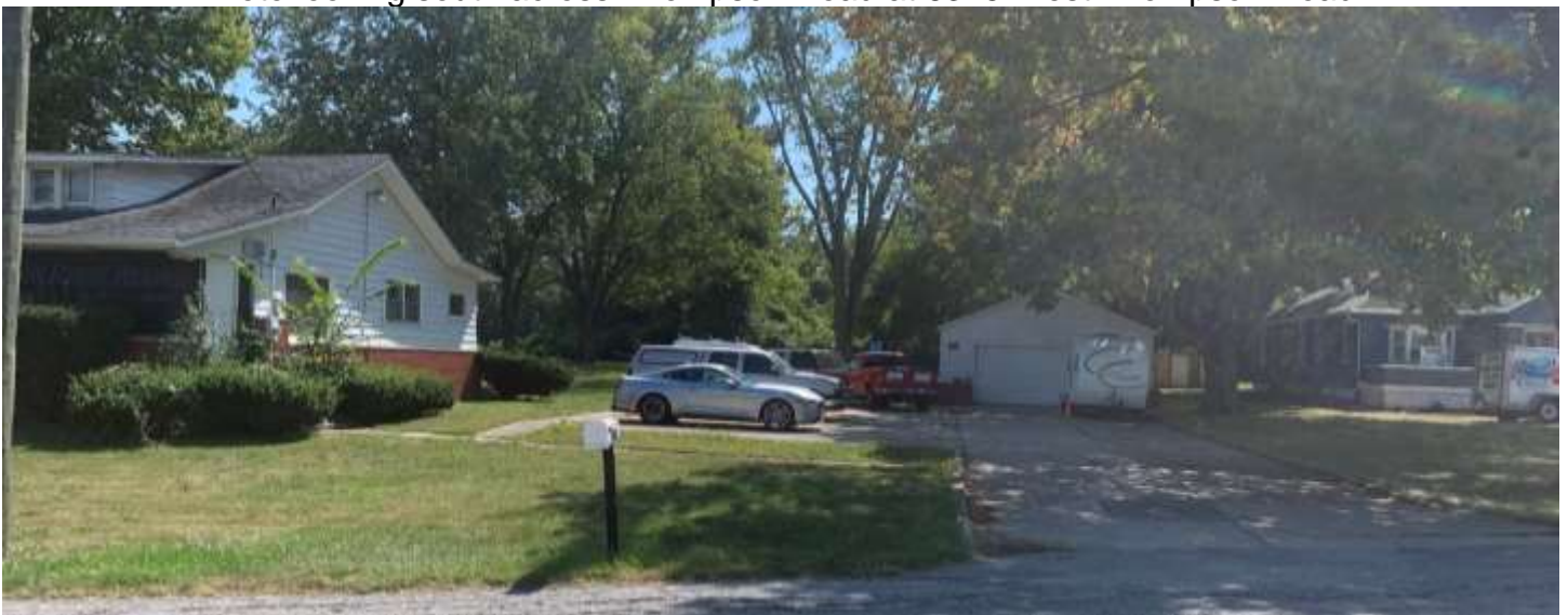
Photo looking south across Thompson Road at 6333 West Thompson Road.