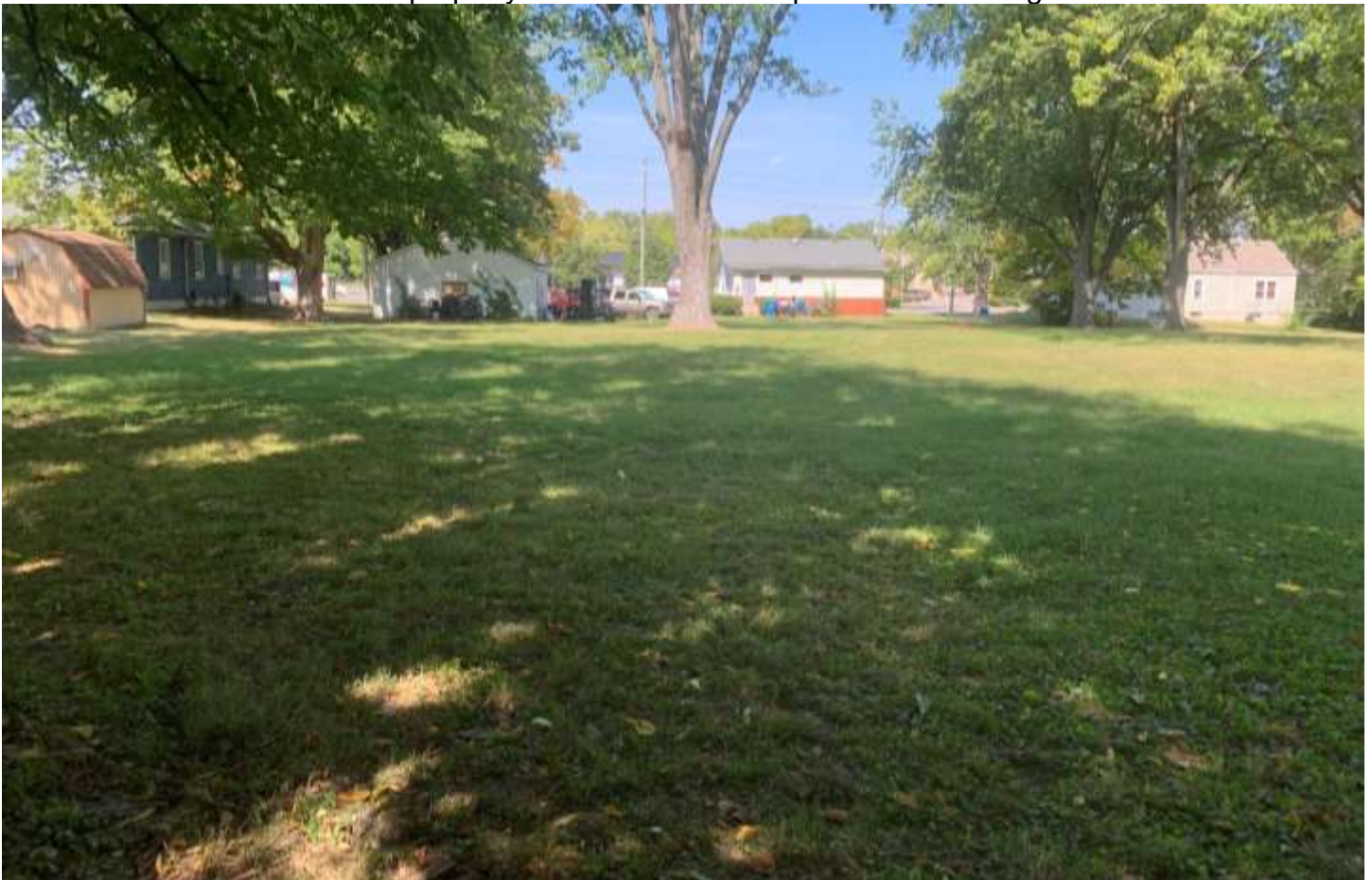
Photo of the property at 6333 West Thompson Road looking north.