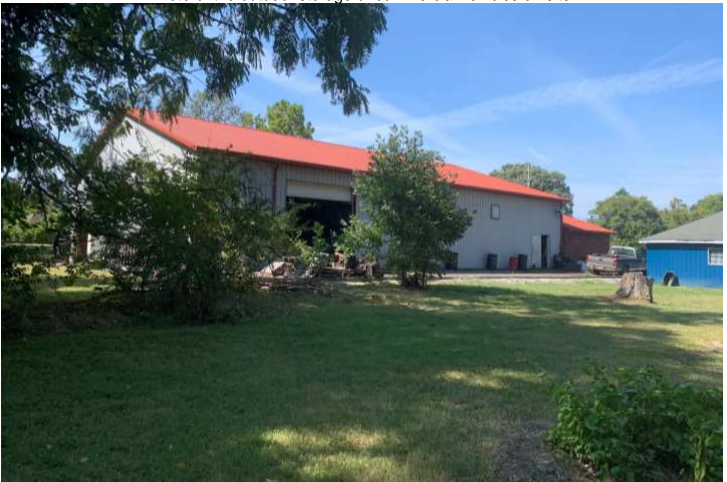
Photo looking west towards the adjacent property.