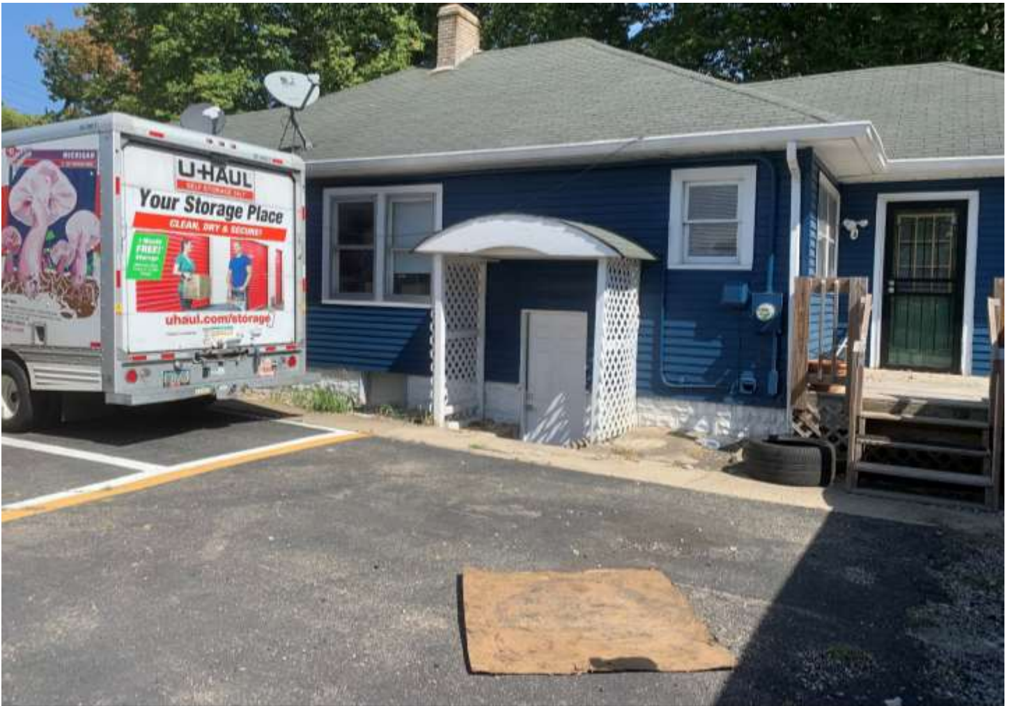
Photo of the western office façade.