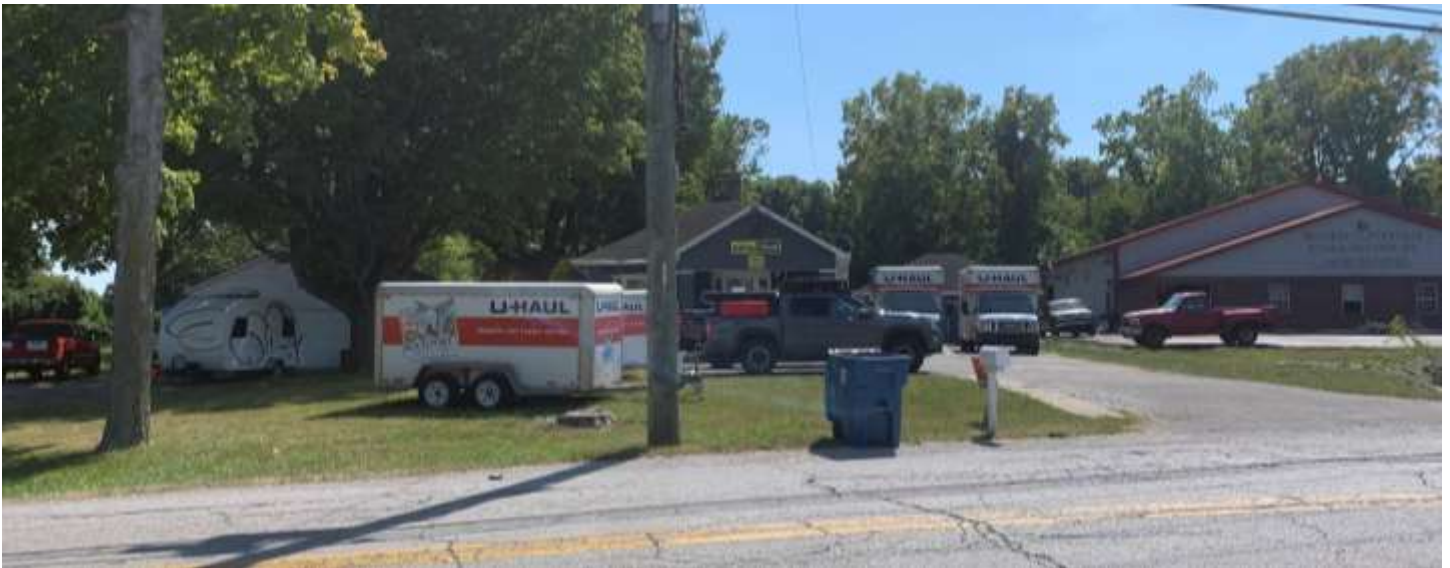
Photo looking south across Thompson Road at 6345 West Thompson Road.