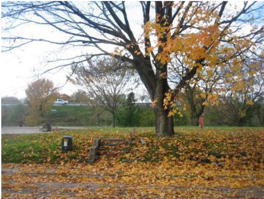
Undeveloped subject site, looking west.