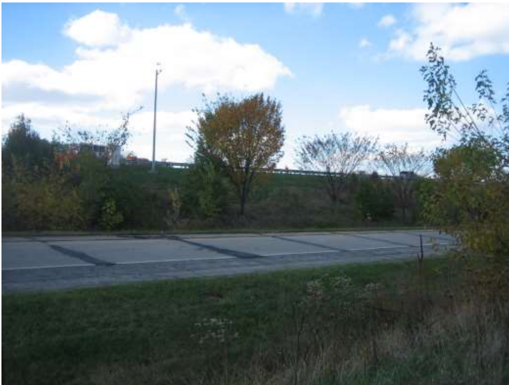
Interstate I-65 northbound exit ramp to the west of subject site.