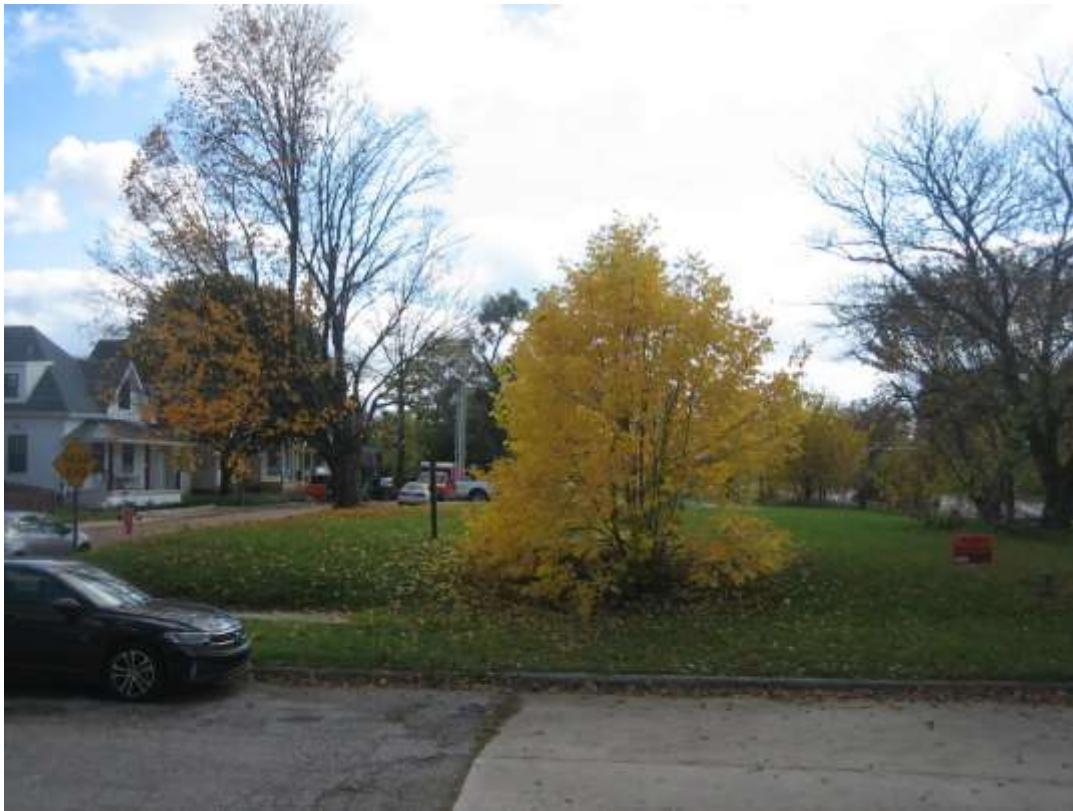
Undeveloped subject site, looking south.