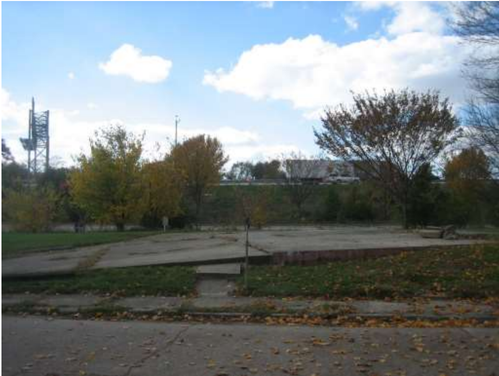
Adjacent undeveloped lot to the south of subject site, looking west.