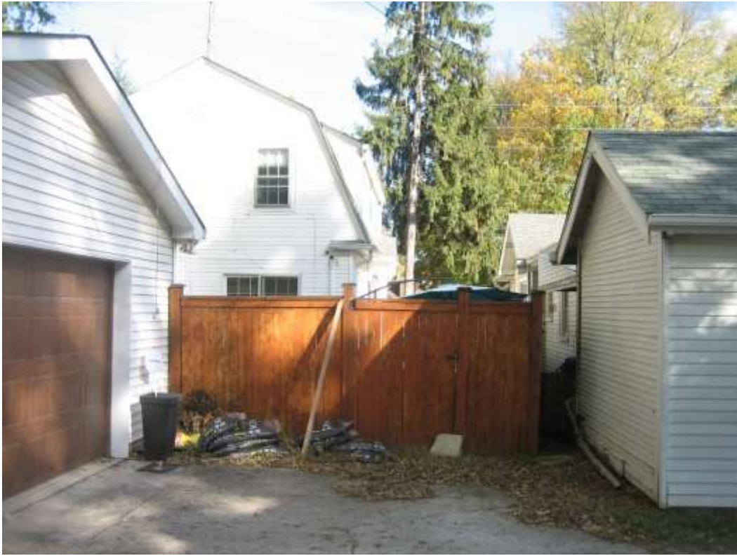
Subject site existing six-foot rear fence, eight-foot fence proposed, looking east.