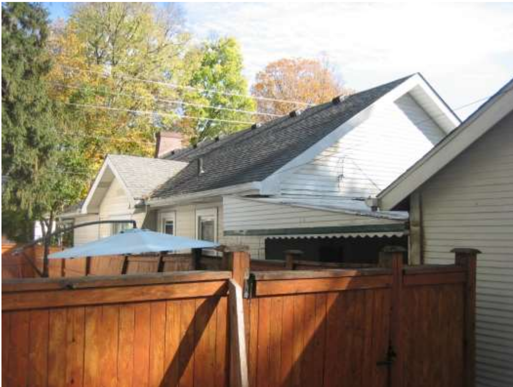
Subject site existing six-foot rear and south side fence, eight-foot fence proposed, looking southeast.