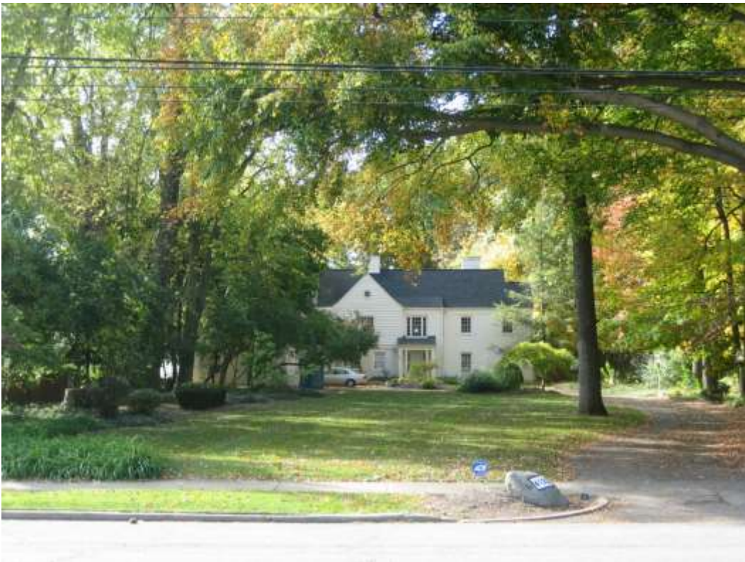
Adjacent property to the north, looking west.