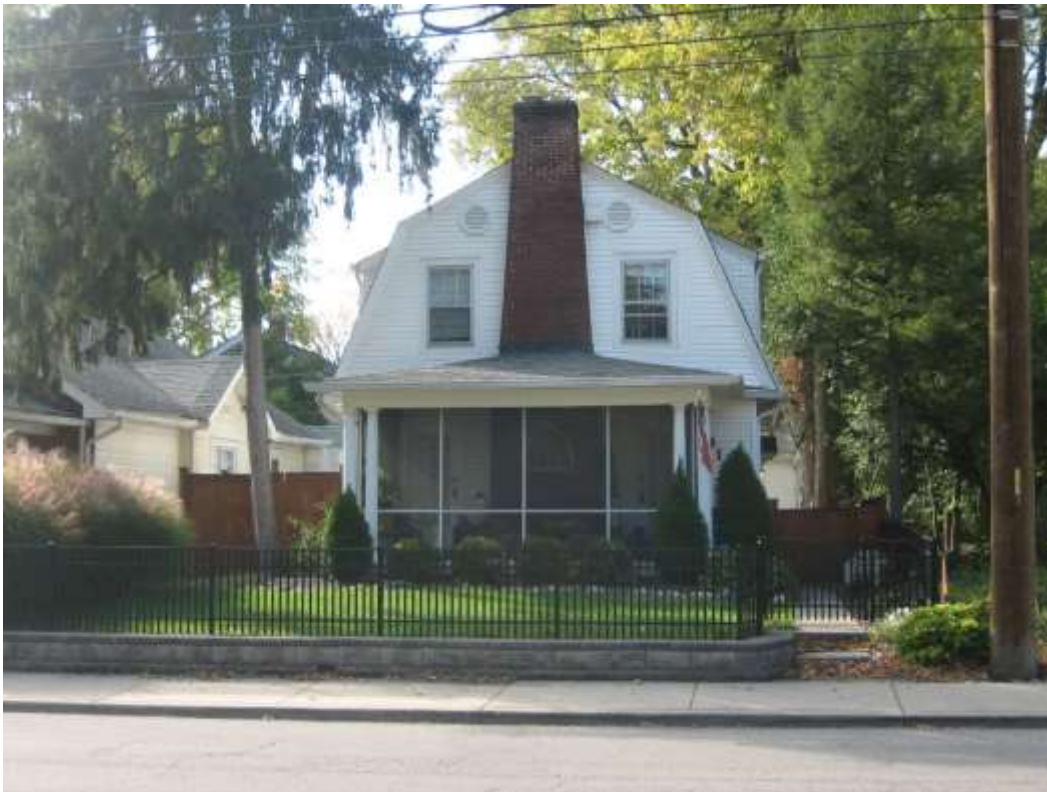
Subject sit, looking west