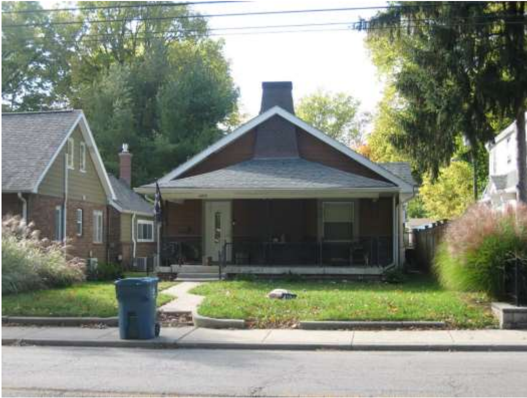
Adjacent property to the south, looking west.