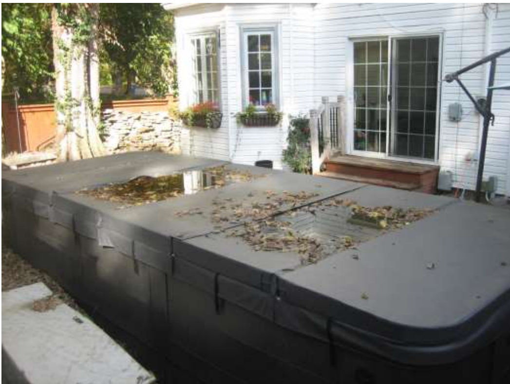
Subject site rear yard swimming pool/swim spa, looking northeast