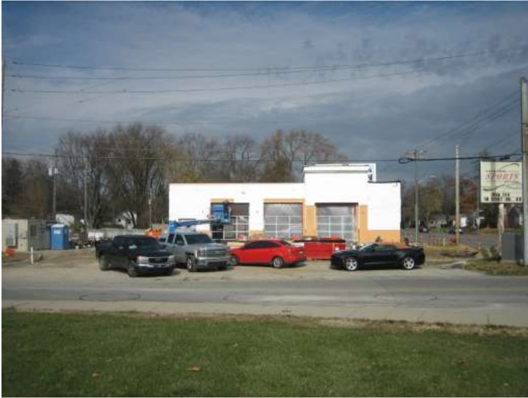
View of subject site, proposed building under construction, looking north from East 56 th Street.