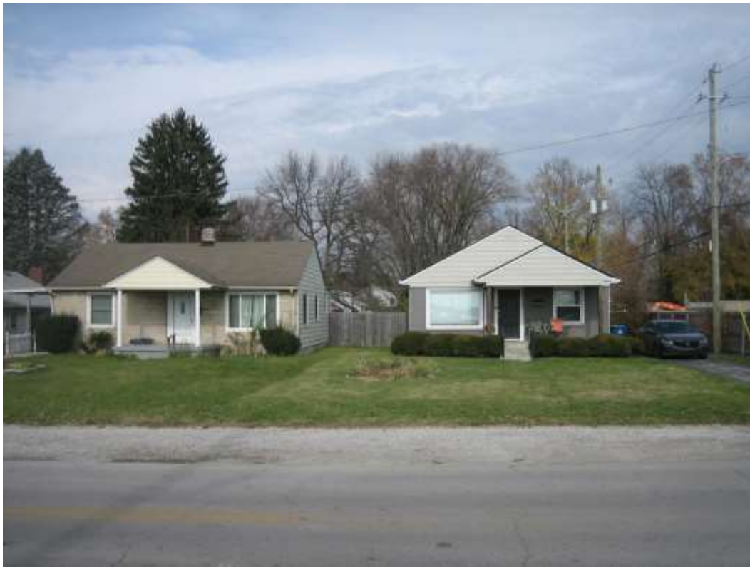
View of adjacent single family residential to the west, looking north.