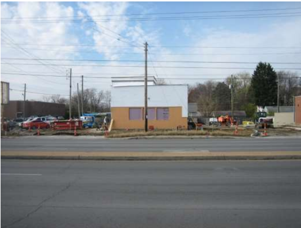
View of subject site, proposed building under construction, looking west from North Keystone Avenue.