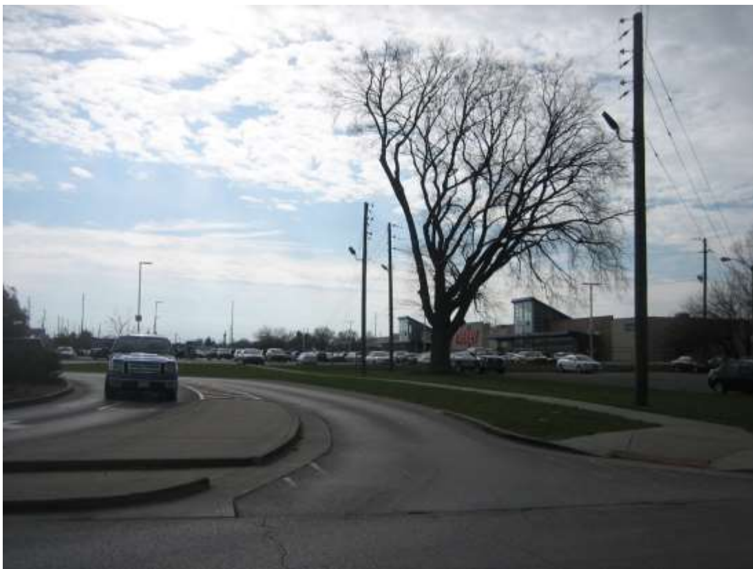
View of adjacent integrated commercial center to the south.