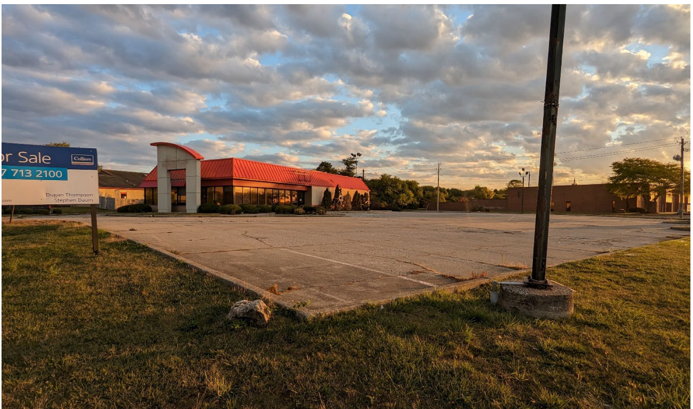
Photo of the Subject Property, view from south