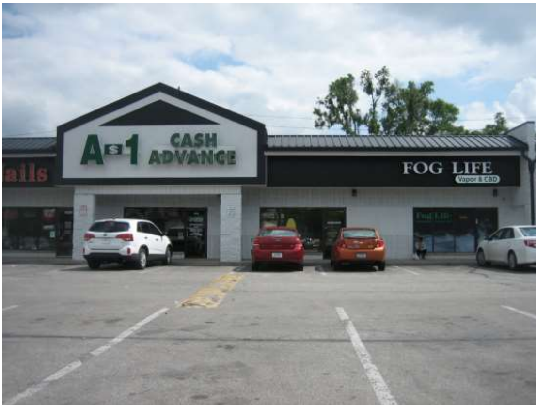
1. Subject site tenant bay, looking south.