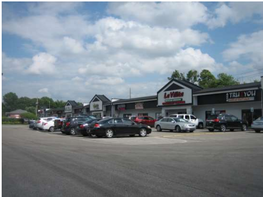
2. Subject site, looking southeast