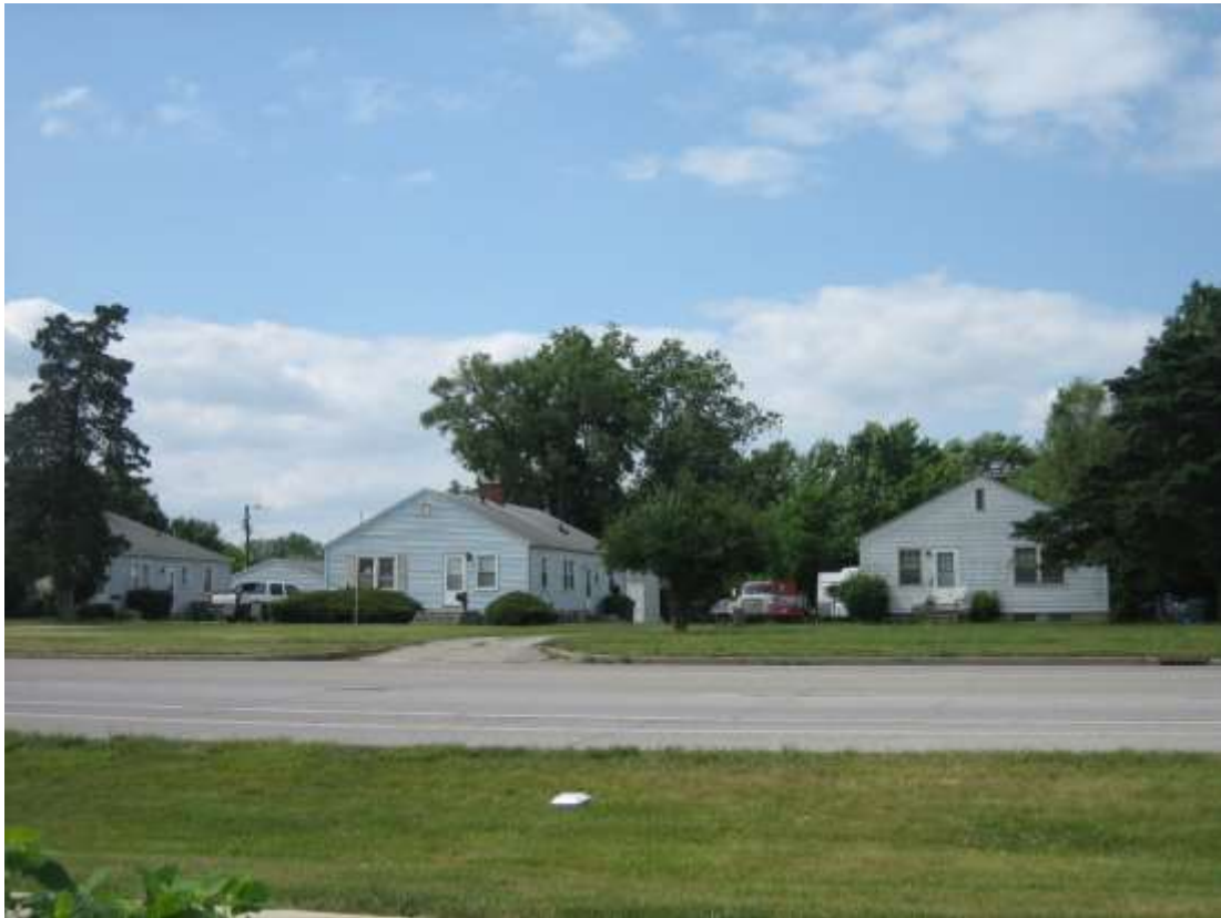
3. Protected district to north