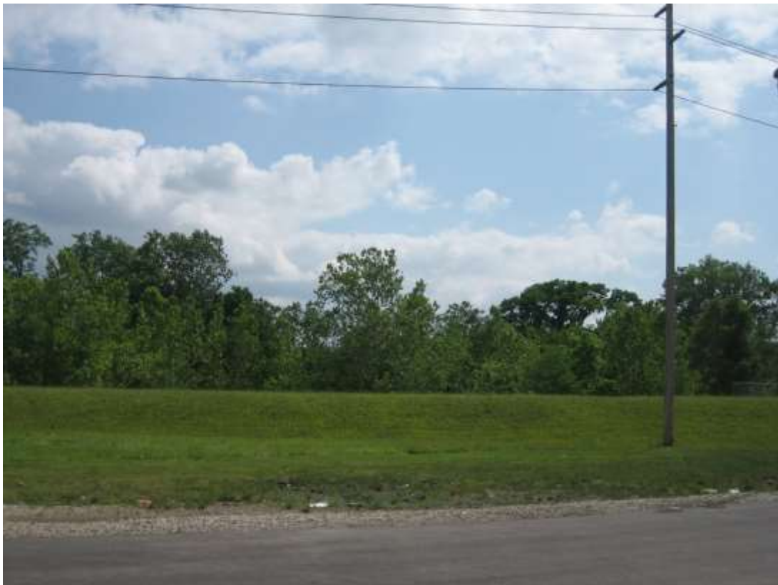
4. Rear of the site, adjacent to south