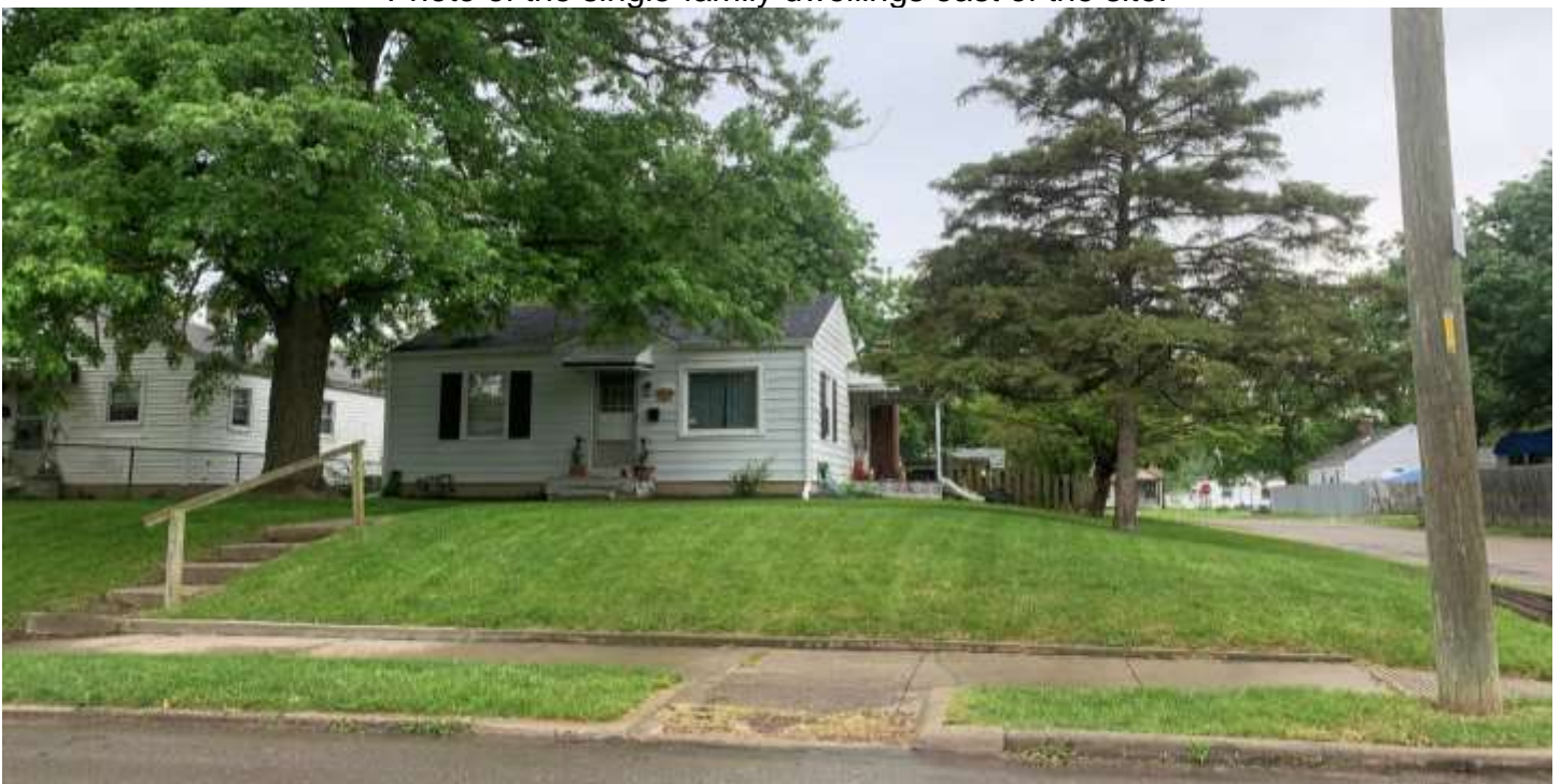
Photo of a corner lot that could potentially be a two-family dwelling, but this was not confirmed.