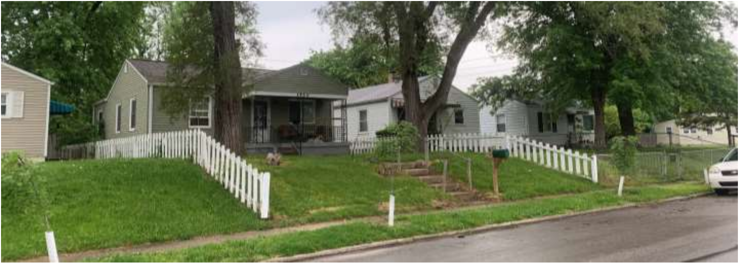
Photo of the single-family dwellings north of the site.