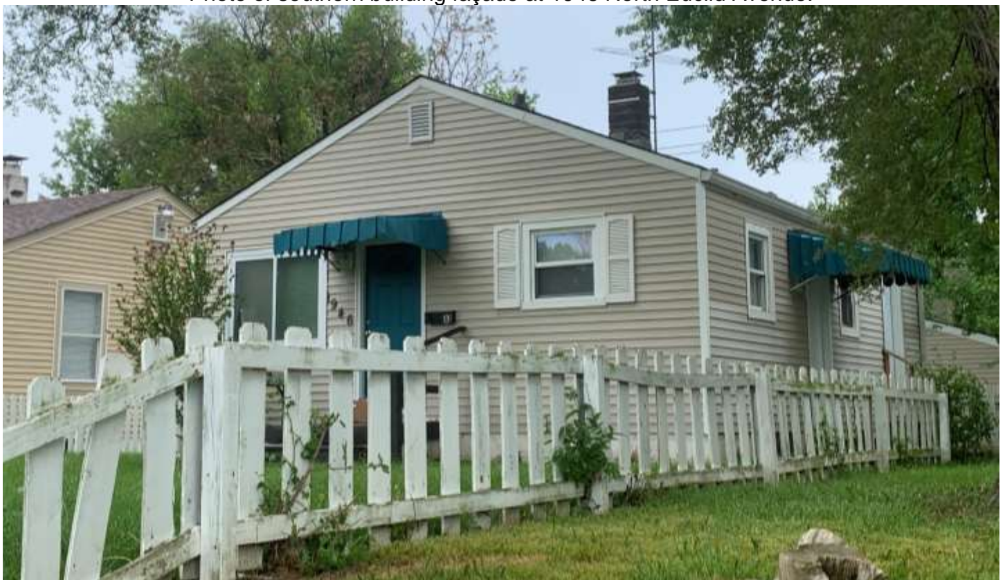
Photo of the northern buiding façade at 1946 North Euclid Avenue.