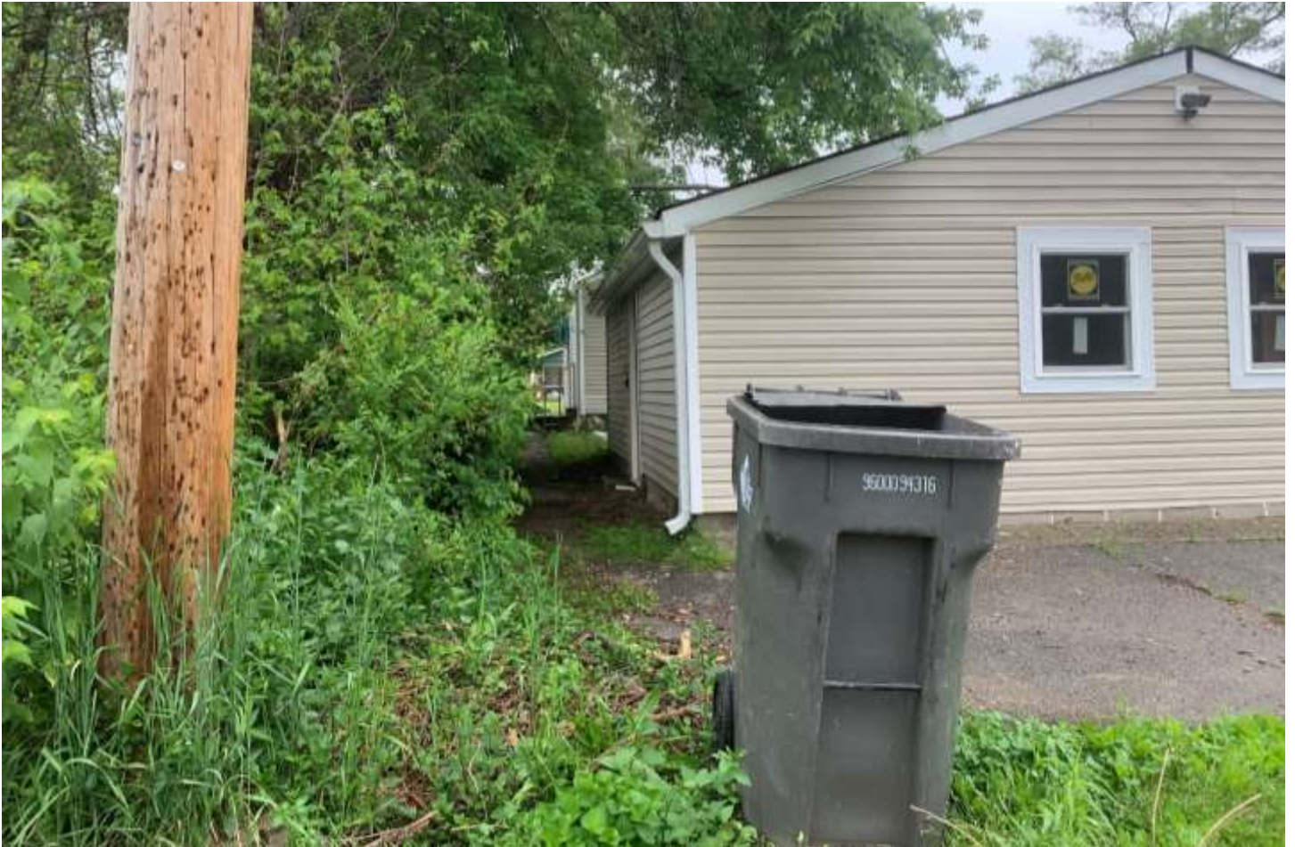
Photo of the detached garage and north side setback.