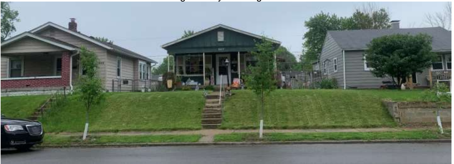
Photo of the single-family dwellings east of the site.