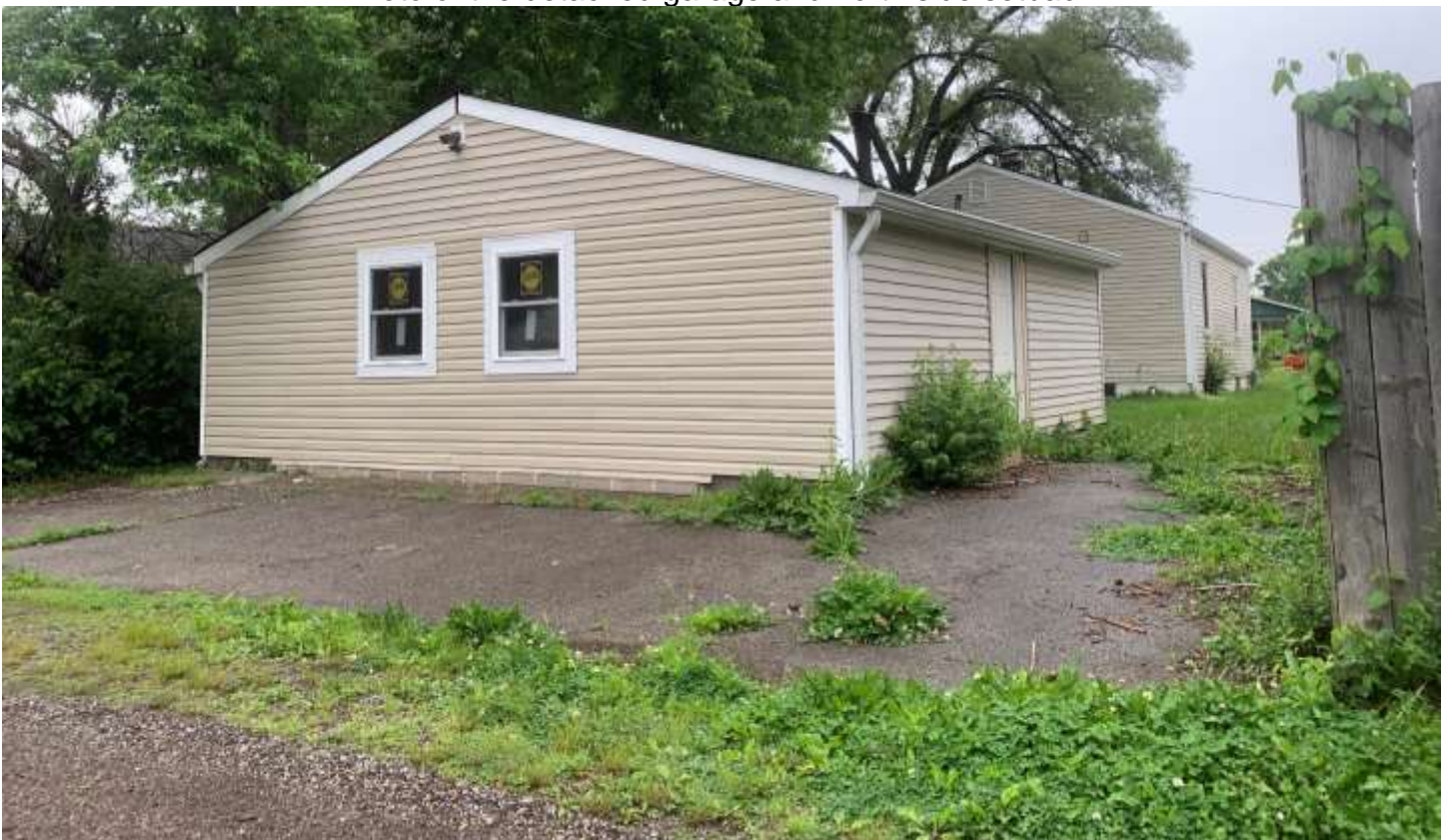
Photo of the detached garage and south side setback.