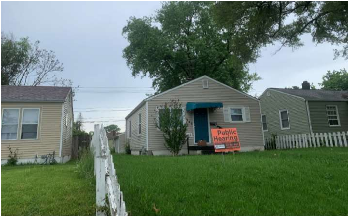
Photo of southern building façade at 1946 North Euclid Avenue.