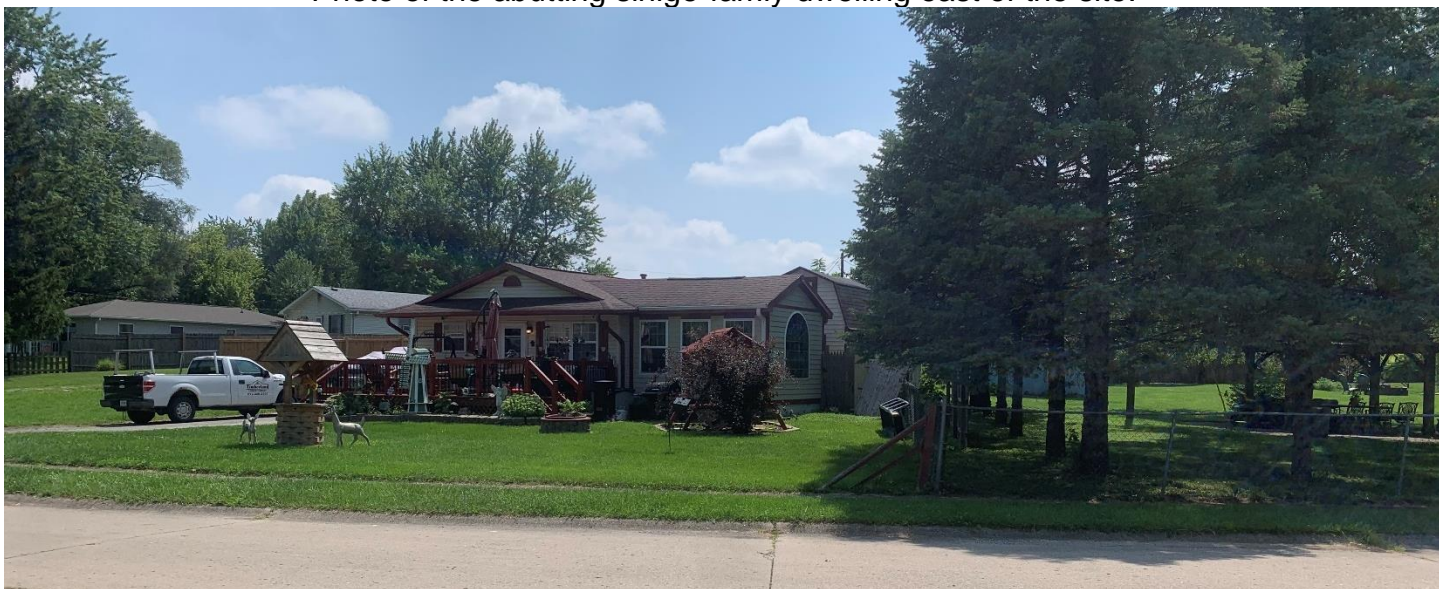
Photo of the single-family dwelling south of the site across Merts Drive.