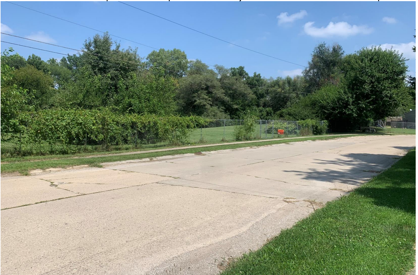
View of the entire street frontage along Merts Drive in the rezone request.