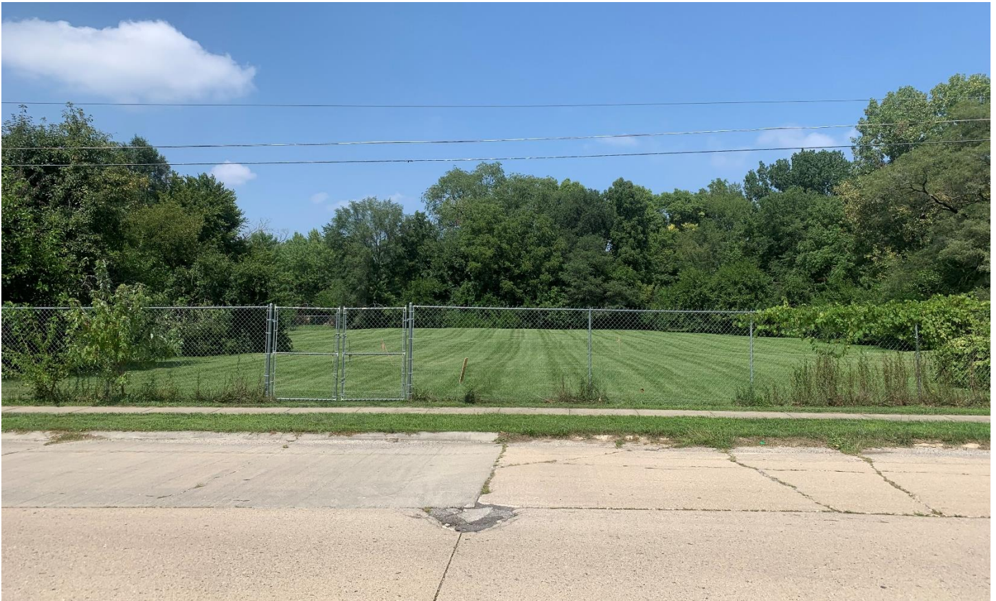
Photo of the undeveloped southwest portion of the subject site included in the rezone request.