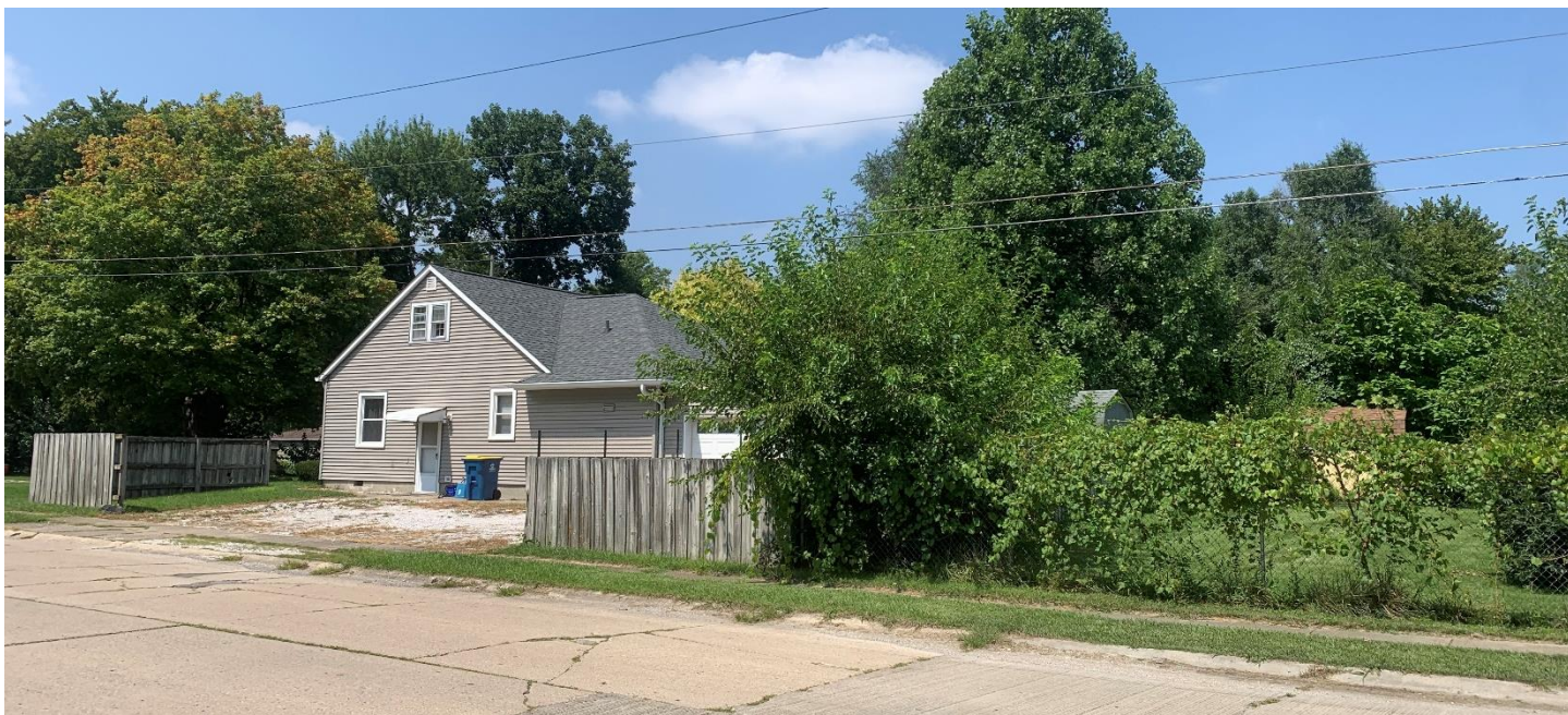
Photo of the abutting single-family dwelling west of the site.