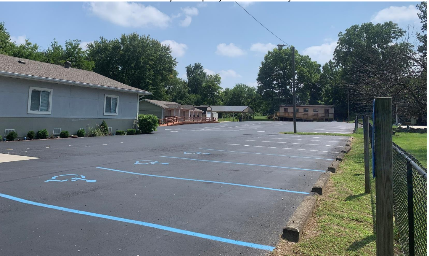
View of the church parking lot looking south at the portion of the site not included in the request.