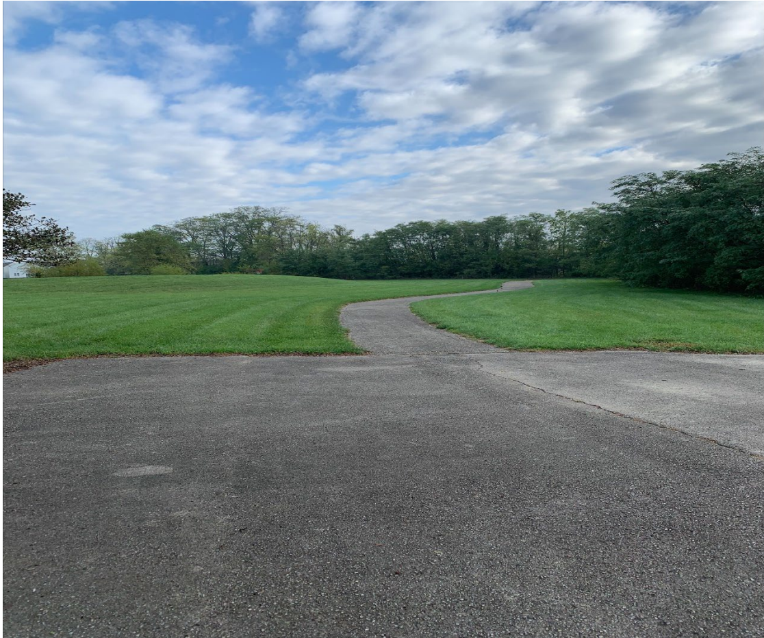
3 Multi-Purpose Path heading towards Loudon Place Subdivision, west of subject site.