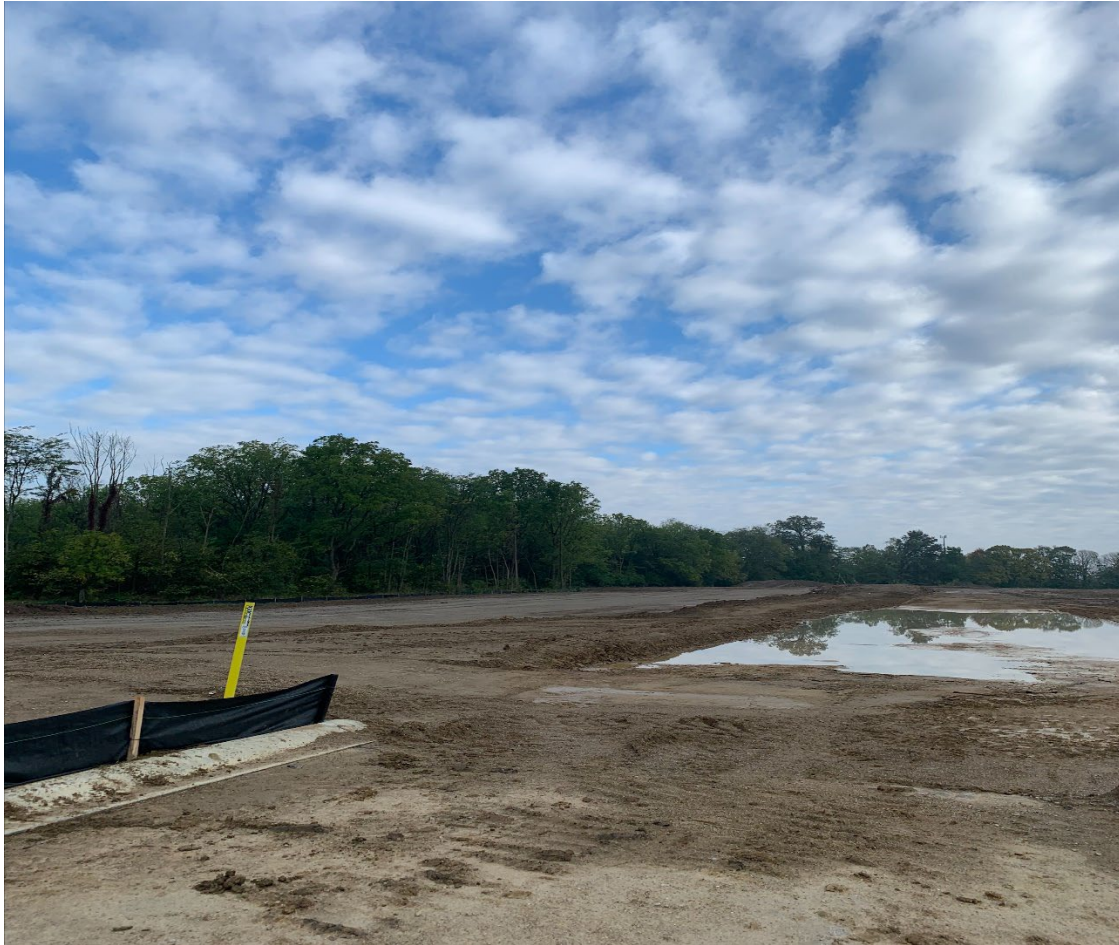
1 View from Clifton Trace of Clifton North