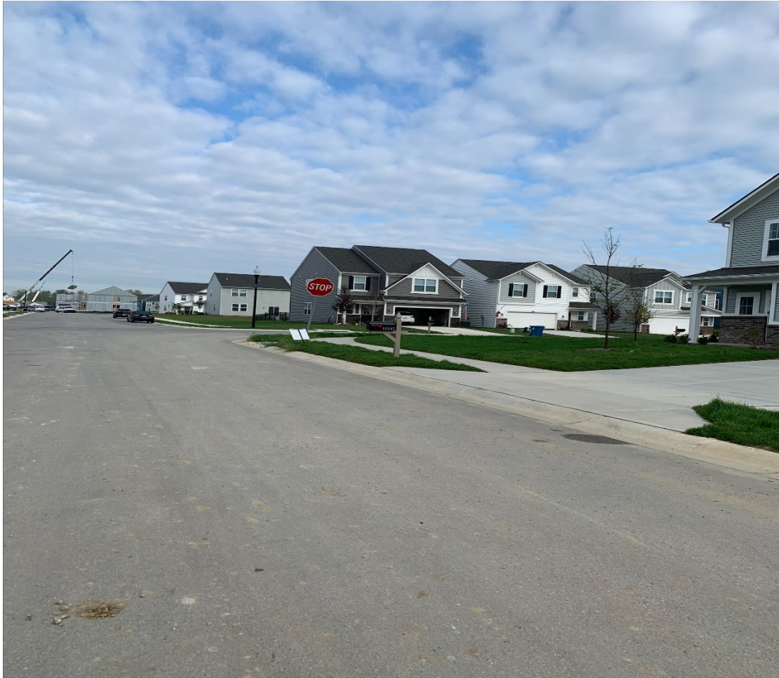
2 Entrance to Clifton Trace North looking at Louden Place