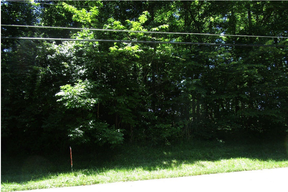
View of site looking west across Knollton Road