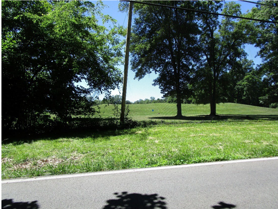
View of site looking west across Knollton Road