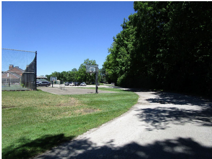
View of site looking north along drive that abuts the western site boundary