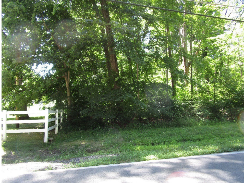
View of site looking west across Knollton Road