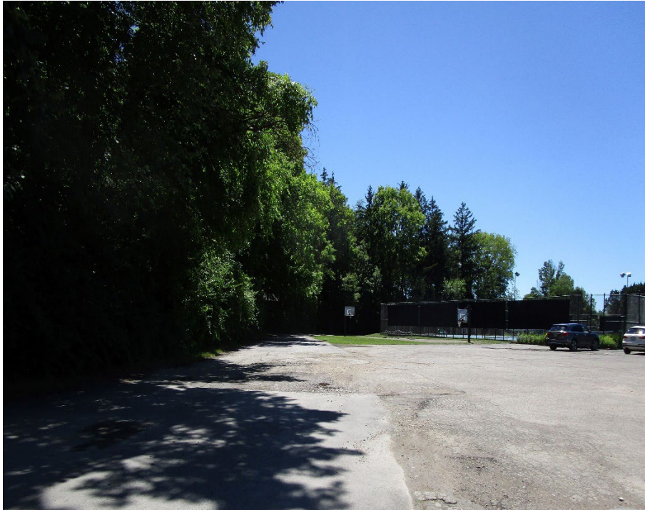
View of site looking south along drive that abuts the western site boundary