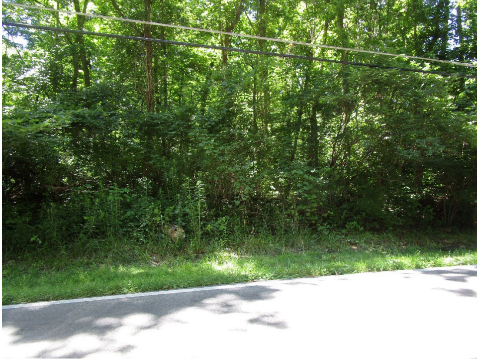
View of site looking west across Knollton Road