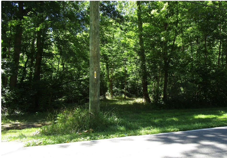
View of site looking west across Knollton Road