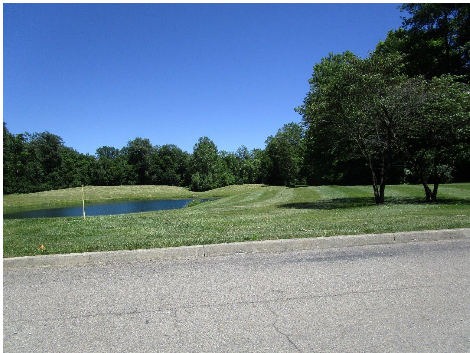
View of site looking east across existing driving range