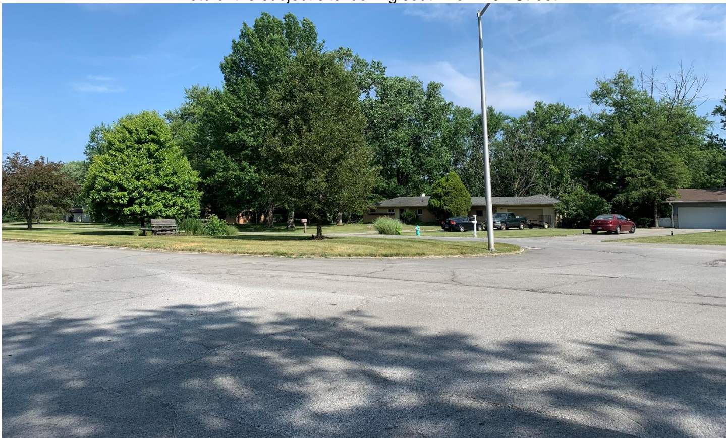
Photo of single-family dwellings north of the site across 70 th Street.