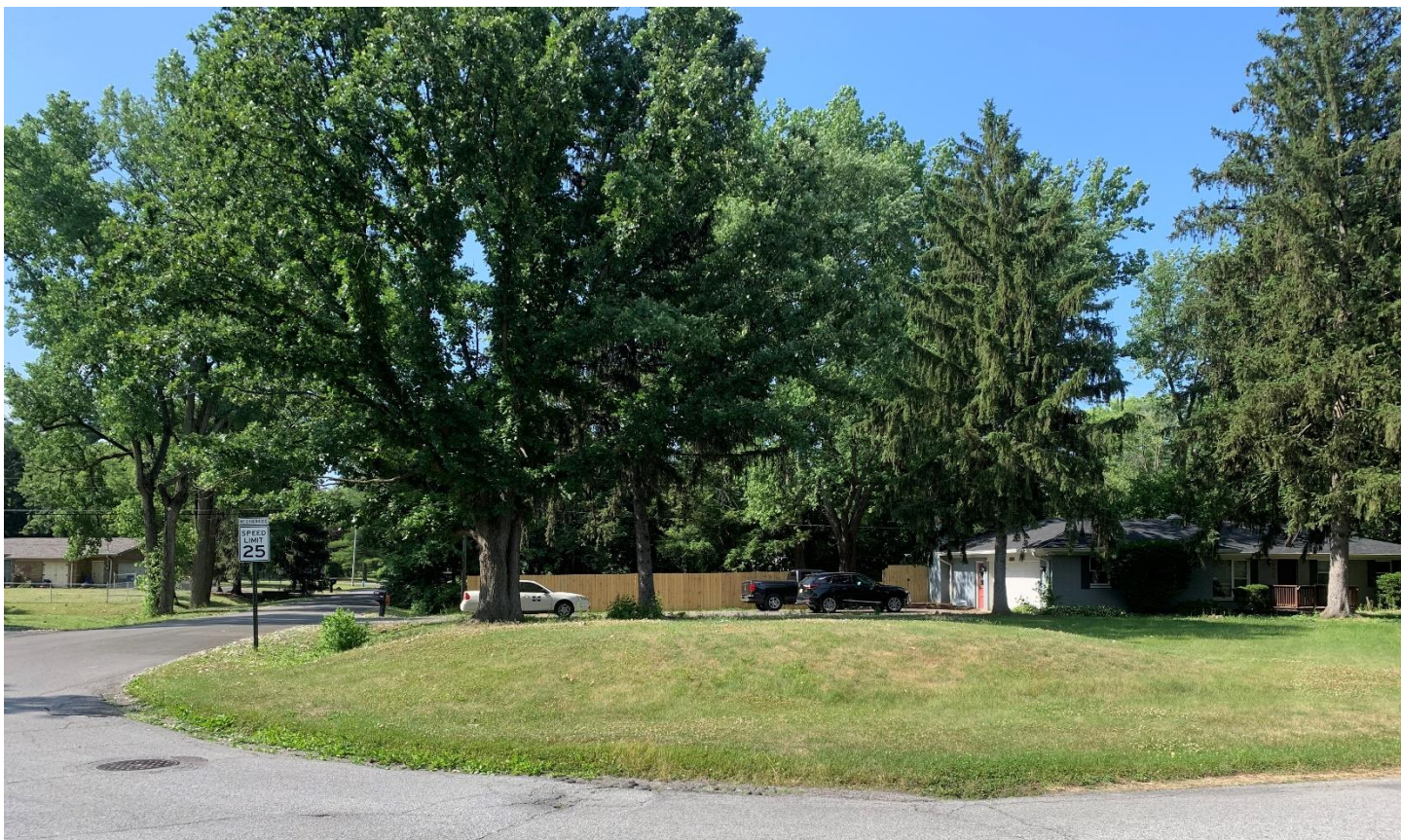
Photo of the subject site looking south from 70 th Street.