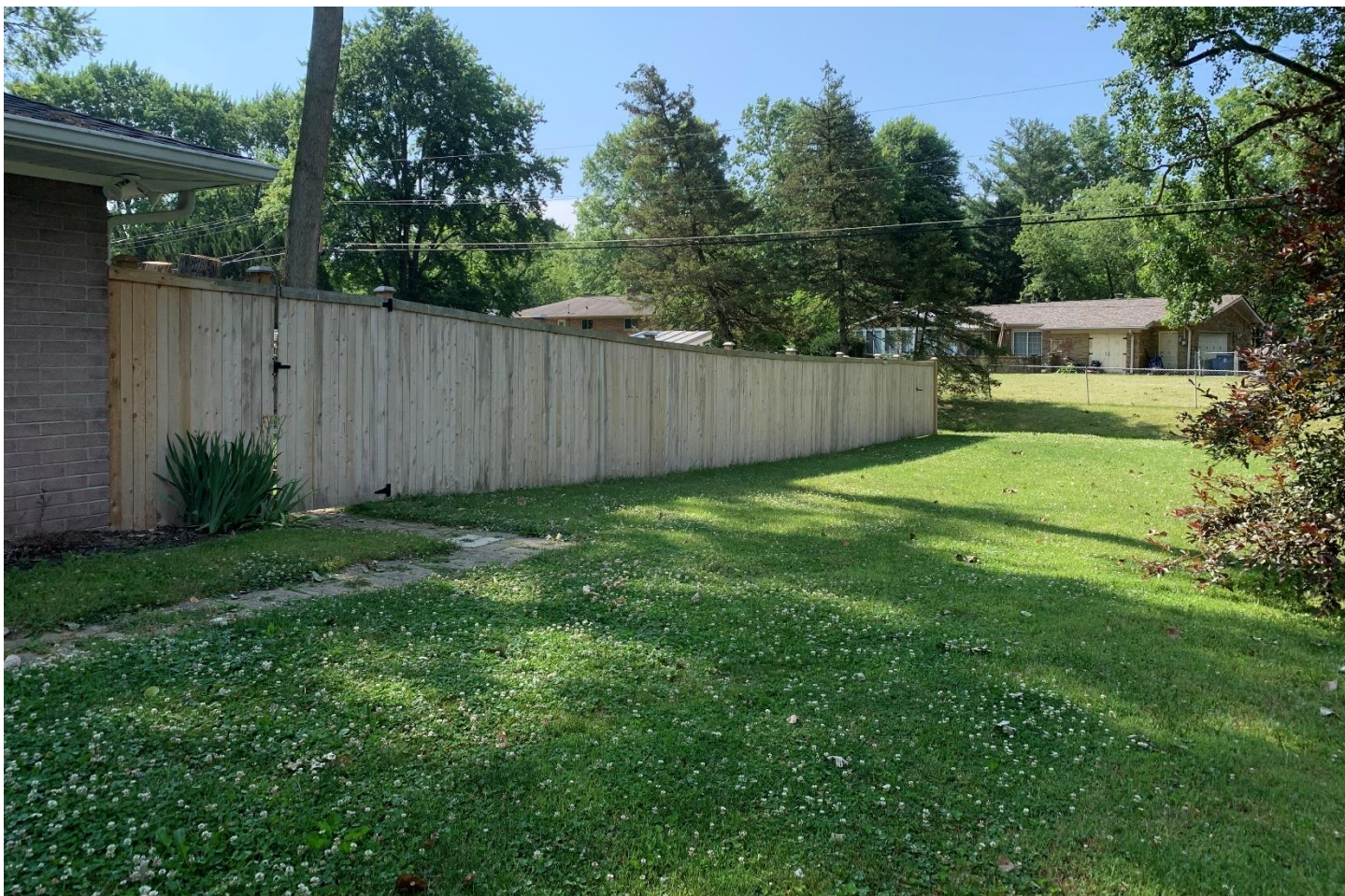
Photo of a compliant privacy fence not within the front yard of the corner lot east of the site.