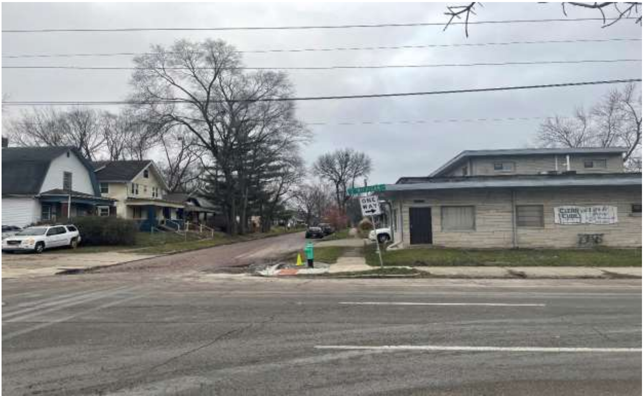
Photo Three: Facing South Along Euclid Avenue, Across Michigan Street