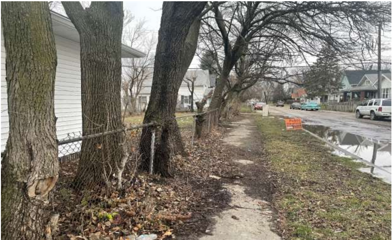
Photo Four: Looking North Along Euclid Avenue, Subject Site On Left