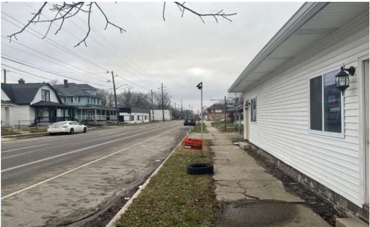
Photo Two: Looking West Along Michigan Street – Subject Site On Right