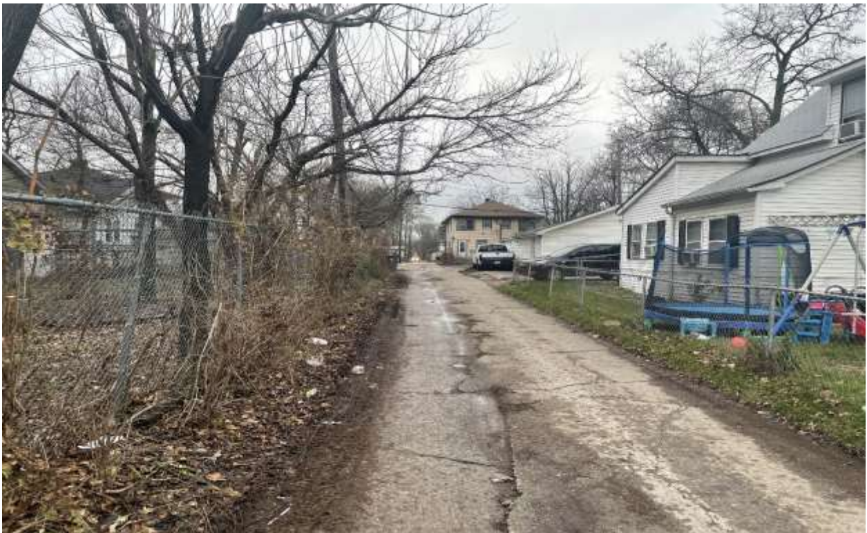
Photo Six: Looking West Along Improved Alley, Subject Site On Left