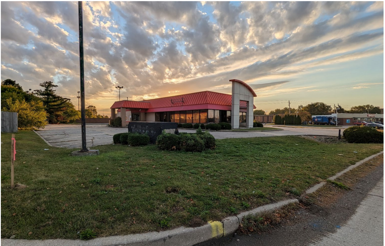
Photo of the Subject Property, view from north