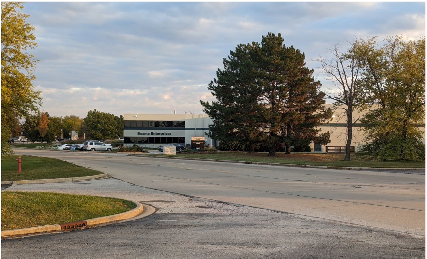
Industrial site north of subject site