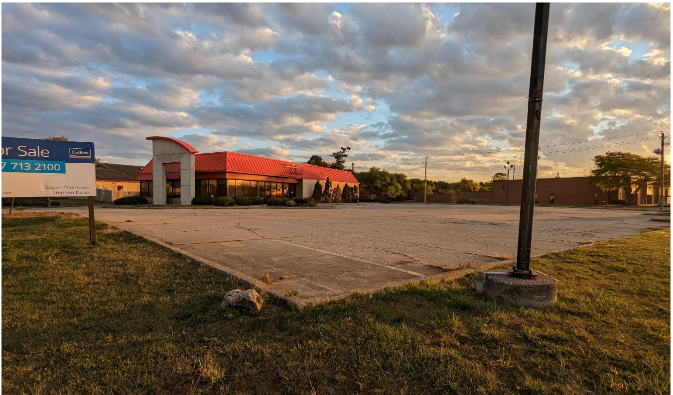
Photo of the Subject Property, view from south