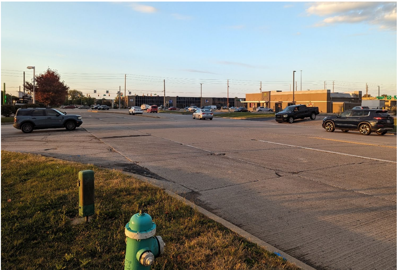
View south (Woodland Dr/71 st St)