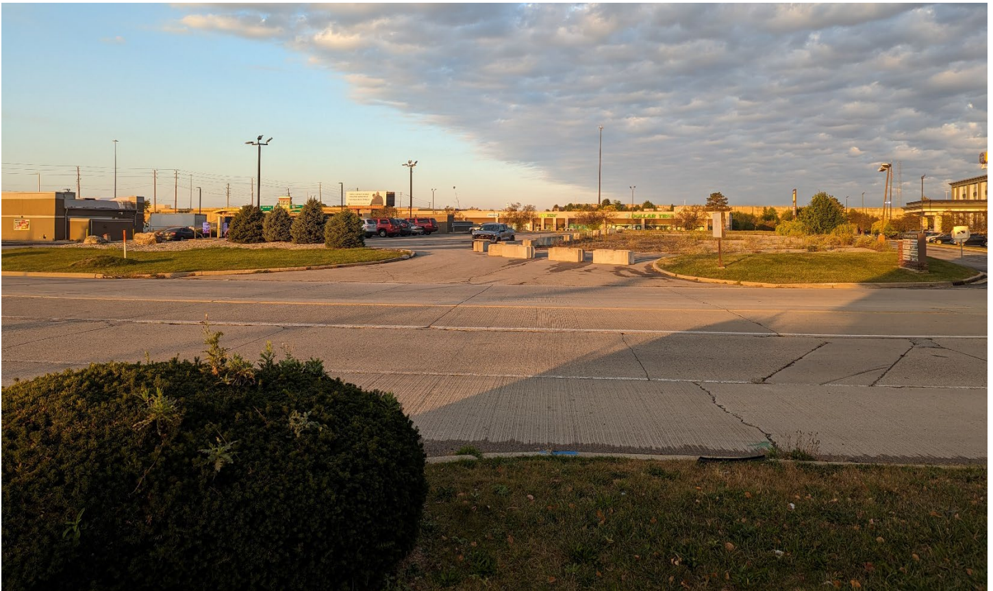
View west from site