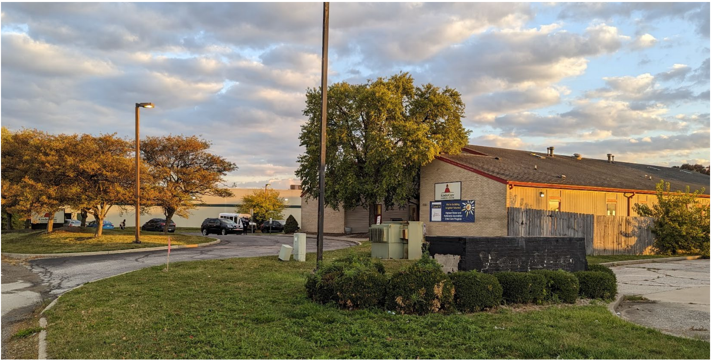
View of north neighbor site (child day care)