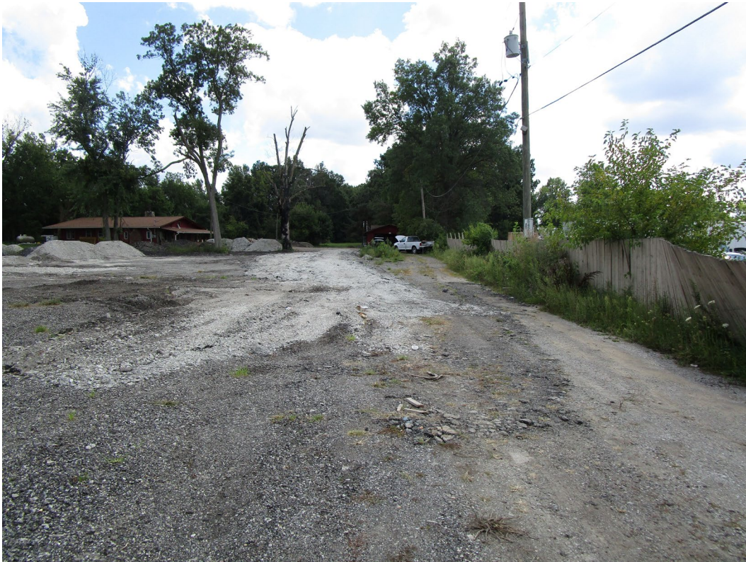
View of site looking south