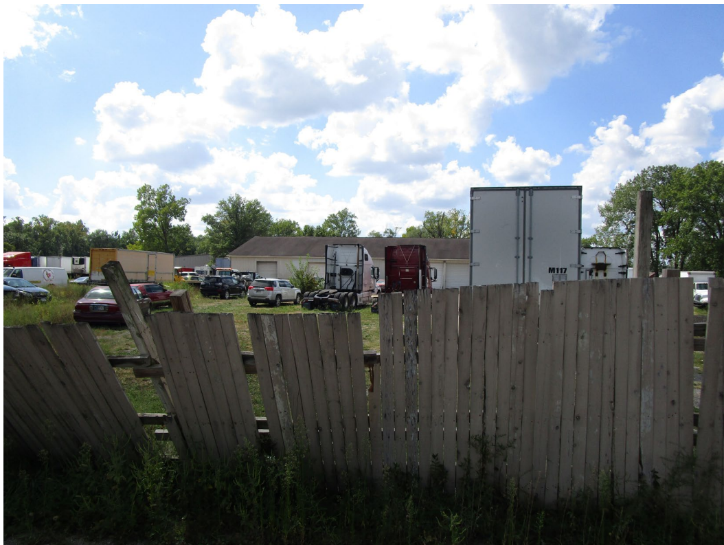
View from site looking west at adjacent uses