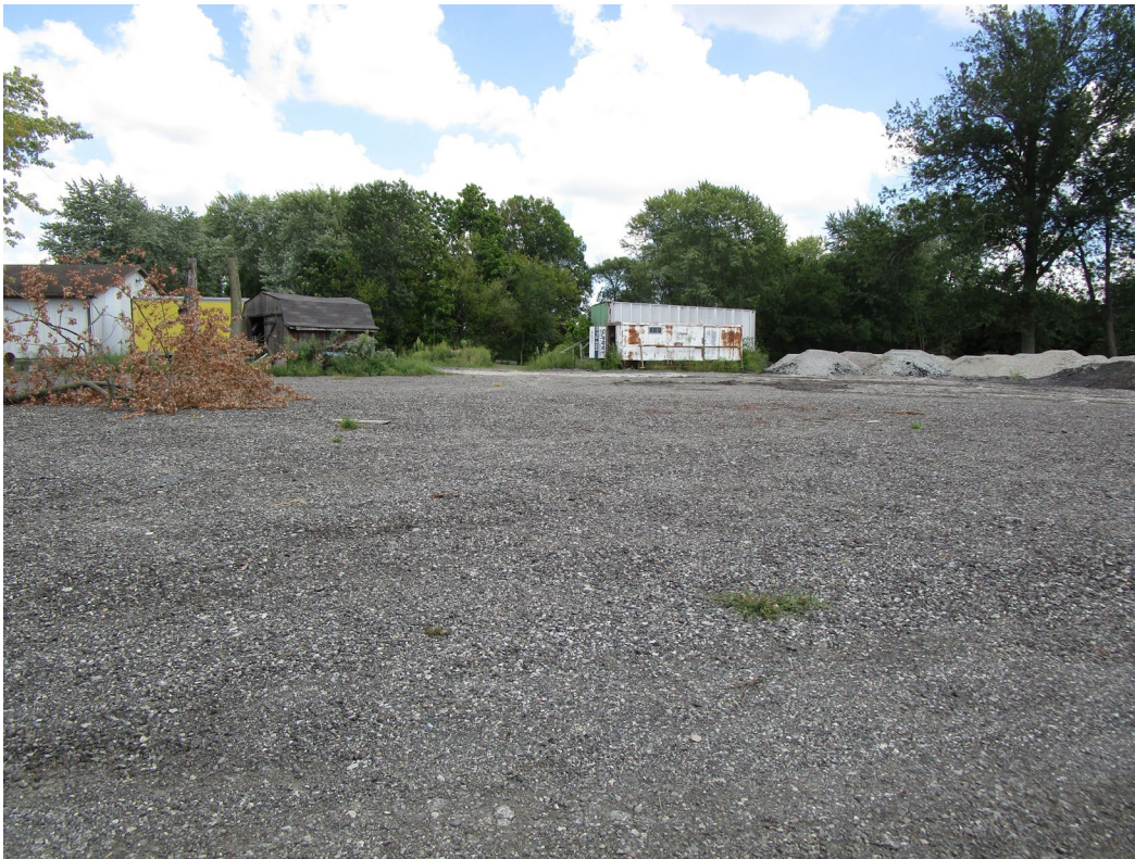
View of site looking east