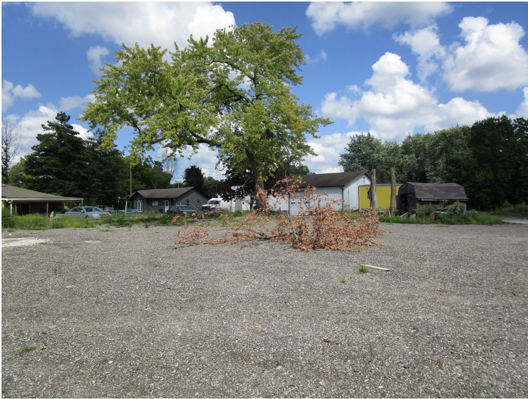
View of site looking northeast