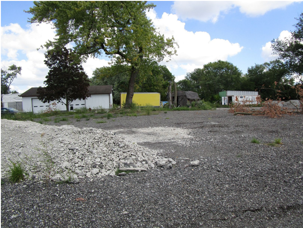
View looking east