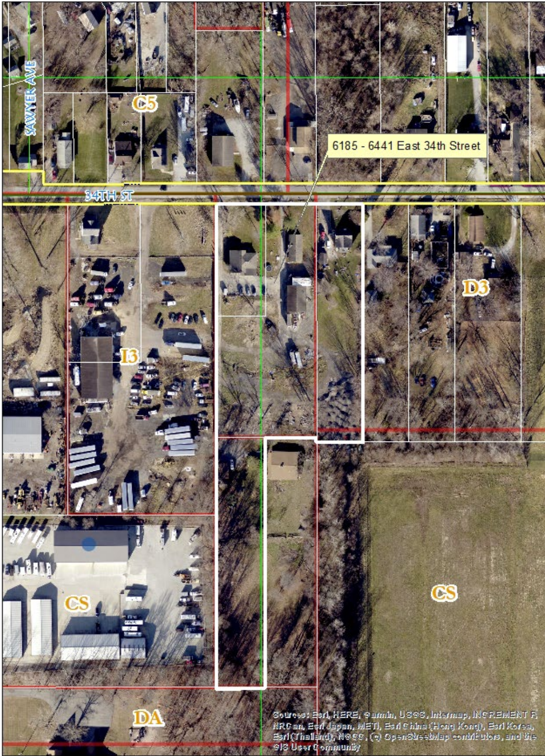
6185, 6421, 6423 and 6441 East 34th Street