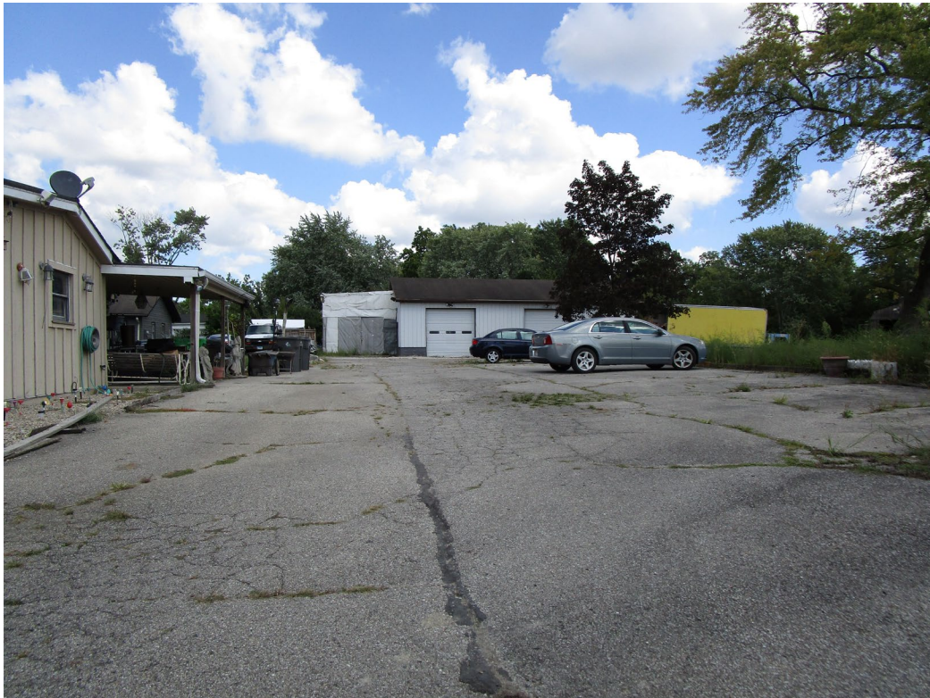
View looking east